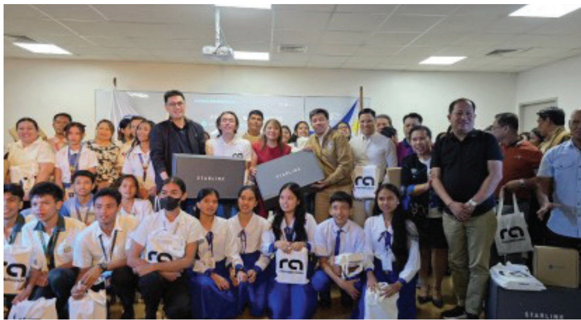
DIGITAL TOOLS. iACADEMY and Republic Asia donate 100 computer tablets and three Starlink internet kits to eight schools in underserved areas in Cebu at the iACADEMY Cebu campus in Cebu City on April 11, 2025. The Department of Education on Monday (April 14) lauded the private sector for partnering with the government to ensure accessibility to digital tools.

On the same day, the rest of the country will experience partly cloudy to cloudy skies, with a chance of brief rain showers or thunderstorms, mostly in the eastern section. (PNA)