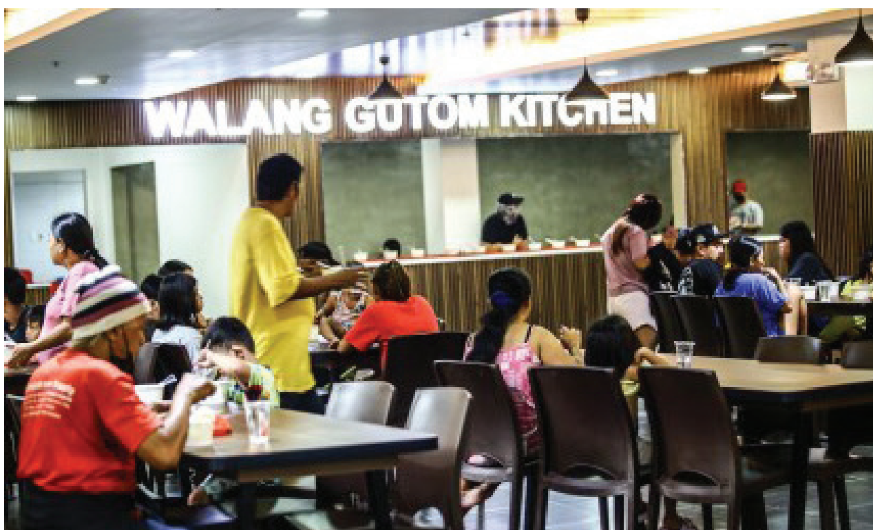
Department of Social Welfare and Development’s Walang Gutom (No Hunger) Kitchen in Pasay City