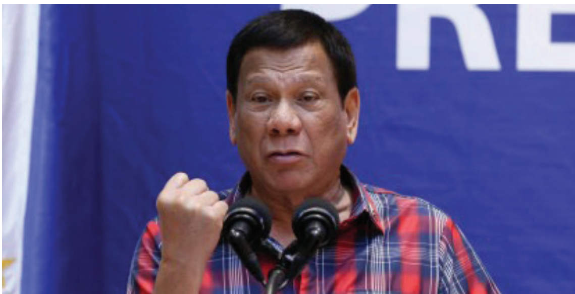
DARK ERA. The administration of Rodrigo Duterte placed the country in a "black" state, Palace Press Officer Claire Castro says Tuesday (April 15, 2025). It was a response to the political advertisement of Vice President Sara Duterte and presidential sister Senator Imee Marcos that described black as the current color of the country due to crime, injustice and various national problems.

vigilant, don't be swayed by mere campaign ads. Know the truth, avoid fake news. Your vote, your dignity)," Castro said, quoting a recent public information campaign of the Presidential Communications Office. (PNA)