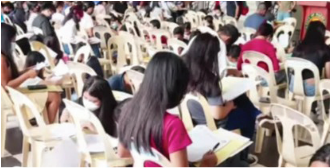
FREE HIGHER EDUCATION. College students apply for scholarships in this undated photo. The Commission on Higher Education (CHED) on Monday (April 14, 2025) said the delivery of free higher education in the country remains on track with adequate support from the national government.