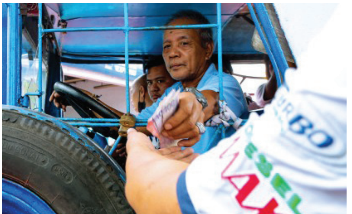
KEY SECTOR. A public utility jeepney driver pays for fuel at a gasoline station in Quezon City in this file photo. On Monday (Aug. 5, 2024), several transport groups supporting the Public Transport Modernization Program are set to stage a unity walk.