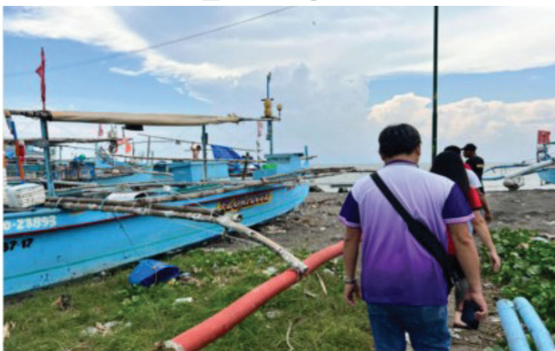
NO CATCH ZONE. Personnel of the Department of Labor and Employment (DOLE) in Cavite province assess employment interventions needed for oil spill-displaced fisherfolk on Wednesday (July 31, 2024). The local government units of Tanza, Naic, Maragondon, and Ternate towns have declared a “no catch zone” due to the oil spill in Bataan.