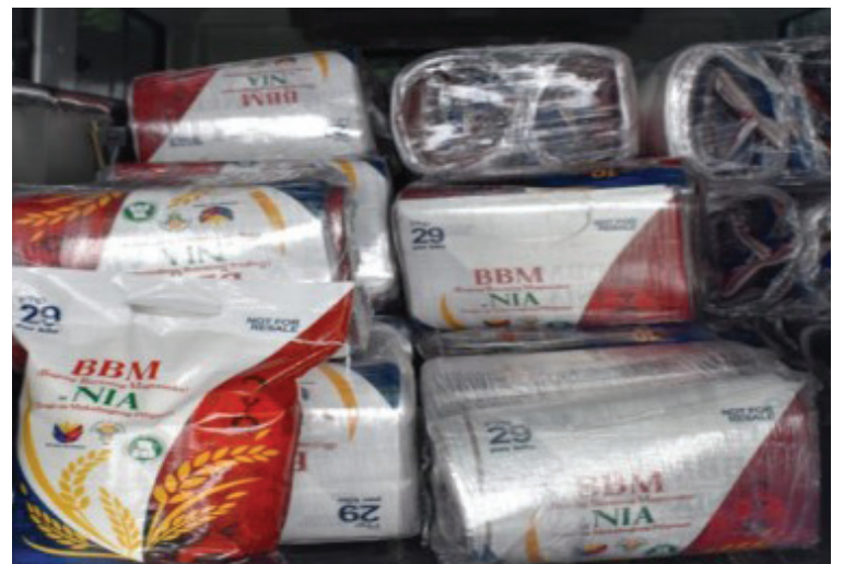
AFFORDABLE RICE. Repacked rice at 10 kilograms per bag to be sold for PHP290 each or PHP29 per kilo at the National Irrigation Administration Kadiwa stores in Nasugbu, Batangas and Naic, Cavite starting August 2024. The grains were harvested under the rice contract farming agreement with irrigators' associations under the Cavite-Batangas Irrigation Management Office.