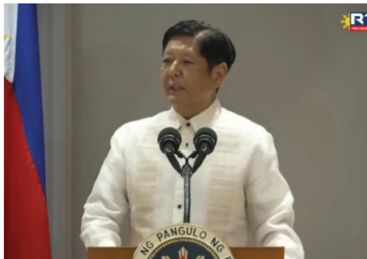
President Ferdinand R. Marcos Jr.

"Ilan sa mga nabanggit ay ang pakinabang ng pagkakaroon ng wikang panlahat, ang malaking ambag nito sa pagkamtan ng kasarinlan ng ating bansa, at ang kapangyarihan nito na buksan ang ating mga mata at isipan sa kahalagahan, karanasan, at kakayahan ng bawat isa (Some of the mentioned benefits of having a universal language is its great contribution to the achievement of our country's independence, and its power to open our eyes and minds to the importance, experience, and abilities of each one)," he said. (PNA)