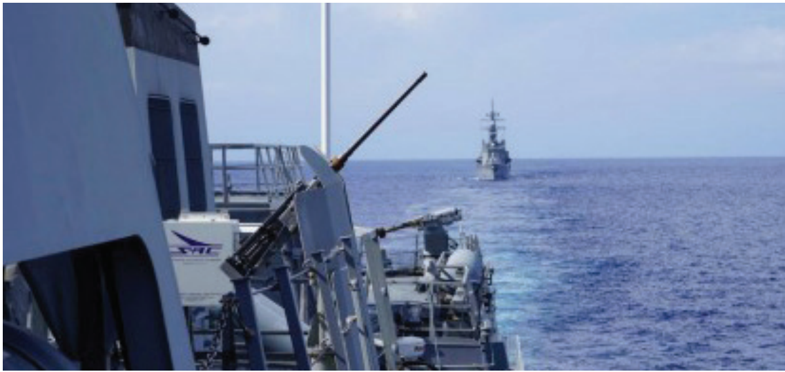
JOINT PATROL. The Philippine Navy's missile frigate BRP Jose Rizal (FF-150) and Japan Maritime Self-Defense Force's destroyer JS Sazanami (DD-113) sail together during the two countries' first maritime cooperative activity in the West Philippine Sea on Friday (Aug. 2, 2024). The Armed Forces of the Philippines said the drill enhanced the tactical capabilities of the two naval forces and reinforced strong ties and mutual commitment to maintaining peace and stability in the region.