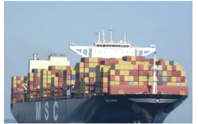
MSC Aries

MANILA – The three remaining Filipino seafarers from the Portuguese-flagged MSC Aries, seized by the Iranian authorities while passing through the Strait of Hormuz in April, have returned to the Philippines, the Department of Migrant Workers (DMW) said August 3, 2024.