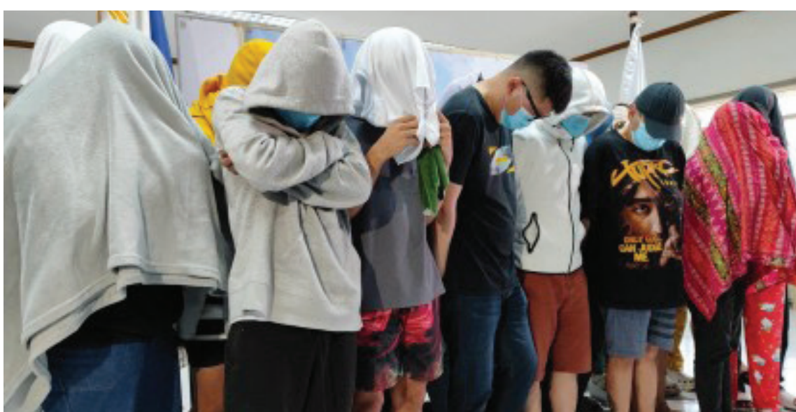
END OF THE LINE. Some of the 29 foreign and Filipino nationals arrested in an online scam hub raid in Kawit, Cavite are presented to the media by the National Bureau of Investigation at its Quezon City office on Tuesday (Aug. 13, 2024). Twenty-four Filipinos, three Chinese and two Malaysians were found working in four houses in Grand Centennial Homes, where they operate romance, investment, crypto and impersonation scams.