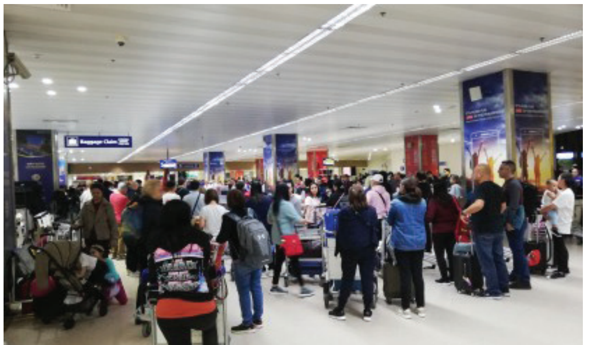
REVENGE TRAVEL. Passengers queue up at the Ninoy Aquino International Airport Terminal 1 in this undated photo. The increase in passenger volume at the Ninoy Aquino International Airport can be attributed to the robust economy and revenge travel, the head of the Manila International Airport Authority has said.