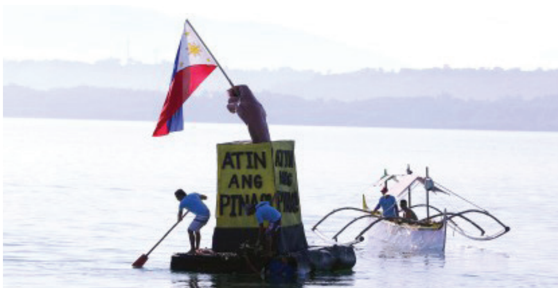
PH TERRITORY. Fisherfolk in Barangay San Salvador, Masinloc, Zambales pass by a Philippine flag and a sign that declares "Atin ang 'Pinas'" (The Philippines is Ours) in this photo taken Nov. 6, 2023. On Sunday (Aug. 11, 2024), Malacañang condemned China's provocation after its air force harassed a Philippine Air Force aircraft conducting maritime patrols over Bajo de Masinloc on Aug. 8. (PNA file photo)