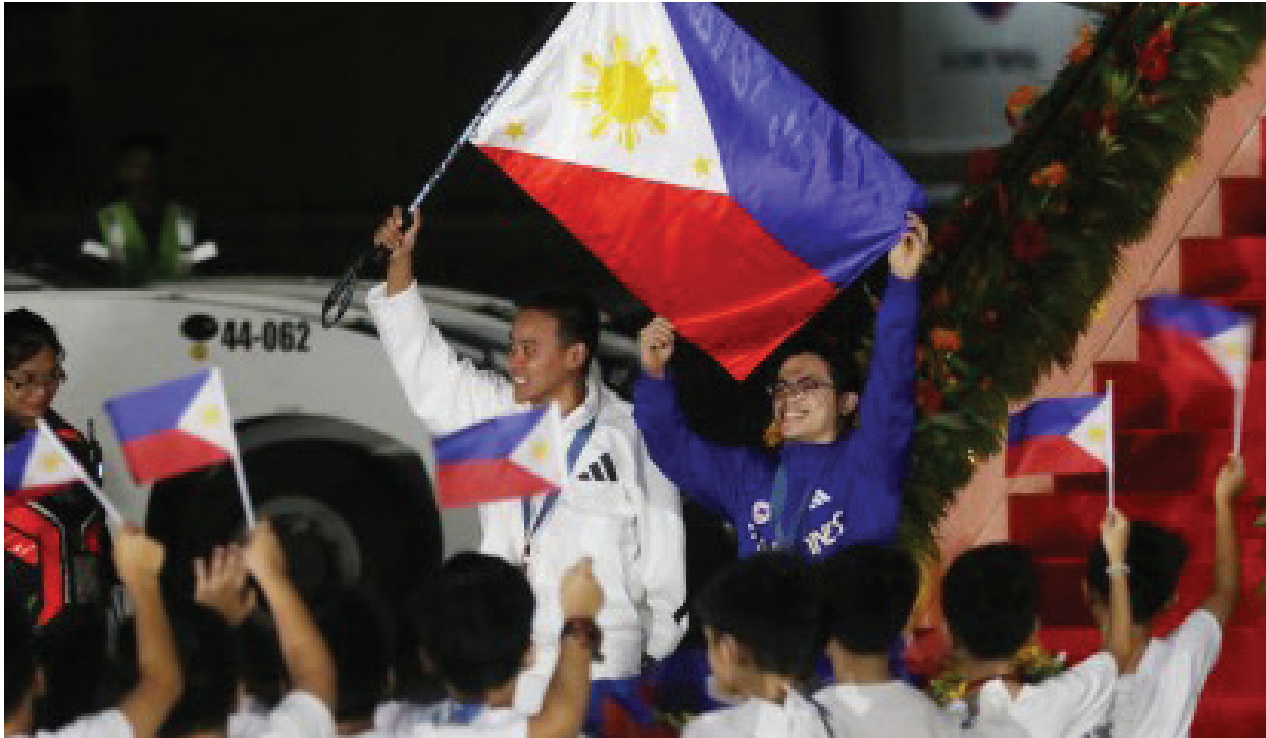
HEROES' WELCOME. Olympic gold medalist Carlos Yulo (in blue) and bronze medalist Nesthy Petecio walk down the runway of Villamor Air Base in Pasay City on Tuesday night (Aug. 13, 2024). The welcome ceremonies culminated at Malacañang Palace in Manila where President Ferdinand R. Marcos Jr. awarded their cash incentives.