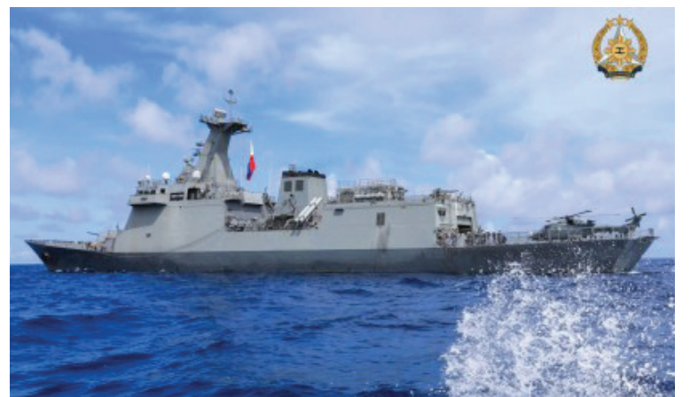
QUAD DRILL. The Philippine Navy's missile frigate, the BRP Jose Rizal (FF-150), joins the multilateral maritime cooperative activity (MMCA) with its counterparts from Australia, Canada, and the United States, in the West Philippine Sea on Aug. 7, 2024. The Navy on Thursday (Aug. 8, 2024) allayed concerns over the presence of three Chinese warships during the four nations' maritime drills.