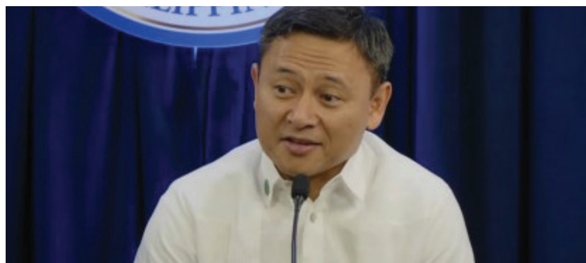
Education Secretary Juan Edgardo Angara

On Tuesday, Angara said there is a need to review the country's learning recovery program and interventions should focus on the learners' needs, while the government should dip into science-based data gathering. (PNA)