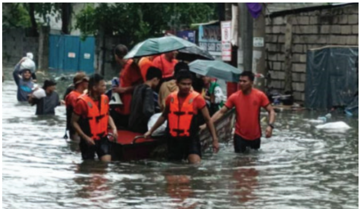
QUICK RESPONSE. Philippine Coast Guard personnel help evacuate residents in flooded areas of Metro Manila on July 24, 2024. The Presidential Communications Office (PCO) on Friday (Aug. 16, 2024) said it is working to improve the government’s communication protocols for faster and more efficient information dissemination during disasters and other calamities to mitigate damage and loss of lives.