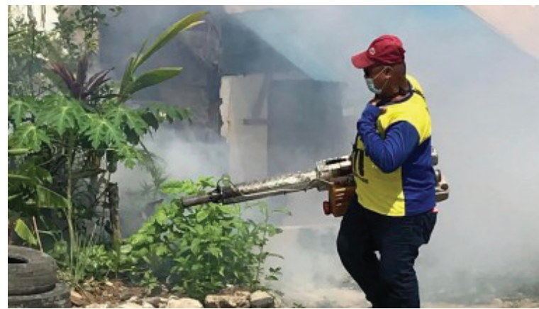
FIGHTING DENGUE. A fogging activity in Bagong Buhay village in Ormoc City on May 18, 2022. The number of patients dying from dengue, a viral disease spread by mosquitoes, is lower this year despite an increase in cases, the Department of Health said Thursday (Aug. 15, 2024).

As of Aug. 3, the areas that logged an increase in dengue cases include the National Capital Region, Cordillera Administrative Region, Ilocos Region, Cagayan Valley, Central Luzon, Calabarzon, Mimaropa, Bicol Region, Western Visayas, Central Visayas, Eastern Visayas, Northern Mindanao, Davao Region, Soccsksargen and Caraga. (PNA)