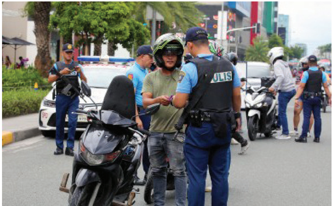
SAFETY REASONS. Motorcycle riders stop at a checkpoint along Macapagal Boulevard, Pasay City on Monday (July 15, 2024) for a security check. The Department of the Interior and Local Government (DILG) on Thursday (Aug. 15, 2024) reported a 3.29 percent drop in total crime incidents nationwide during the first half of the year.