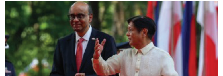
PH-SG TIES. President Ferdinand R. Marcos Jr. meets with visiting Singaporean President Tharman Shanmugaratnam in Malacañang on Thursday (Aug. 15, 2024). After their bilateral meeting, the two leaders witnessed the exchange of new agreements on the deployment of Filipino health workers and addressing climate change.

The diplomatic relations between the Philippines and Singapore were established on May 16, 1969. (PNA)