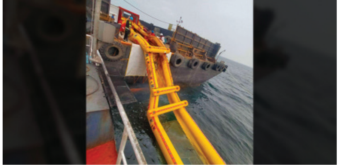
OIL RECOVERY. The Harbor Star, the contracted salvor for MT Terranova, deploys the Current Buster 4 oil recovery system to augment oil clean-up and containment surrounding the sunken oil tanker on Wednesday (Aug. 21, 2024). About 42,000 liters of oil were siphoned from Terranova through an additional booster pump, increasing oil siphoning efficiency.

On July 27, Jason Bradley sank to a depth of nine meters, resting on a muddy sea floor about 600 yards away from the nearest shoreline in Mariveles, Bataan. (PNA)