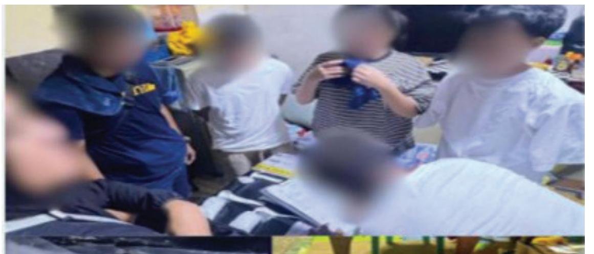
CRACKDOWN. The Cavite police's crackdown on illegal drugs nets 550 grams of suspected shabu worth PHP3.7 million in the cities of Dasmariñas and Bacoor in Cavite province on Aug. 21 and 22, 2024, respectively. Four suspects listed as high value individuals were arrested in the two operations.