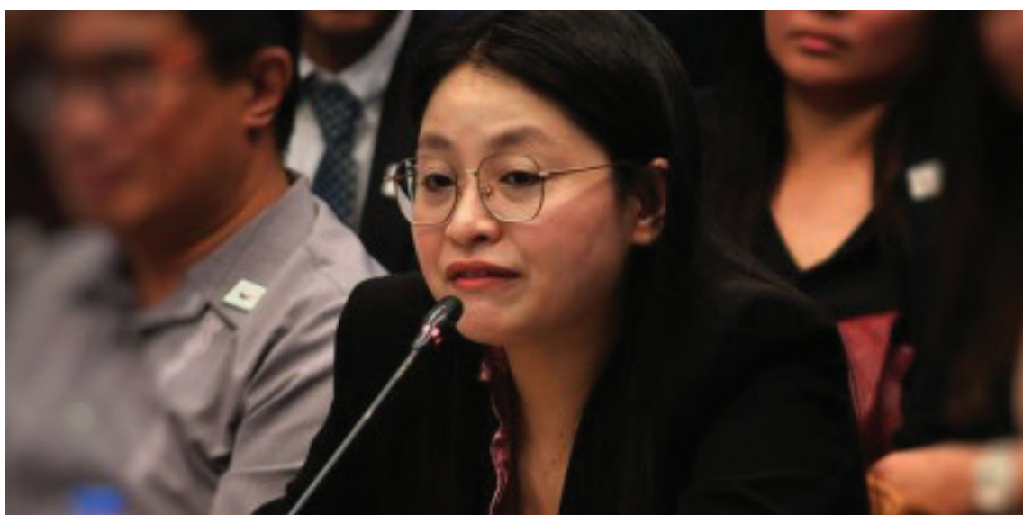
Dismissed Bamban, Tarlac Mayor Alice Guo