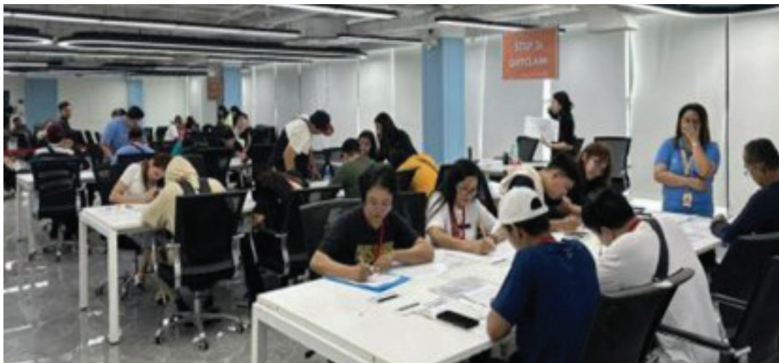
TIMELY SETTLEMENT. Displaced workers from First Orient International Ventures Inc. and K3 Global Services Inc., companies operating as Philippine Offshore Gaming Operators in Kawit, Cavite, receive their final salary, 13th-month pay, and separation pay at Island Cove on Thursday (Dec. 5, 2024). Department of Labor and Employment-Cavite officials facilitated the payout as part of the comprehensive support for workers affected by the closure of the Internet Gaming Licensees on Nov. 30.