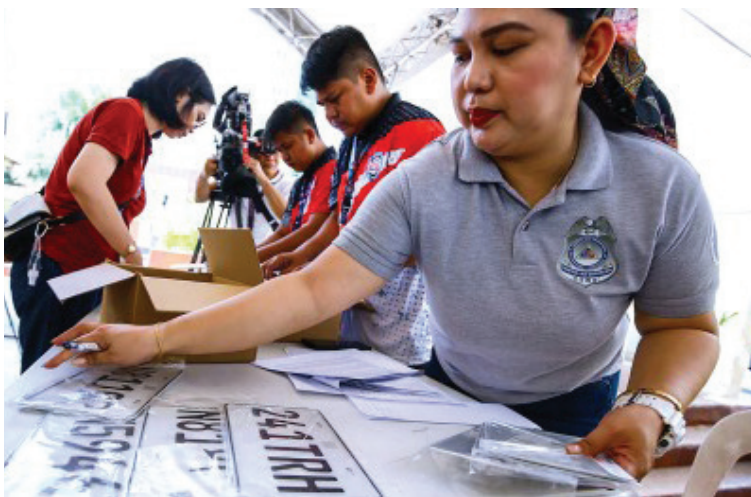
LICENSE PLATES. Workers from the Land Transportation Office (LTO) distribute license plates to Quezon City tricycle operators and drivers associations at the city hall grounds on May 22, 2024. The LTO on Wednesday (Dec. 4, 2024) reassured vehicle owners that two memorandum circulars that would ban the use of improvised or temporary plates have been deferred indefinitely.