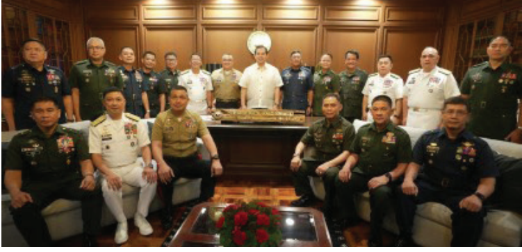
FULL SUPPORT. Speaker Ferdinand Martin Romualdez (standing, center) receives 17 generals and senior flag officers of the Armed Forces of the Philippines (AFP) at the House of Representatives on Tuesday (Dec. 3, 2024). Romualdez reaffirmed the House's full support for the AFP, emphasizing provisions for modernization programs, soldiers' welfare, capacity-building initiatives, and the proposed additional PHP350 daily allowance for soldiers to improve their living conditions and morale.