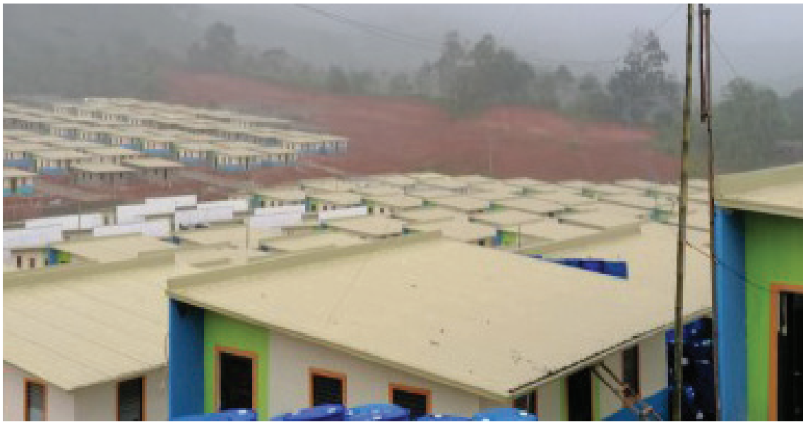
MARAWI REHAB. A view of the permanent shelter project site in Marawi City in this undated photo. President Ferdinand R. Marcos Jr. on Nov. 28, 2024 created the Office of the Presidential Adviser for Marawi Rehabilitation and Development (OPAMRD) to oversee and ensure "efficient, effective, and timely" implementation of the programs, activities, and projects under the Bangon Marawi Comprehensive Rehabilitation and Recovery Program.