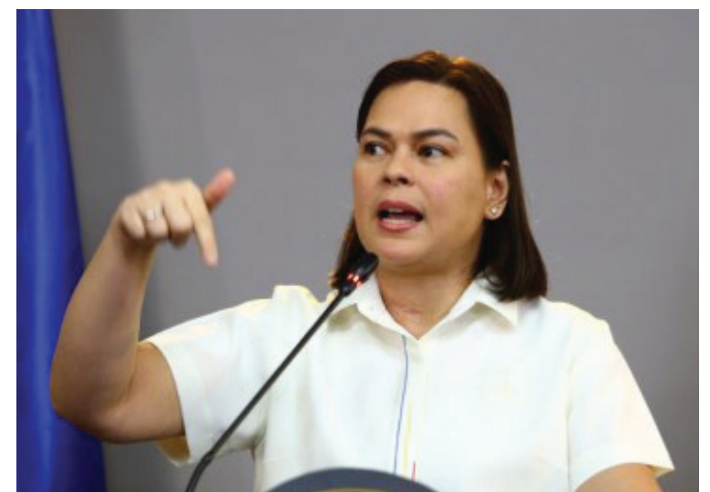
Vice President Sara Duterte