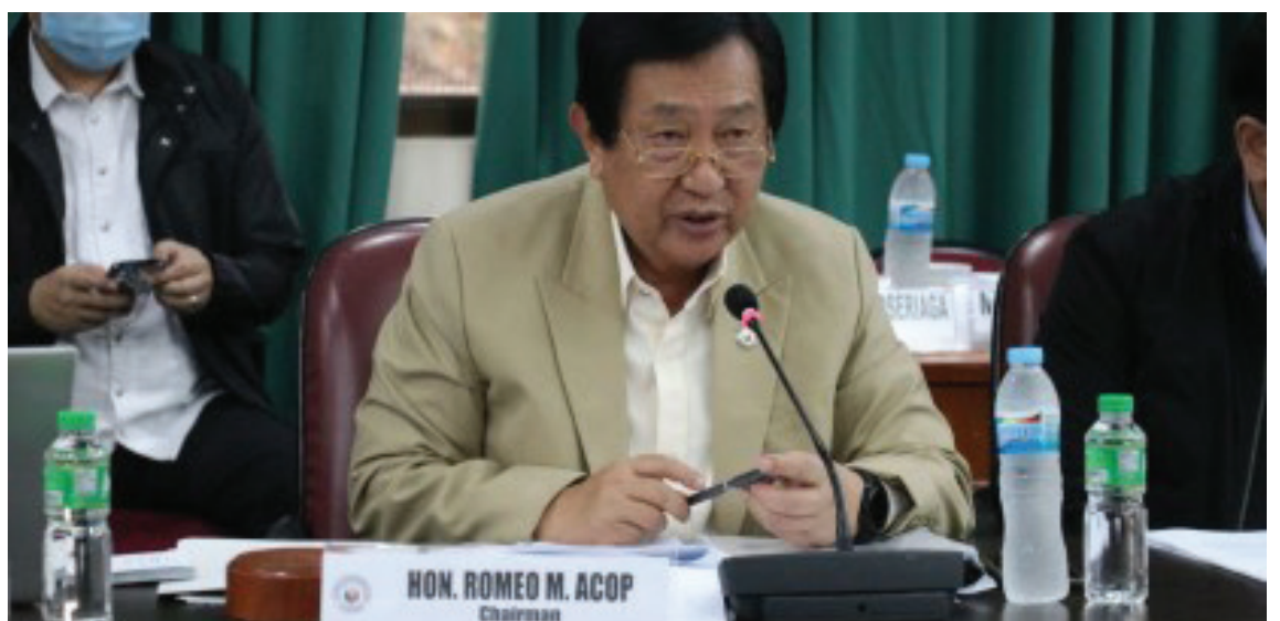
Antipolo City Rep. Romeo Acop