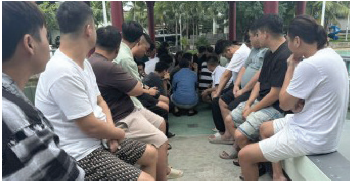
CRACKDOWN. Authorities rescue 162 foreign nationals during a raid in an illegal Philippine offshore gaming operation (POGO) hub in Lapu-Lapu City, Cebu on Aug. 31, 2024. Government officials on Wednesday (Dec. 11) said they are prepared to go after rouge POGOs after President Ferdinand R. Marcos Jr.'s total ban takes effect on Dec. 31, 2024.

Remulla also announced plans to issue an order requiring local chief executives to immediately report any suspicious activities related to POGOs in their areas. (PNA)