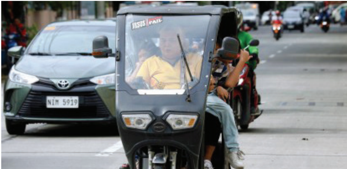
E-VEHICLE INDUSTRY. An electric tricycle plies San Marcelino Street in Manila on Oct. 21, 2024. The House of Representatives on Tuesday (Dec. 10) approved a measure to make electric vehicles more affordable and reduce greenhouse gas emissions.