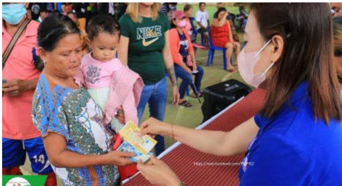
WORK PAYOUT. A recipient receives payout under the government’s Tulong Pang-hanapbuhay sa Ating Disadvantage/Displaced Workers (TUPAD) in San Jose, Dinagat Islands on Jan. 9, 2023. House of Representatives Speaker Martin Romualdez said on Tuesday (Dec. 19, 2023) that nearly PHP500 billion has been set aside for the social amelioration program that would benefit an estimated 48 million Filipinos under the 2024 national budget.