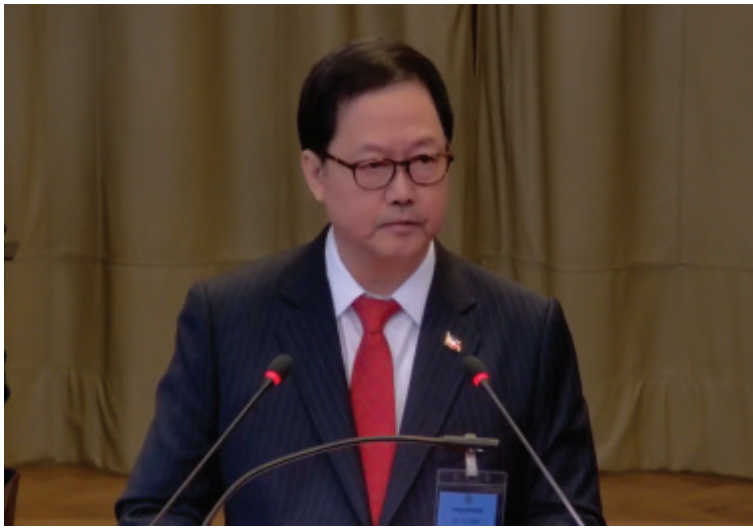
Solicitor General Menardo Guevarra