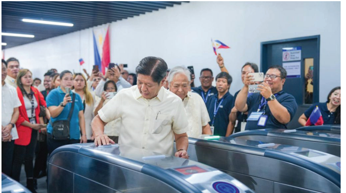
President Ferdinand R. Marcos on Friday led the inauguration of the Light Rail Transit Line 1 (LRT-1) Cavite Extension Project (LICE) Phase 1, marking a significant milestone in modernizing the transport system in the Philippines.