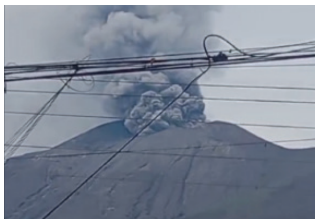
Mount Kanlaon

Of these, 4,407 families or 14,393 persons are being aided in 34 evacuation centers while 2,195 families or 6,987 individuals are being helped outside. (PNA)