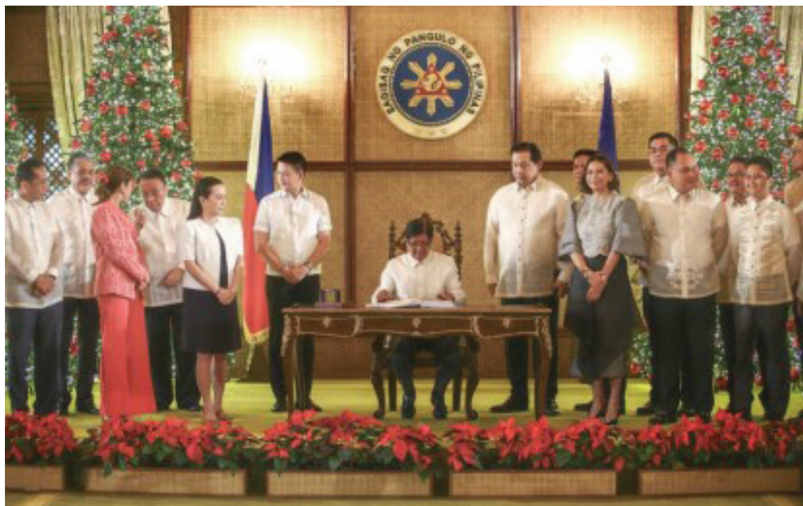
FUNDING FOR 2025. President Ferdinand R. Marcos Jr. signs the 2025 General Appropriations Act at Malacañang Palace in Manila on Monday (Dec. 30, 2024). Next year's government budget is down to P6.326 trillion from PHP6.352 trillion after the President vetoed line items deemed inconsistent with the administration's priorities.