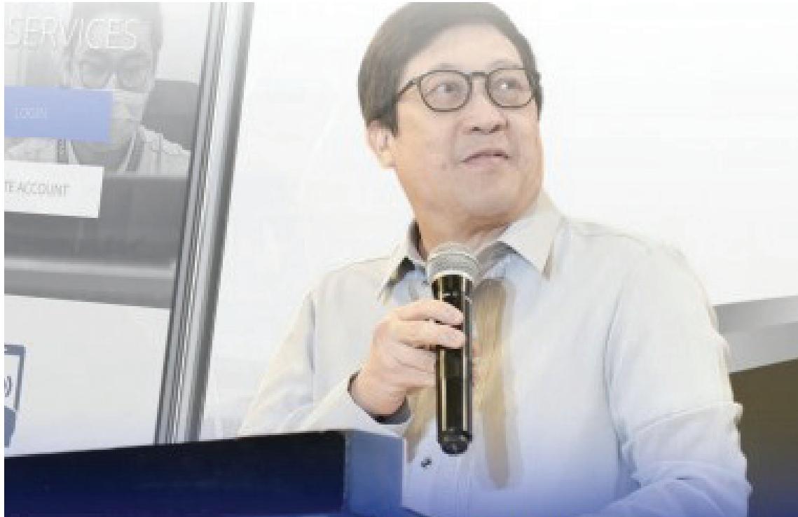
BI Commissioner Joel Anthony Viado