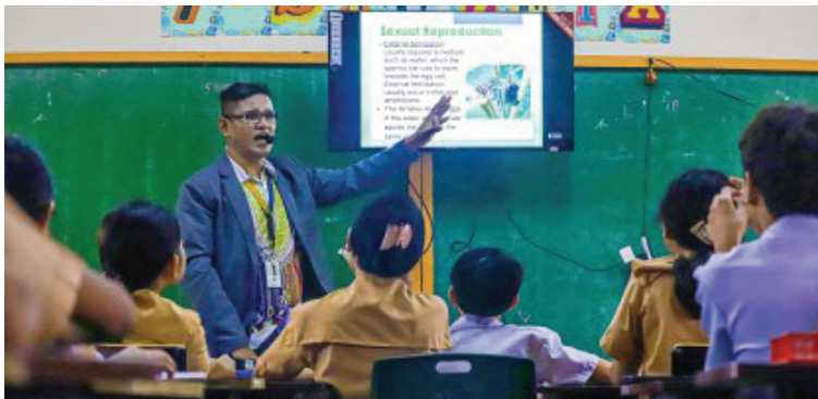
SEX EDUCATION. The Quezon City High School integrates sex education into its Science and Health subjects. The Commission on Population and Development on Tuesday (Jan. 21, 2025) urged parents to take a more active role in educating their children about sexuality and reproductive health.

the country to take a stronger and broader approach, including intensified age and development and culturally sensitive comprehensive sexuality education, as a strategy of the Philippine Population and Development Plan of Action.