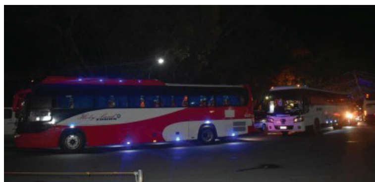
TRANSFERRED. Some 150 persons deprived of liberty (PDLs) are loaded in buses for their transfer from the from the New Bilibid Prison (NBP) in Muntinlupa City to the Leyte Regional Prison (LRP). The Bureau of Corrections on Tuesday (Jan. 21, 2025) reported that the transferees arrived at the LRP on the night of Jan. 19, 2025.