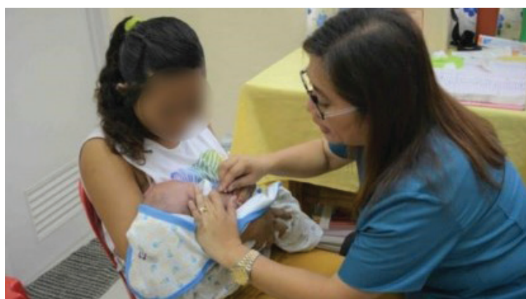
YOUNG MOM. A health worker attends to a young mother and her baby in this undated photo. The Commission on Population and Development (CPD) on Wednesday (Jan. 15, 2025) raised the alarm over the rising incidence of adolescent pregnancies, marking a 6.6 percent increase in 2023.

MANILA – The Commission on Population and Development (CPD) has sounded the alarm over the rising incidence of adolescent pregnancies, particularly those under 15 years old.