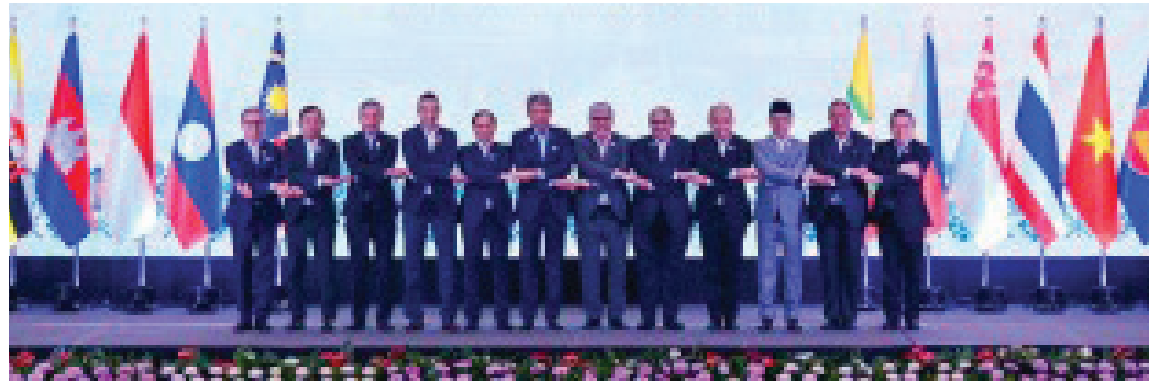
ASEAN MINISTERS. Foreign ministers of the Association of Southeast Asian Nations during the ASEAN Foreign Ministers Retreat in Langkawi, Malaysia on Sunday (Jan. 19, 2025). Department of Foreign Affairs Secretary Enrique Manalo on Monday (Jan. 20) said among the topics discussed by the region's officials were concerns over the situation in the South China Sea, Myanmar, and Middle East.

"We expressed strong support towards Malaysia's key priorities and deliverables in advancing ASEAN's collective vision of a resilient, people-centered, and forward-looking ASEAN community while advancing economic growth and regional connectivity, and enhancing