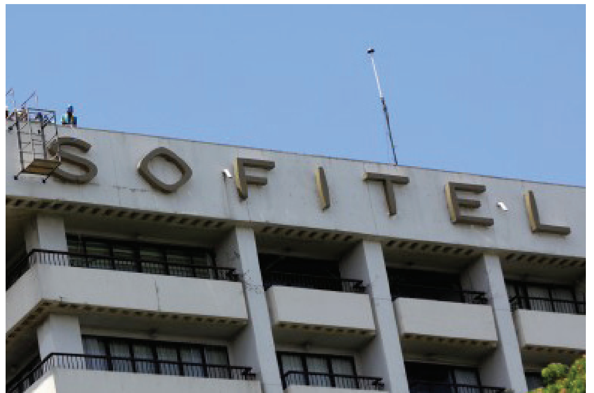
The facade of the Sofitel Philippine Plaza Hotel in Pasay City.

Budget Secretary Amenah Pangandaman earlier said the Development Budget Coordination Committee would submit to Congress the proposed 2025 national budget on July 29, one week after the President's 3rd State of the Nation Address (SONA). (PNA)