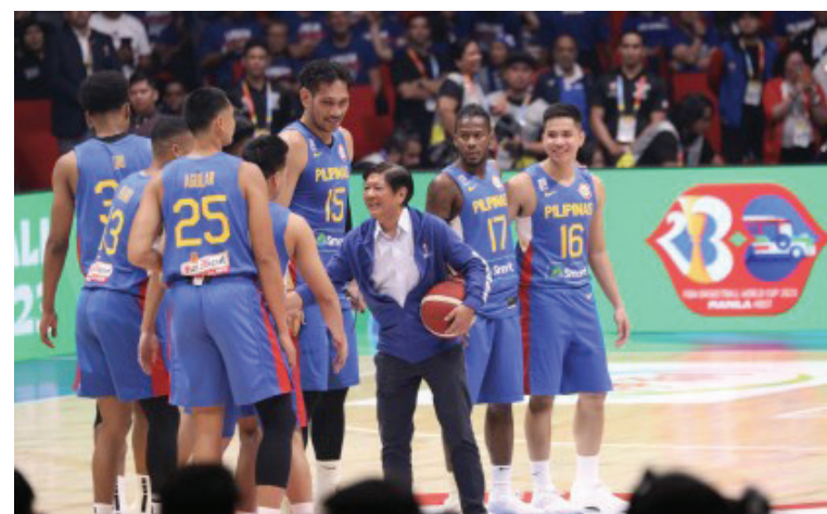
GILAS VICTORY. President Ferdinand R. Marcos Jr. with members of the Gilas Pilipinas during the 2023 FIBA World Cup in Manila on Aug. 25, 2023. Marcos on Thursday (July 4, 2024) commended Gilas Pilipinas for its victory against powerhouse Latvia in the 2024 FIBA Olympic Qualifying Tournament earlier in the day.

A win by the Filipinos will assure them of a ticket for the knockout semifinal round and will keep alive their hopes of returning to the Olympics. (PNA)