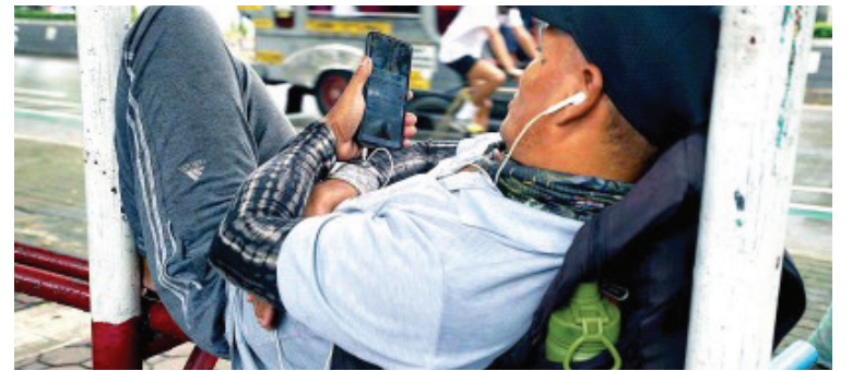
(PNA photo by Ben Briones)

The CICC recently announced that complaints will be filed against telcos that fail to properly account for their unregistered SIM cards used to defraud the public. (PNA)