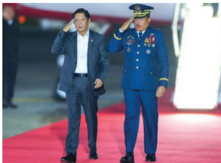
PBBM IS BACK. President Ferdinand R. Marcos Jr. arrives at the Villamor Airbase in Pasay City at 3:58 a.m. on Saturday (June 1, 2024) after his state visit to Brunei and working visit to Singapore. The President embarked on his first state visit to the Sultanate state while he made history by being the first Philippine president to deliver a keynote message at the IISS Shangri-La Dialogue in Singapore.

Marcos also had a bilateral meeting with Lithuanian Prime Minister Ingrida Šimonyte and met with some members of the US Congressional Delegation to discuss future ways to improve collaboration and cooperation with other countries. (PNA)