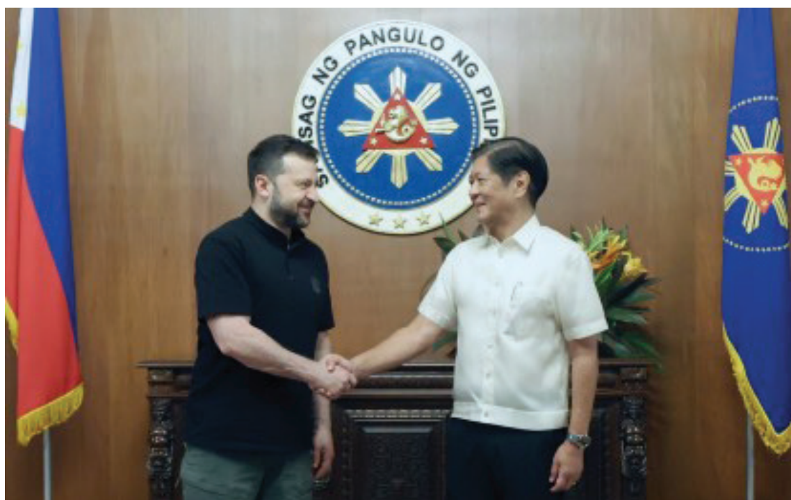
BILATERAL MEETING. President Ferdinand R. Marcos Jr. (right) and Ukraine President Volodymyr Zelenskyy meet at Malacañan Palace on Monday (June 3, 2024). During their bilateral meeting, Zelenskyy thanked Marcos for the Philippines' recognition of Ukraine's sovereignty amid the continued invasion of Russia.