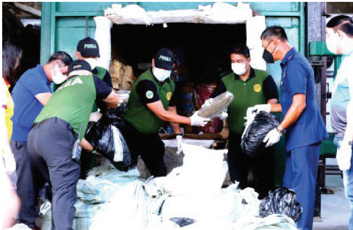
DESTROYED. The stockpile of illegal drugs was destroyed at the Integrated Waste Management Inc. (IWMI) facility in Barangay Aguado, Trece Martires City, Cavite on Thursday (June 6, 2024). A total of 2,435.62 kg. were destroyed during the procedure, which include the 1.2 tons of shabu intercepted in a checkpoint operation on April 15 in Batangas province.