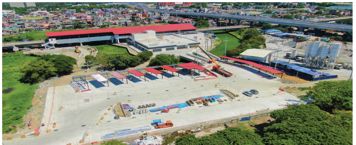
An aerial photograph of the intermodal transport hub connected to the Dr. Santos Station of the Light Rail Transit Line 1 Cavite Extension Phase 1 project.