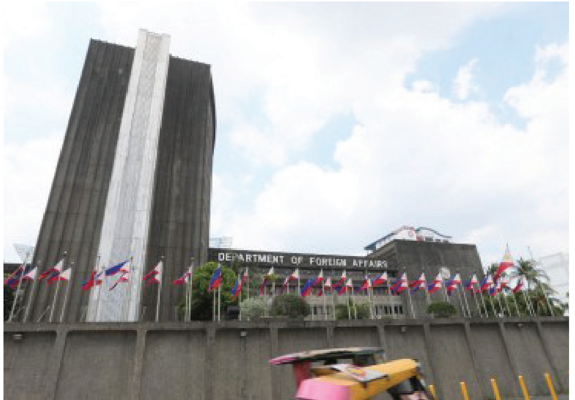
Department of Foreign Affairs