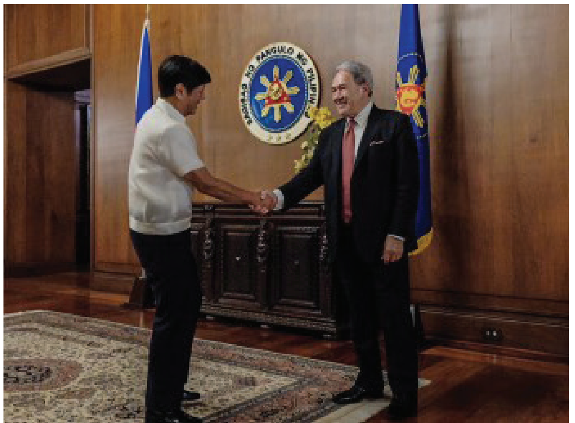
UNITY. President Ferdinand R. Marcos Jr. welcomes New Zealand Deputy Prime Minister and Minister of Foreign Affairs Winston Peters in Malacañang on Tuesday (June 11, 2024). During their meeting, the President emphasized the importance of unity among small nations in dealing with geopolitical challenges.