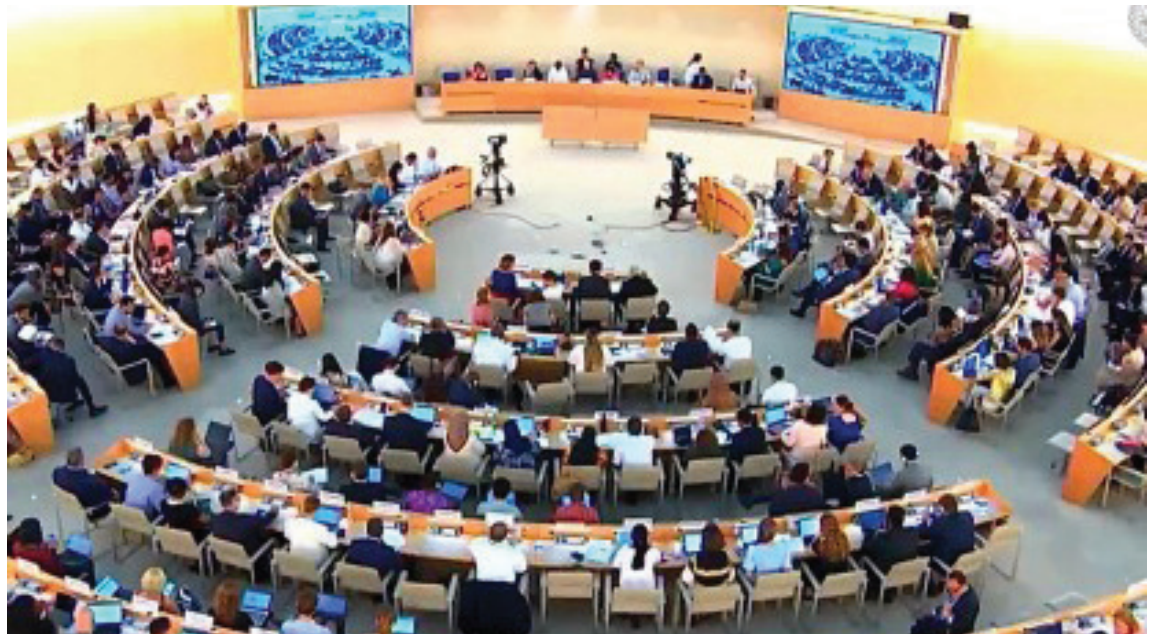
SEAFARERS’ WELFARE. The United Nations Human Rights Council adopts by consensus the resolution titled “Promoting and Protecting the Enjoyment of Human Rights by Seafarers” during its 56th Session in Geneva on Thursday (July 11, 2024). The DFA hailed the newly adopted resolution promoting the rights of seafarers as a “milestone” in protecting sailors, including Filipinos around the world.