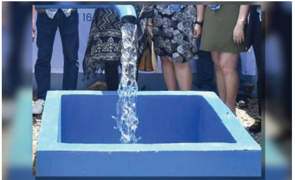
NEW WATER SOURCE. The Highland Hills Water Source Development Project in Bacolod City in this phot taken April 16, 2024. AGRI Partylist Rep. Wilbert Lee on Monday (July 15) called for the passage of a measure that seeks to establish a nationwide potable water supply system throughout the country in three years to address the need of millions of Filipinos, especially in rural areas.