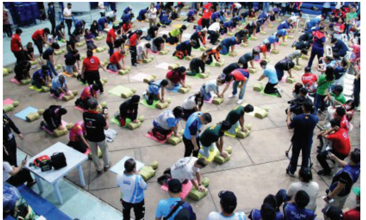
CPR-READY PH. Some 253 Pasiguenos join a nationwide cardiopulmonary resuscitation (CPR) awareness campaign at the Pasig City Complex on Caruncho Avenue in Pasig City on July 25, 2023. The Department of Health on Wednesday (July 17, 2024) called on Filipinos to learn CPR to become first responders in times of emergencies.

On March 27, President Ferdinand R. Marcos Jr. declared July 17 of every year as the National CPR Day under Proclamation 511 to promote national health awareness among Filipinos. (PNA)