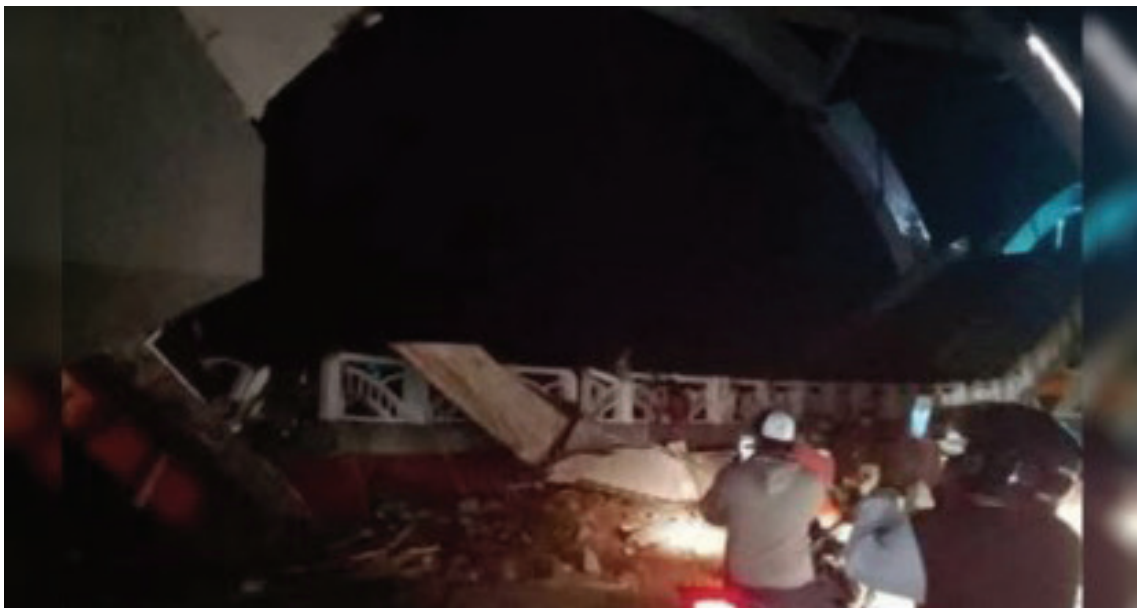
COLLAPSED BRIDGE. A portion of the Cabagan-Sta. Maria Bridge in Isabela province collapses Thursday night (Feb. 27, 2025). Malacañang on Saturday (March 1, 2025) said investigations are underway to determine who should be held accountable for the collapse of the newly completed bridge.

The DPWH 2 (Cagayan Valley) also requested experts from the Bureau of Design and Bureau of Construction of the agency’s central office “to conduct further evaluation and assessment.” (PNA)