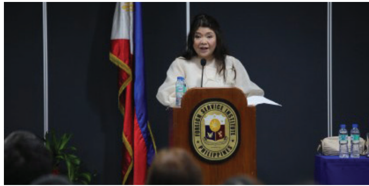
House Committee on Foreign Affairs chairperson and Pangasinan Rep. Rachel Arenas