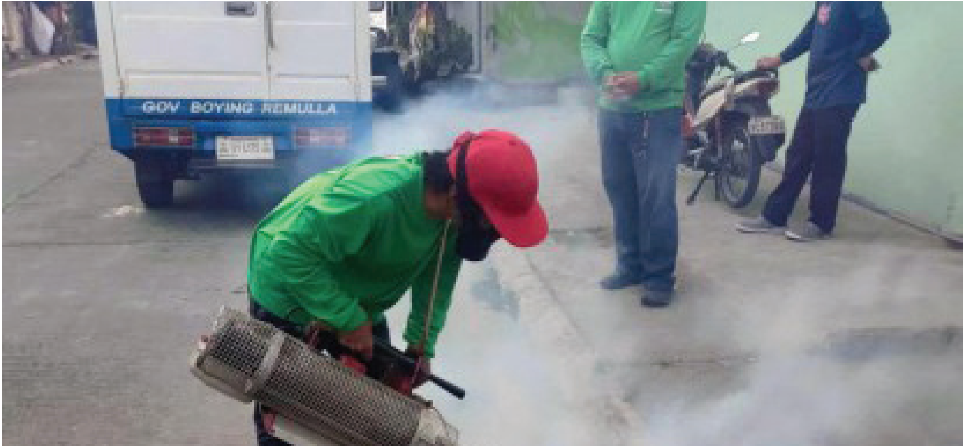
FOGGING, MISTING. The City Epidemiology and Surveillance Unit and City Health Office of General Trias City conduct fogging and misting operations in MariCris Subdivision, Barangay Pasong Camachile II on Thursday (Feb. 27, 2025), to combat the rise in dengue cases. The efforts are part of a province-wide response to the 409-percent increase in cases in the province since Jan. 1.