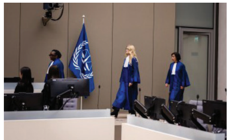
PRE-TRIAL. International Criminal Court Pre-Trial Chamber 1 presiding judge Iulia Antoanella Motoc (center) and judges Reine Adélaïde Sophie Alapini-Gansou (left) and María del Socorro Flores Liera during the first pre-trial hearing on former president Rodrigo Duterte’s drug war case in The Hague, Netherlands on Friday (March 14, 2025). With the start of the ICC proceedings against Duterte’s alleged crimes against humanity, Malacañang said on Saturday (March 15) that justice has started to roll down.

Duterte arrived in The Hague, The Netherlands on Wednesday night (Manila time) and was turned over to the ICC Detention Center in Scheveningen. (PNA)