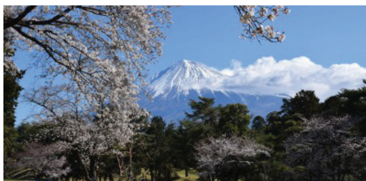
NO VISA FEE. A view of Mt. Fuji from the Fujinomiya Golf Club in Fujinomiya, Japan. Travelers planning to visit Japan on a tourist visa, be it multiple or single entry, will not pay for a visa fee except for center usage fees and other additional services that they may avail of once Japan's new visa center opens.