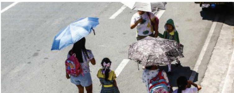
HOT WEATHER. Adults use umbrellas to shield them and their wards against the heat in this photo taken in Quezon City on March 3, 2025. On Wednesday (March 19), attendees of a German Embassy-hosted climate forum vowed to support bids to advance measures towards addressing climate change.

a breakthrough agreement that would augment climate financing from USD100 billion to USD300 billion annually by 2035.