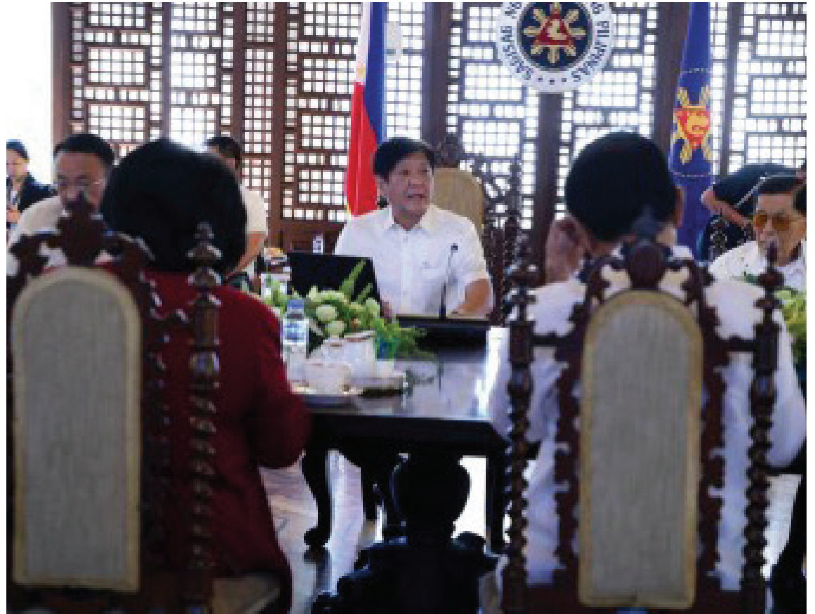
WATER SUPPLY. President Ferdinand R. Marcos Jr. convenes a sectoral meeting with the water sector in Malacañang on Tuesday (May 7, 2024). The President, during the meeting, ordered relevant government agencies to focus government efforts on the 40 million underserved Filipinos who have no formal source of water.