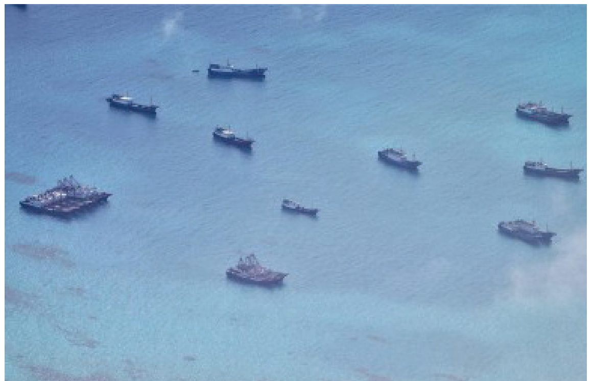
DIPLOMATIC APPROACH. Chinese vessels are seen trespassing in Iroquois Reef, a body of water within the West Philippine Sea (WPS), in this photo taken on June 30, 2023. The House of Representatives on Thursday (May 9, 2024) said the best way to respond to China’s continued aggression in the West Philippine Sea is still through diplomatic means.