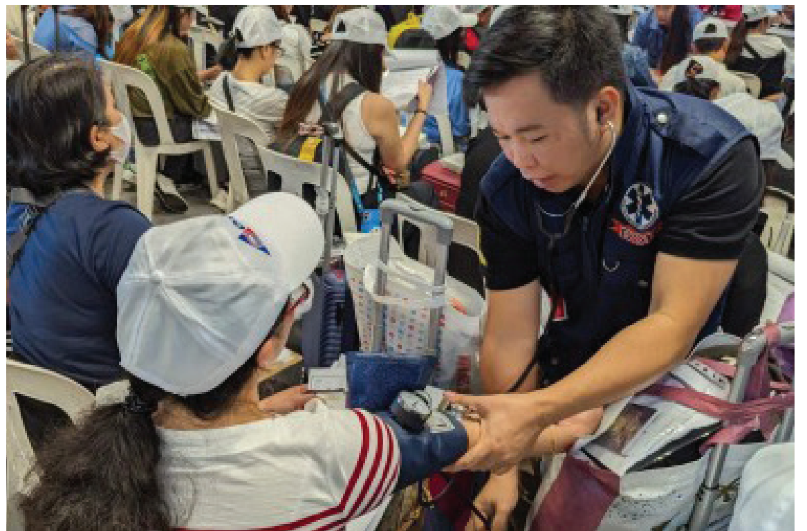
OUT OF DANGER. A Department of Health personnel checks on an overseas Filipino worker (OFW) upon their arrival at the NAIA Terminal 3 on Thursday (May 9, 2024). A total of 60 OFWs who availed of the government’s voluntary repatriation program also received various forms of assistance.

“Iyong pinakahuling nag-atake ang Iran na inatake nila ang Jerusalem, doon na kami natakot. Right away, nagpa-repatriate na kami (When Iran launched an attack on Jerusalem, we were frightened. So, we immediately volunteered for repatriation),” she added. (PNA)