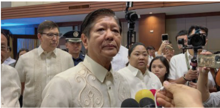
President Ferdinand R. Marcos Jr.

The Department of Foreign Affairs recently announced that it is tightening its rules for Chinese nationals applying for Philippine visas amid the purported spike in criminal activities involving Chinese nationals, particularly in the Philippine Offshore Gaming Operations. (PNA)