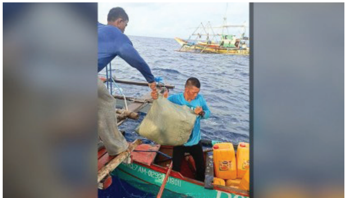
SUCCESS. A member of the advance team of the civilian group Atin Ito Coalition hands over fuel and other supplies to Filipino fisherfolk in the Bajo de Masinloc (also known as Scarborough Shoal) in the West Philippine Sea on Thursday (May 16, 2024). Some 144 Filipino fisherfolk from six mother boats and 36 small fishing boats benefitted from this effort.