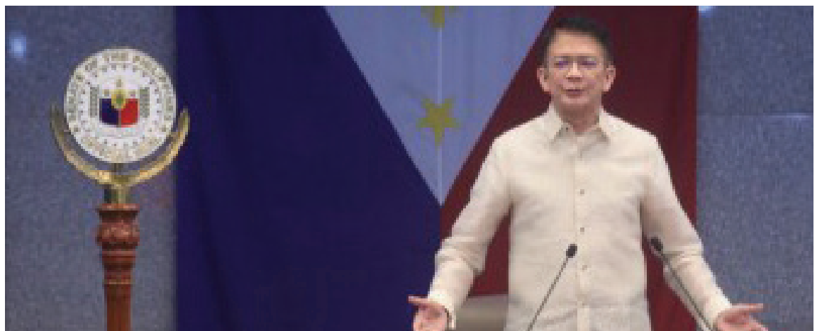
Senate President Francis 'Chiz' Escudero