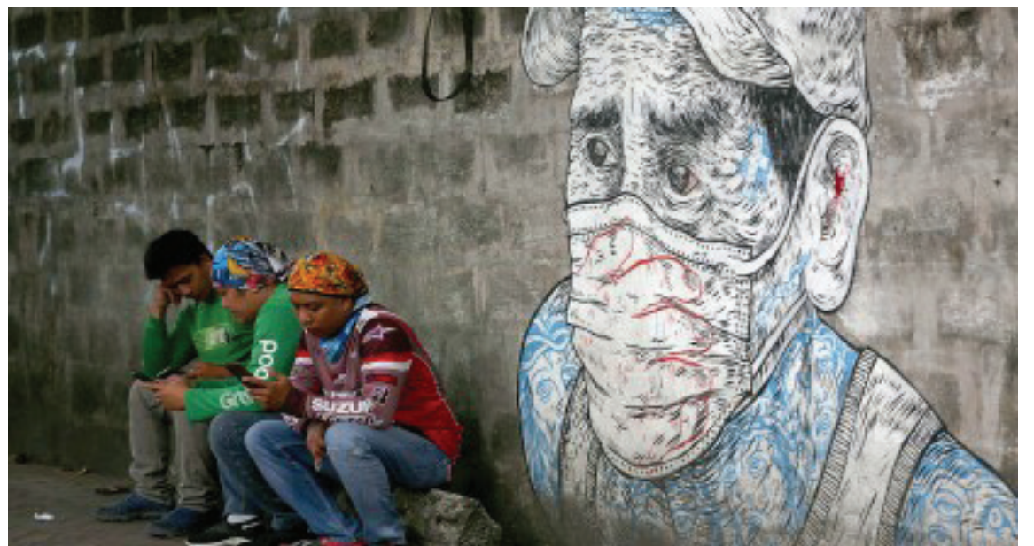
WAITING FOR ORDERS. Delivery riders sit beside a Covid-19-themed wall graffiti of a man wearing a face mask, while waiting for orders from customers at Teacher’s Village in Quezon City on April 18, 2023. Infectious disease expert Rontgene Solante on Thursday (May 23, 2024) said new Covid-29 variants KP.2 and KP.3 present mild respiratory tract symptoms only and advised the vulnerable population to wear face masks in crowded places to avoid severe infection.

He also advised those with symptoms of respiratory illness to rest at home and consult a physician immediately to prevent possible increase of Covid-19 infections. (PNA)