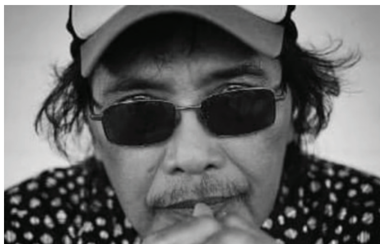
Director Carlo J. Caparas

Caparas is behind some of the country's iconic comics and movies such as "Ang Panday", "Bakekang," "Pieta" and "Totoy Bato."