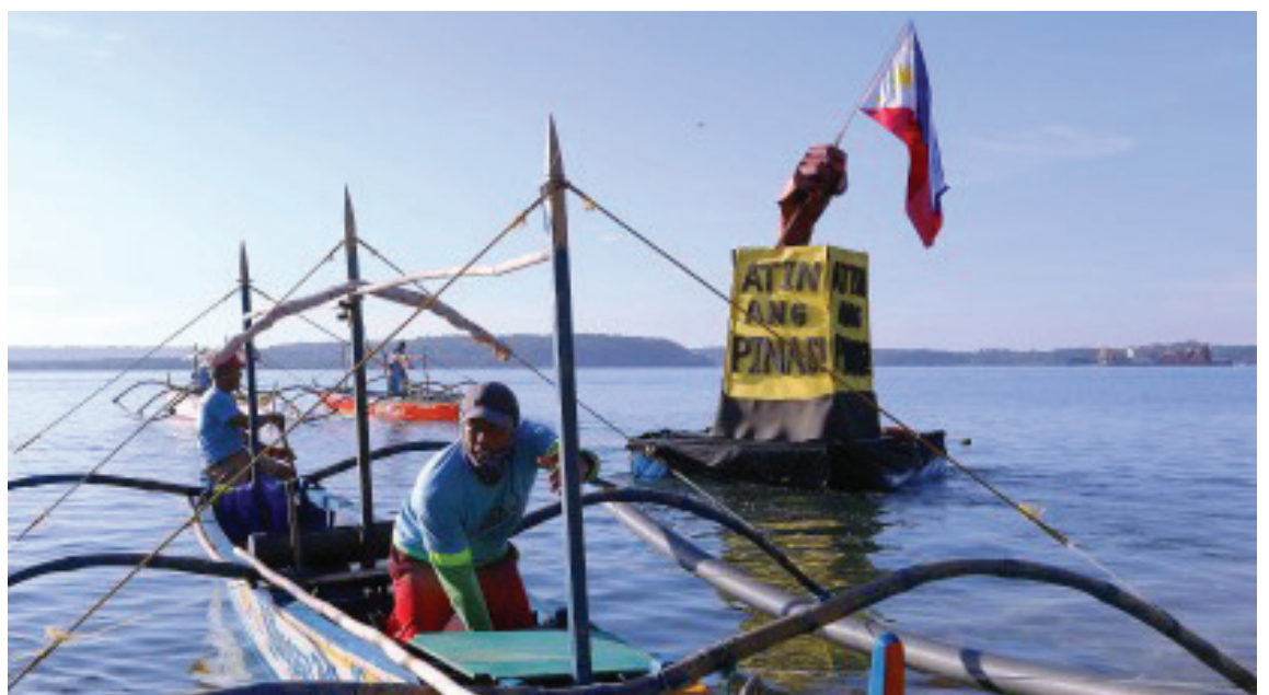
OURS. A group of fisherfolk releases an 18-foot symbolic buoy bearing the Philippine flag and a large “Atin ang Pinas!” (The Philippines is Ours) sign off the waters of Barangay San Salvador, Masinloc, Zambales on Nov. 6, 2023. The Department of Foreign Affairs denounced Sunday (May 26, 2024) China’s threat to detain for a maximum 60 days without trial perceived foreign trespassers who will cross what it claims are its borders.