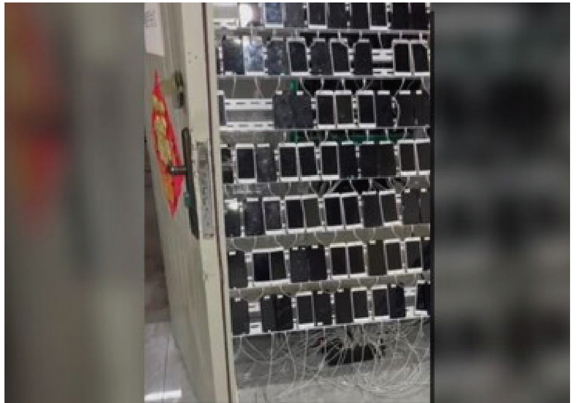
POGO ONLINE SCAMS. Rows of mobile phones allegedly being used in scam transactions are found during a raid at a POGO facility in Bamban, Tarlac on March 13, 2024. Senator Sherwin Gatchalian on May 21 filed a measure outlawing POGO in the country as criminal activities linked to the industry continue to rise.

ban everything to get rid of gambling in the Philippines,” along with its associated ills such as human trafficking, money laundering and cyber fraud, among others. (PNA)