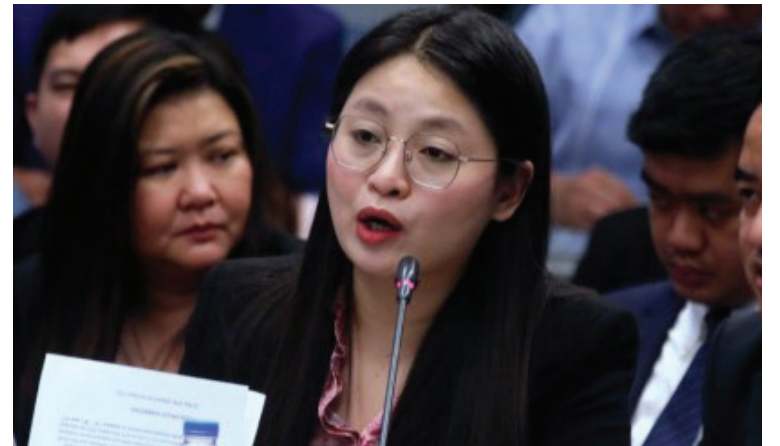
Bamban, Tarlac Mayor Alice Guo

Under the Omnibus Election Code, any person, who has been declared insane or incompetent, or has been sentenced by final judgment for subversion, insurrection, rebellion, or for any offense with a penalty of more than 18 months or for a crime involving moral turpitude, shall be disqualified to be a candidate. (PNA)