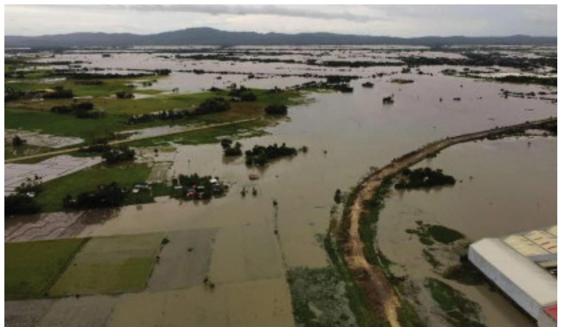
FLOODED FIELDS. A drone shot of rice fields submerged in flood waters following the onslaught of Severe Tropical Storm Kristine (international name Trami) on Oct. 23, 2024. The Department of Agriculture (DA) on Monday (Nov. 4) assured the immediate release of indemnification to insured farmers affected by Kristine.

According to the Bureau of Plant Industry (BPI), around 3.79 million MT of rice imports arrived in the country as of Oct. 30. (PNA)