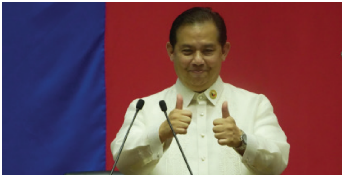
RIGHT SIDE. Speaker Martin Romualdez delivers his message during the resumption of session at the House of Representatives in Quezon City Monday (Nov. 4, 2024). Romualdez said the House will continue its probe into alleged extrajudicial killings during the previous administration's drug war.

"The quad comm and our young guns have become the target of those who prefer the shadows over the light. They attempt to undermine our work, casting aspersions against us. Instead, we will