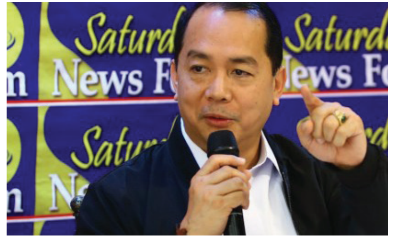
OCD administrator Undersecretary Ariel Nepomuceno

On Monday, Defense Secretary Gilberto Teodoro Jr. ordered mandatory evacuations in areas identified as high-risk due to the anticipated adverse weather conditions from Leon. (PNA)