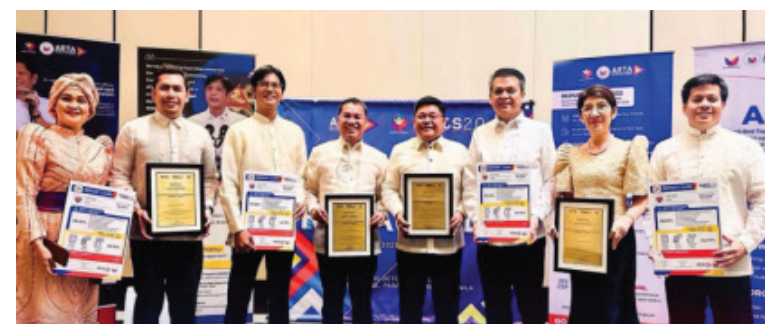
RECOGNITION. The Anti-Red Tape Authority (ARTA) recognizes the Department of Social Welfare and Development (DSWD) for its outstanding performance in anti-red tape initiatives during the ARTA Report Card Survey (RCS) Awards for the 2023 RCS 2.0 at the Conrad Hotel in Pasay City on Oct. 30, 2024. Among the eight DSWD offices assessed, seven were recognized for their exceptional performance.

"The accolades received by the DSWD is a reflection of our strong commitment to upholding the provisions of the EODB law and streamlining its