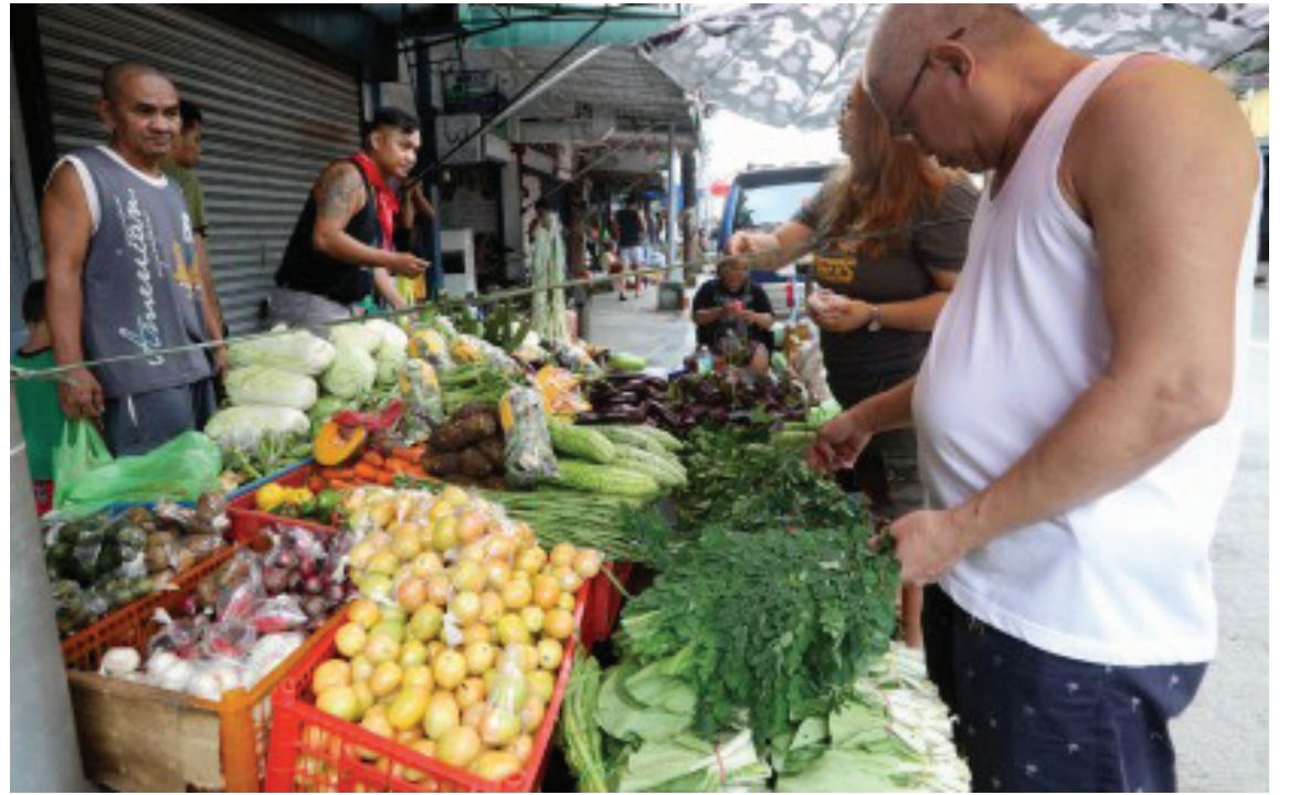
RISING PRICES. Fresh green vegetables are sold at the San Andres Public Market in Manila on September 6, 2024. The Department of Agriculture (DA) on Monday (Nov. 4) said the spiking prices of vegetables following the onslaught of Severe Tropical Storm Kristine (international name Trami) may be tamed in two weeks.

include hikes in ampalaya at PHP180/kg from PHP100/kg. for the said period; string beans at PHP200/kg. from PHP140/kg.; tomato at PHP210/kg. from PHP160/kg.; pechay tagalog at PHP150/kg. from PHP100/kg.; eggplant at PHP130/kg. from PHP90/kg.; Baguio beans at PHP190/kg. from PHP160/kg.; carrots at PHP200/kg. from PHP180/kg.; and chayote at PHP85/kg. from PHP70/kg., among others. (PNA)