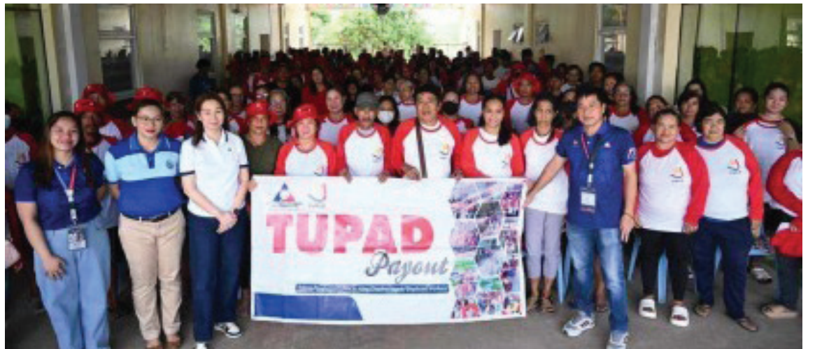
WORKERS' AID. Department of Labor and Employment (DOLE) - Calabarzon personnel during a payout activity for beneficiaries of the Tulong Panghanapbuhay sa Ating Disadvantaged Workers (TUPAD) program in the region in this undated photo. The agency is again set to implement TUPAD for those workers displaced by Severe Tropical Storm Kristine (International name Trami), setting aside PHP424.4 million for more than 72,000 beneficiaries.