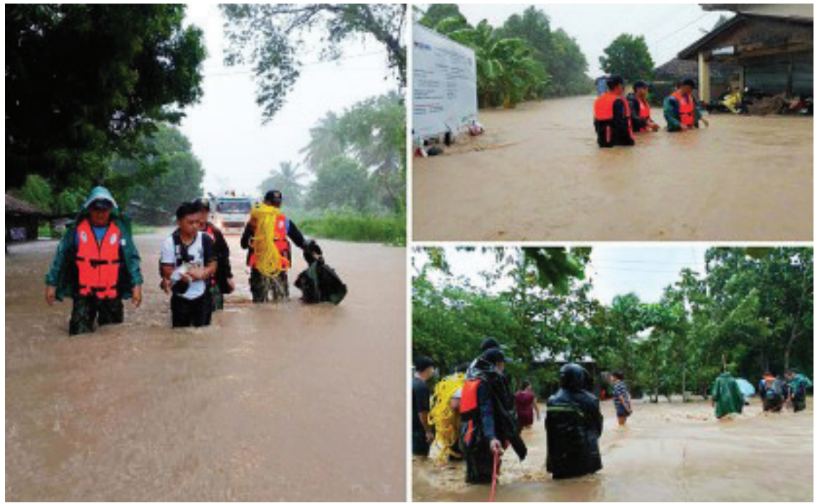
FLOOD SITUATION. Local government personnel rescue residents in various barangays in Libon town, Albay province who were severely affected by massive flooding brought about by Severe Tropical Storm Kristine on Oct. 22, 2024. The Philippines is set to receive multibillion pesos worth of international aid from the European Union, the United Arab Emirates and Taiwan in response to Kristine's devastation.