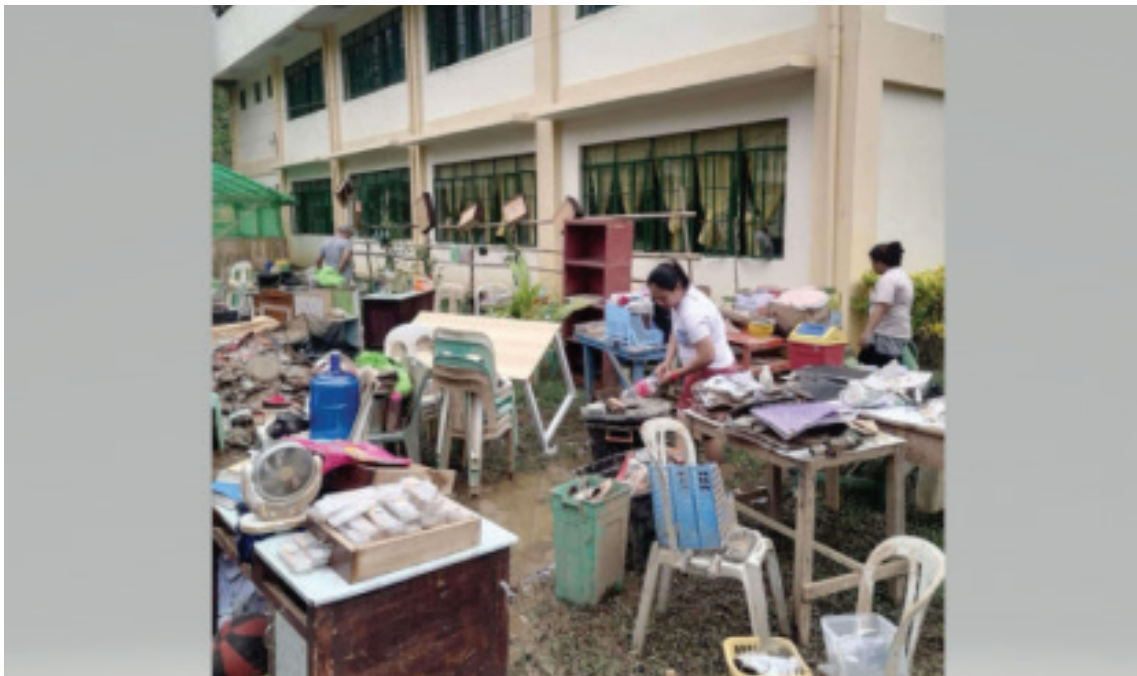
AFTERMATH. Teachers of Siuton National High School of Magallanes, Sorsogon clean and check learning materials that can still be used in the aftermath of Severe Tropical Storm Kristine on Oct. 24, 2024. The Department of Education on Monday (Nov. 4) said it will launch a dynamic learning program to prevent learning loss because of consecutive weather disturbances in the country.

At least 13 schools reported flooding or landslides while 13 schools are being used as evacuation centers. (PNA)