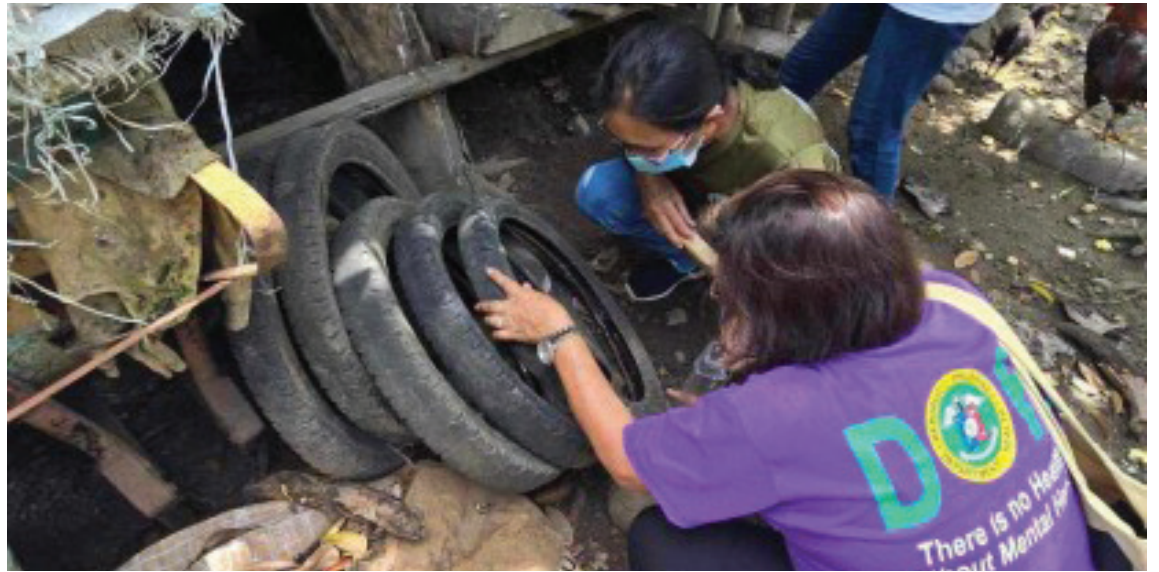
BREEDING PLACES. Health personnel conducts dengue monitoring and surveillance in Barangay Poblacion, Leon on Sept. 11, 2024. The Department of Health on Thursday (Nov. 7, 2024) said there are 21,097 cases reported nationwide from Sept. 29 to Oct. 12, 8 percent lower compared to the 23,032 cases from Sept. 15 to 28.

The DOH also provides diagnostic kits and insecticides in hotspot areas. (PNA)