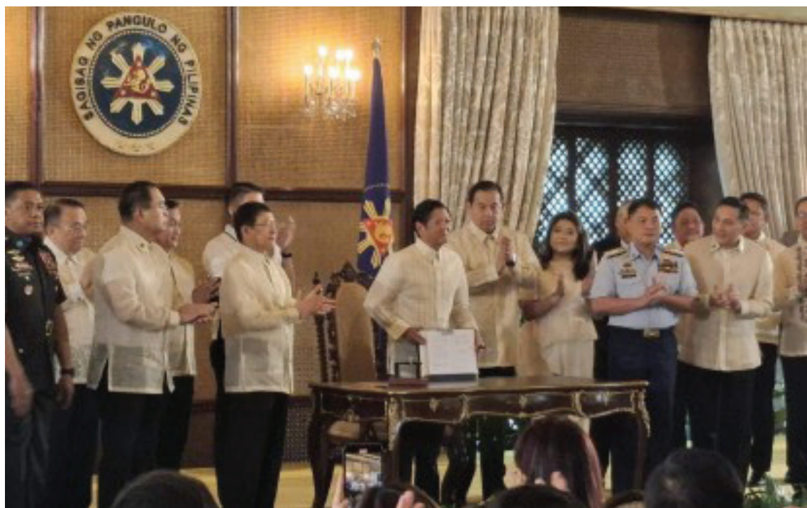
NEW LAWS. President Ferdinand R. Marcos Jr. formally signs into law the Philippine Maritime Zones Bill and the Philippine Archipelagic Sea Lanes Bill in a ceremony at Malacañan Palace in Manila on Friday (Nov. 8, 2024). The new laws will be known as Republic Act (RA) 12064 or the Philippine Maritime Zones Act and RA 12065 or the Philippine Archipelagic Sea Lanes.

He said the declaration of the country's maritime zones and archipelagic