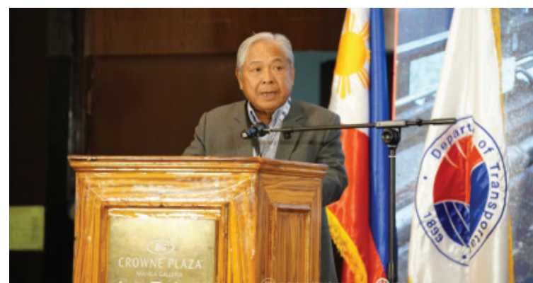
SAFE RAILWAY. Transportation Secretary Jaime Bautista delivers a message during the 2nd Philippine Railway Conference at the Crowne Plaza Manila Galleria on Thursday (Nov. 7, 2024). Bautista said passenger safety and security as well as socio-economic benefits to communities are paramount components of big-ticket rail projects.

"Alam po nating mahalaga ang late registration at kailangan ito ng mga kababayan nating nakatira sa malayong lugar o hirap ang access sa mga opisina ng"