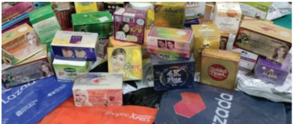
TOXIC. Forty-four skin-lightening beauty products sold online through Shopee and Lazada test positive for high levels of mercury and other hazardous substances. BAN Toxics, a waste management group, said Wednesday (Nov. 13, 2024) that these products have 7 parts per million (ppm) to an alarmingly high 67,400 ppm of mercury -- exceeding the 1 ppm limit set by the ASEAN Cosmetics Directive.

“We call on Lazada and Shopee to comply with existing regulations. Every seller, both onsite and online, must act with due diligence to prevent the further spread of mercury poisoning from such