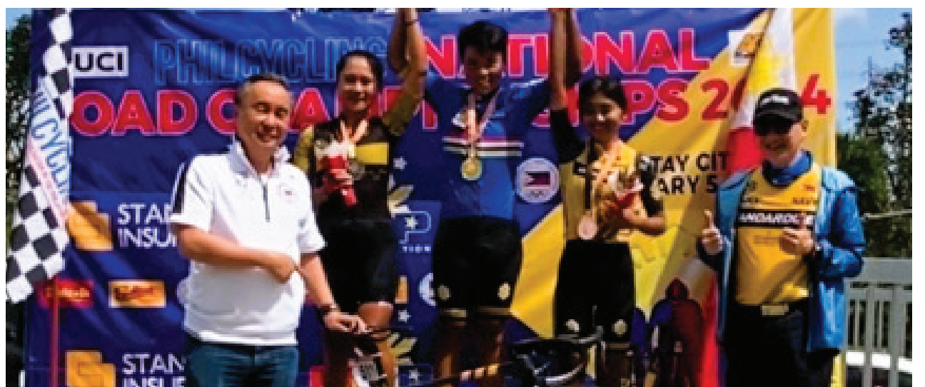
PhilCycling National Championships for Road in February 2024

The criterium races will be on Feb. 24, ITT on Feb. 25, and the road races for men's junior on Feb. 26, men's Under-23 and women's elite on Feb. 27, and men's elite on Feb. 28. (PNA)