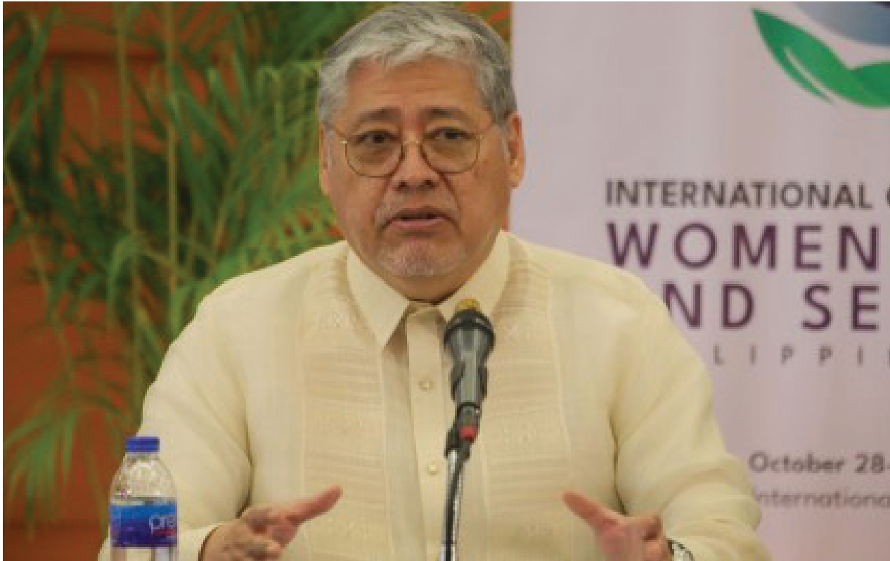
Foreign Affairs Secretary Enrique Manalo