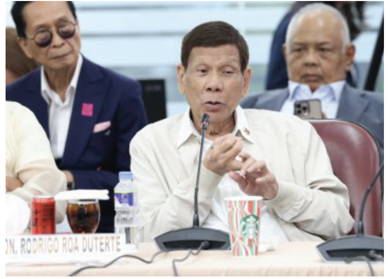
UNDER PROBE. Former president Rodrigo Duterte attends an inquiry on his administration's war on drugs at the House of Representatives on Wednesday (Nov. 13, 2024). Malacañang said the Philippine government would respect Duterte's decision to surrender to the International Criminal Court in the event that he is found guilty of alleged crimes against humanity committed during the implementation of his anti-drug campaign.

The Philippines formally cut ties with the ICC on March 17, 2019, a year after the country formally notified the United Nations of its withdrawal from the Rome Statute, which created the international court. (PNA)