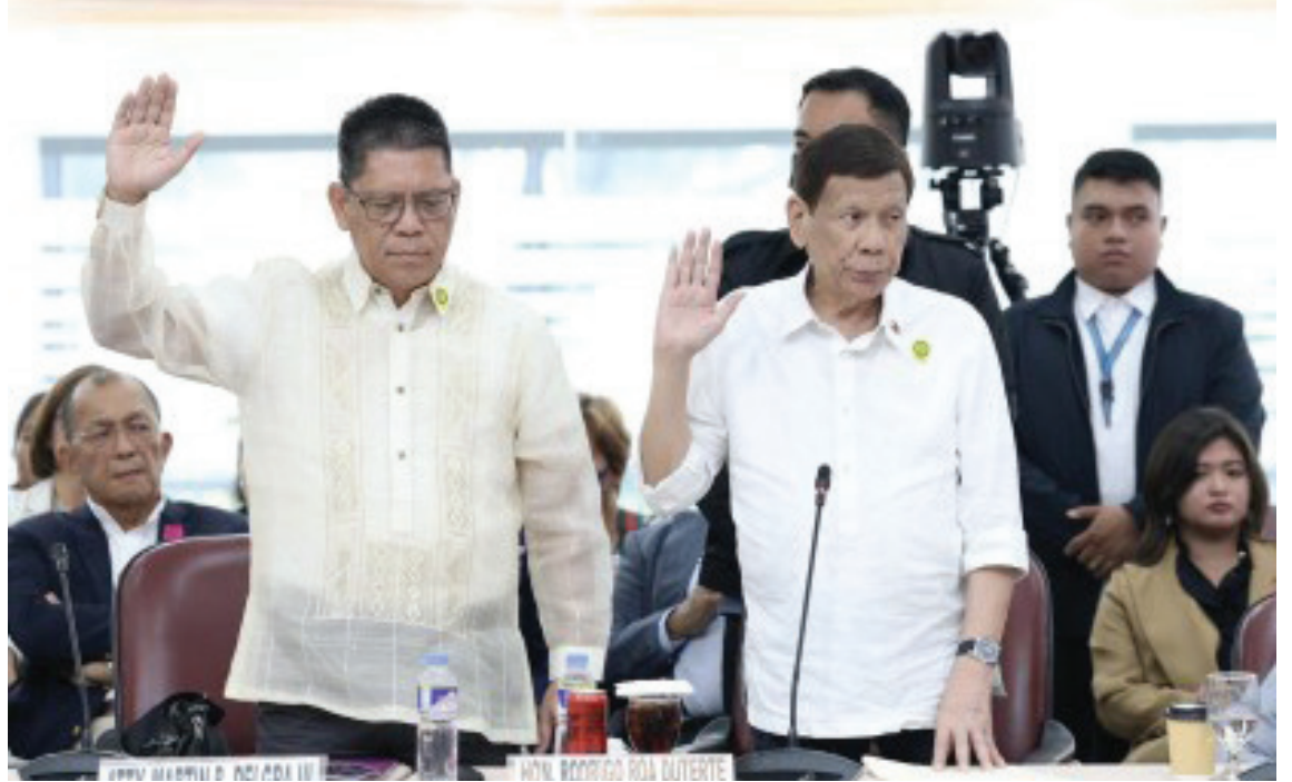
UNDER OATH. Former President Rodrigo Duterte (right) takes his oath before the House Quad Committee in its 11th hearing into the extrajudicial killings that happened during his administration's war on drugs on Wednesday (Nov. 13, 2024). Duterte confirmed the existence of a reward system for police officers who killed big-time drug suspects.