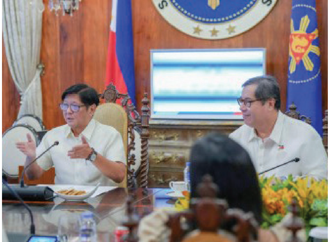
IMPROVED HEALTHCARE. President Ferdinand R. Marcos Jr. (left) meets with the Private Sector Advisory Council (PSAC) at Malacañan Palace in Manila on Nov. 13, 2024 to discuss ways to improve the country’s healthcare system. Marcos on Thursday (Nov. 14) said improving the education and training programs for radiologic technologists in the country is one of the plans discussed during the meeting.

PhilHealth implemented a 30-percent increase in the coverage rates of most of its benefit packages on Feb. 14, 2024 to reduce the out-of-pocket medical expenses of Filipinos. (PNA)