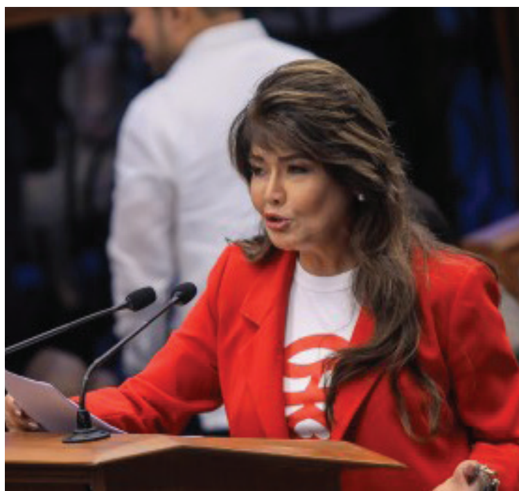
Senator Imee R. Marcos

MANILA – Senator Imee Marcos on Thursday called for urgent action to upgrade the country's disaster preparedness and the need for a national climate strategy.