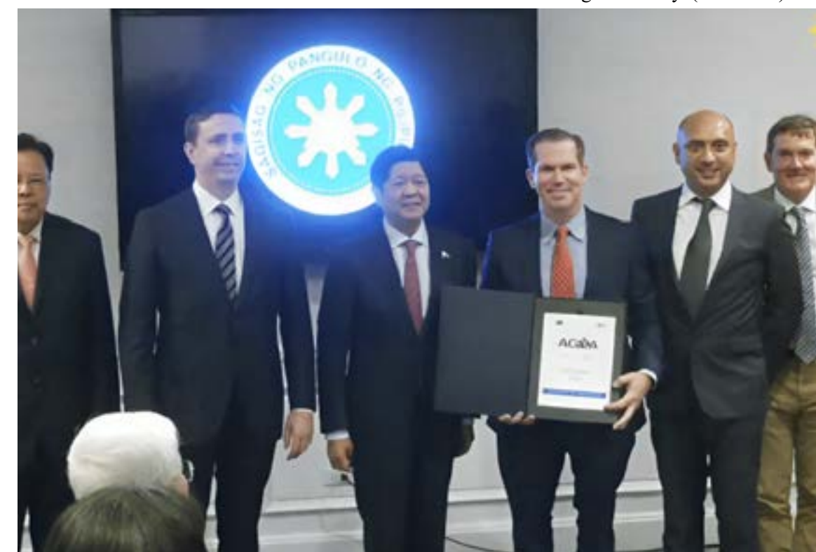
President Ferdinand R. Marcos, Jr. poses for a photo after witnessing the agreement signing between Philippine firm Orbits Corp. and California's Astranis Space Technologies in San Francisco in the United States.

Satellites equipped with internet capabilities orbit the Earth at altitudes up to 35,000 km. They act like wireless towers in space, receiving signals from ground stations and beaming coverage across wide areas below.