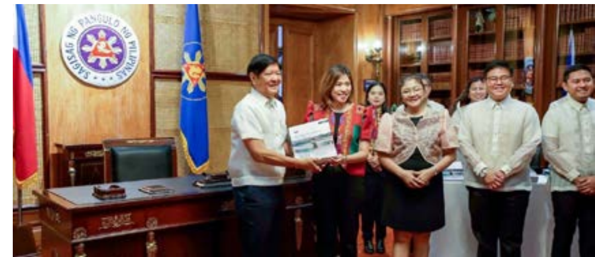
Department of Budget and Management Secretary Amenah Pangandaman presents the National Expenditure Program for Fiscal Year 2024 to President Ferdinand Marcos Jr.

President Marcos is expected to sign the approved 2024 NEP in December 2023. (DBM/PIA-NCR)