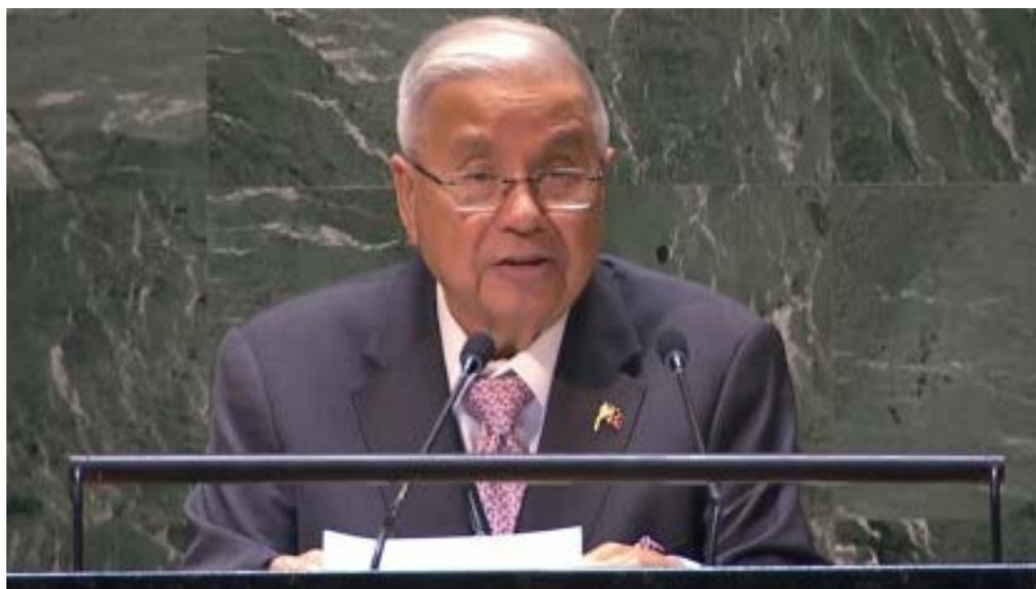
VETO POWER. Philippine Permanent Representative to the United Nations Antonio Lagdameo delivers the country’s statement during the 78th UN General Assembly plenary meeting at the UN headquarters in New York, USA on Nov. 16, 2023. He said the Philippines supports calls for a UN Security Council reform that would address issues with the current veto process which hinders swift actions during crisis.