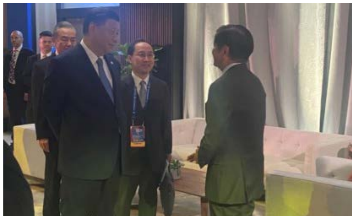
'WORK IN PROGRESS'. President Ferdinand R. Marcos Jr. (right) holds a pull-aside meeting with Chinese President Xi Jinping on the sidelines of the Asia-Pacific Economic Cooperation Summit in San Francisco, California on Saturday, Manila time (Nov. 18, 2023). Marcos said the discussion between him and Xi should be viewed as a "work in progress" and part of the process to ease tensions in the South China Sea.

During his meeting with Harris, Marcos said his administration would find ways to assess "for the near future on what the Philippines' role will be or what is the proper Philippines' role in the West Philippine Sea."