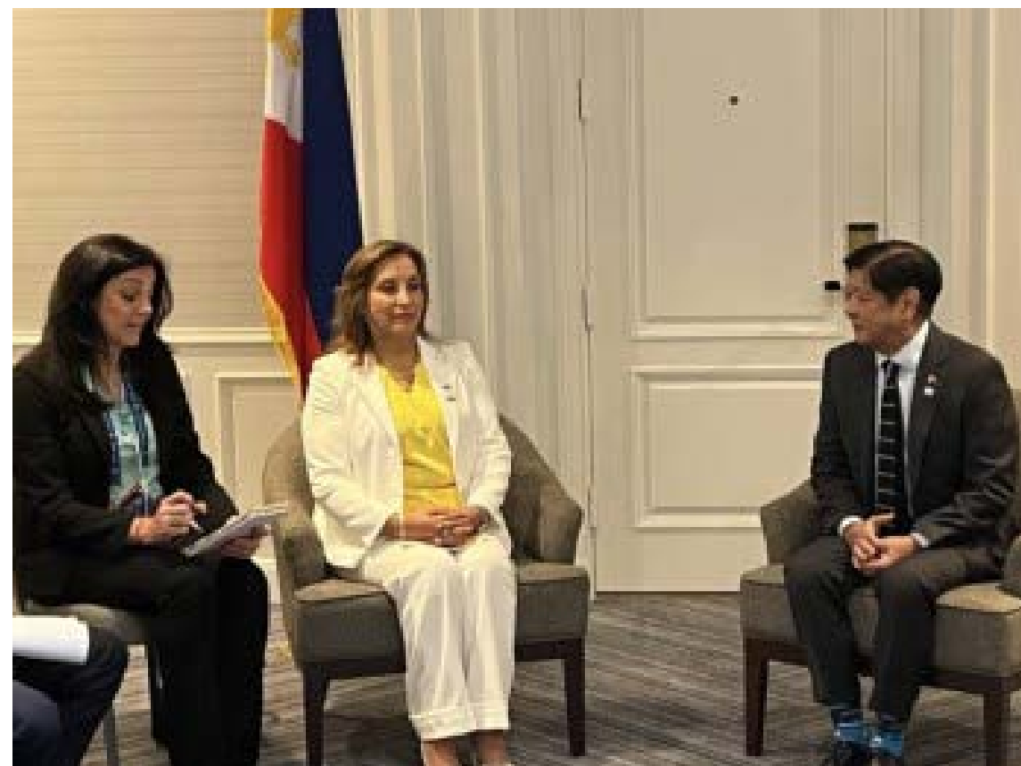
IMPROVED PH-PERU TIES. President Ferdinand R. Marcos Jr. (right) holds a bilateral meeting with Peruvian President Dina Boluarte (2nd from left) on the sidelines of the Asia-Pacific Economic Cooperation summit in San Francisco, California on Saturday, Manila time (Nov. 18, 2023). During the meeting, Marcos expressed his intent to elevate the Philippines' relations with Peru, as the two nations both seek to revitalize their economies post-pandemic.

Investment areas for promotion to Peru include manufacturing, infrastructure, and energy.