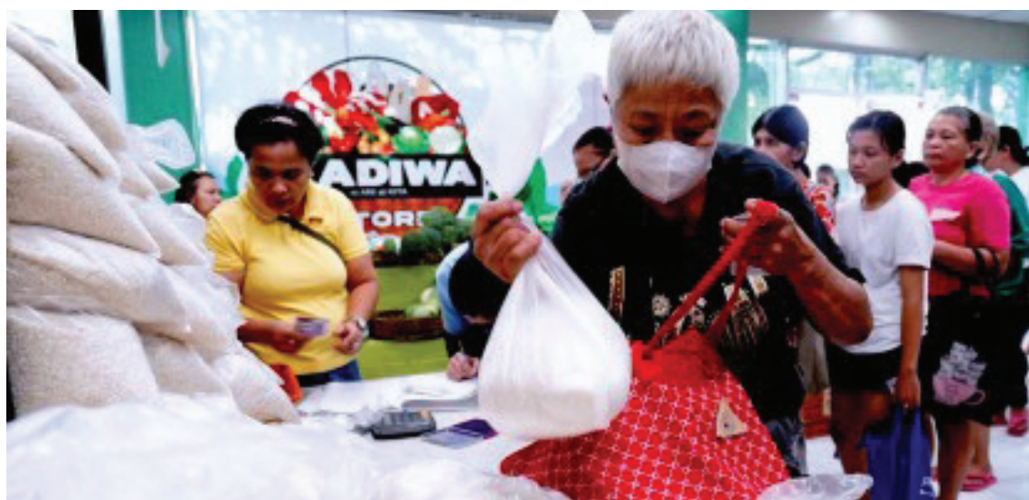
CONTINUOUS ROLLOUT. A senior citizen bags 10 kilos of rice that cost PHP29 per kilogram she bought at the Department of Agriculture-Agribusiness Development Center Kadiwa Store in Elliptical Road, Diliman, Quezon City on July 8, 2024. The Department of Agriculture on Wednesday (Oct. 2) vowed to continue its rollout alongside the Rice for All program to benefit more Filipinos with affordable and good quality rice.