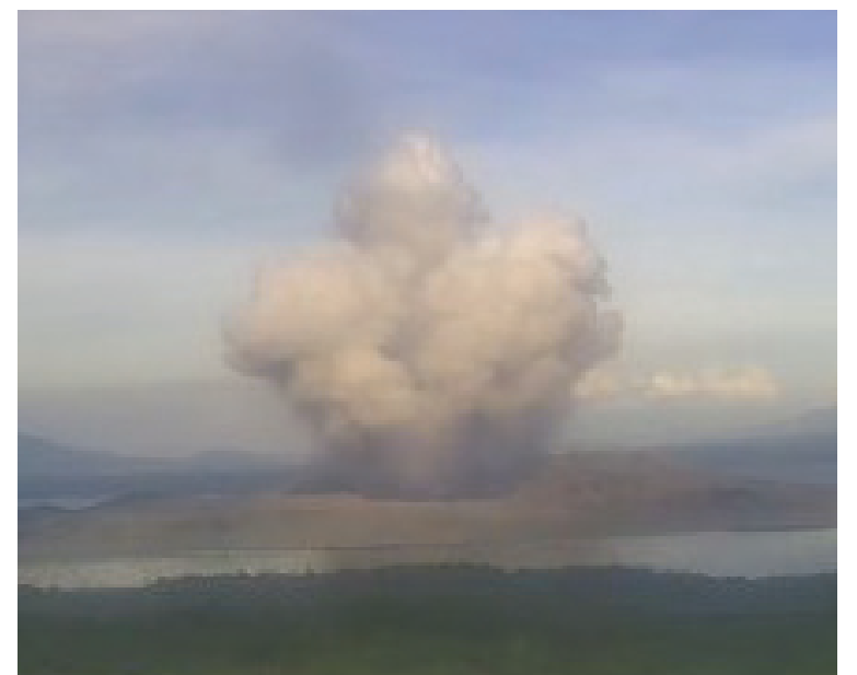
Taal Volcano