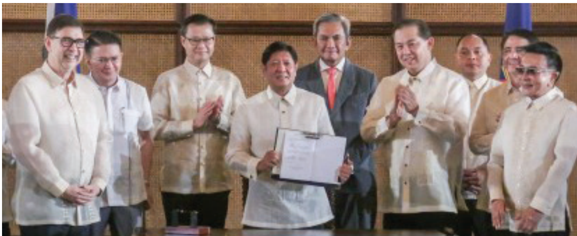
VAT LAW. President Ferdinand R. Marcos Jr. signs the Value Added Tax (VAT) on Digital Services Law at Malacañan Palace on Wednesday (Oct. 2, 2024). Republic Act 12023 imposes a 12-percent VAT on foreign digital service providers, such as Netflix, Spotify, Disney, and HBO, to generate additional revenue for the government and level the playing field for local providers.

“They are already doing this in other countries. They’ve been complying. Actually, we’re late in the game in collecting from non-resident DSPs,” she said. (PNA)