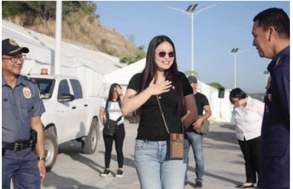
Dismissed Bamban, Tarlac mayor Alice Guo

"Lima ang qualifications. Kung hindi from page 2..."