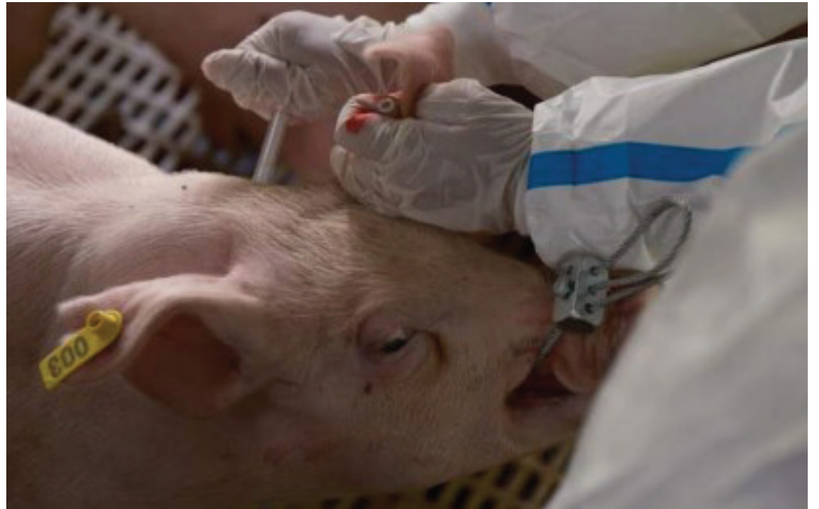
HIGHER ANTIBODY. The Department of Agriculture - Bureau of Animal Industry (DA-BAI) rolls out the first government-controlled vaccination against African swine fever for healthy pigs in Barangay Malapad na Parang, Lobo, Batangas on Aug. 30, 2024. The DA on Thursday (Oct. 3, 2024) said the vaccinated hogs have developed higher antibodies after 30 days.

The areas with the highest number of red zones are North Cotabato with 131, Quezon with 98, Batangas with 72, Camarines Sur with 43, and La Union with 35. (PNA)