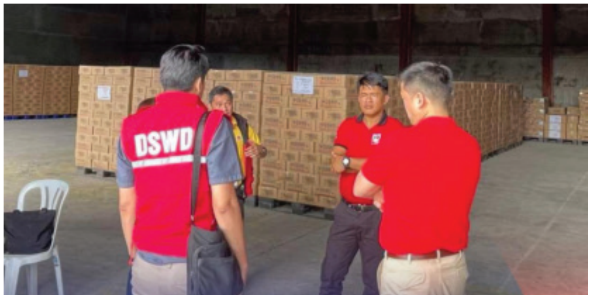
DSWD WAREHOUSE. Employees of the Department of Social Welfare and Development (DSWD) chat in a warehouse in this undated photo. The DSWD on Thursday (Oct. 3, 2024) said it now has 981 storage facilities nationwide that are being used for faster disaster response.