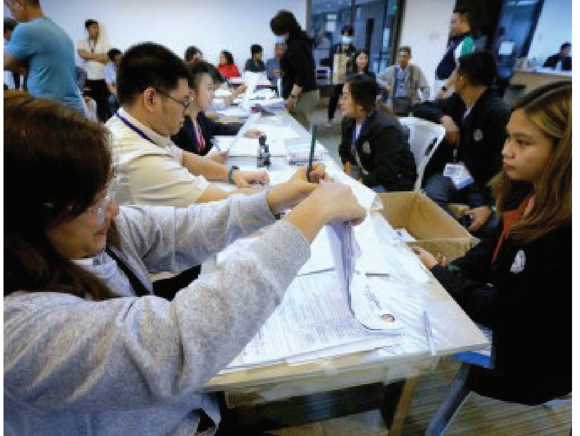
SCREENING. Commission on Elections staff check the submission of certificates of candidacy (COCs) and certificates of nomination and acceptance (CONA) and other election documents from all regions at their main office in Intramuros, Manila on Thursday (Oct. 10, 2024). The poll body said it would release the initial list of candidates for next year’s midterm elections before the end of this month. (PNA photo by Yancy Lim)

The poll body received more than 43,000 COCs from those seeking to be elected as senators, party-list representatives and for different positions in provinces, cities and municipalities nationwide from Oct. 1 to 8. (PNA)