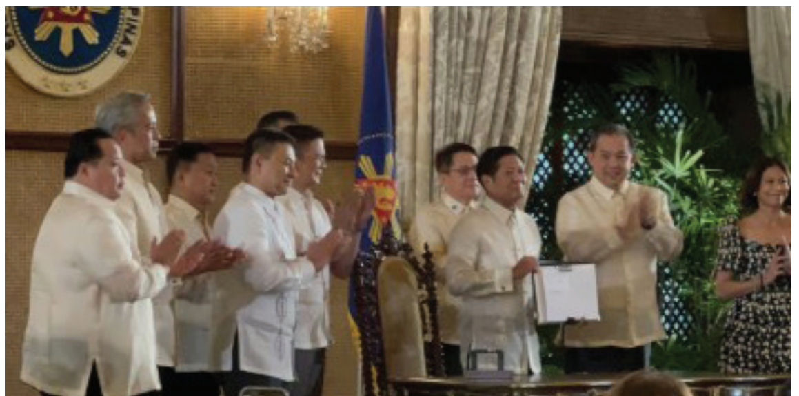
LEARNING RECOVERY. President Ferdinand R. Marcos Jr. signs the Academic Recovery and Accessible Learning (ARAL) Act at the Ceremonial Hall of Malacañan Palace in Manila on Friday (Oct. 18, 2024). Marcos signed the law, to accelerate learning recovery and improve the quality of education in the country.