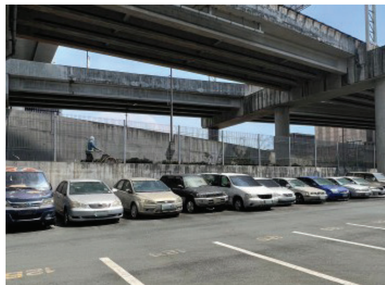
ABANDONED VEHICLES. Some of the more than 20 abandoned vehicles at the Ninoy Aquino International Airport (NAIA). The operator of NAIA on Thursday (Oct. 17, 2024) called on the owners of these abandoned cars to reclaim their vehicles or they would be towed soon.