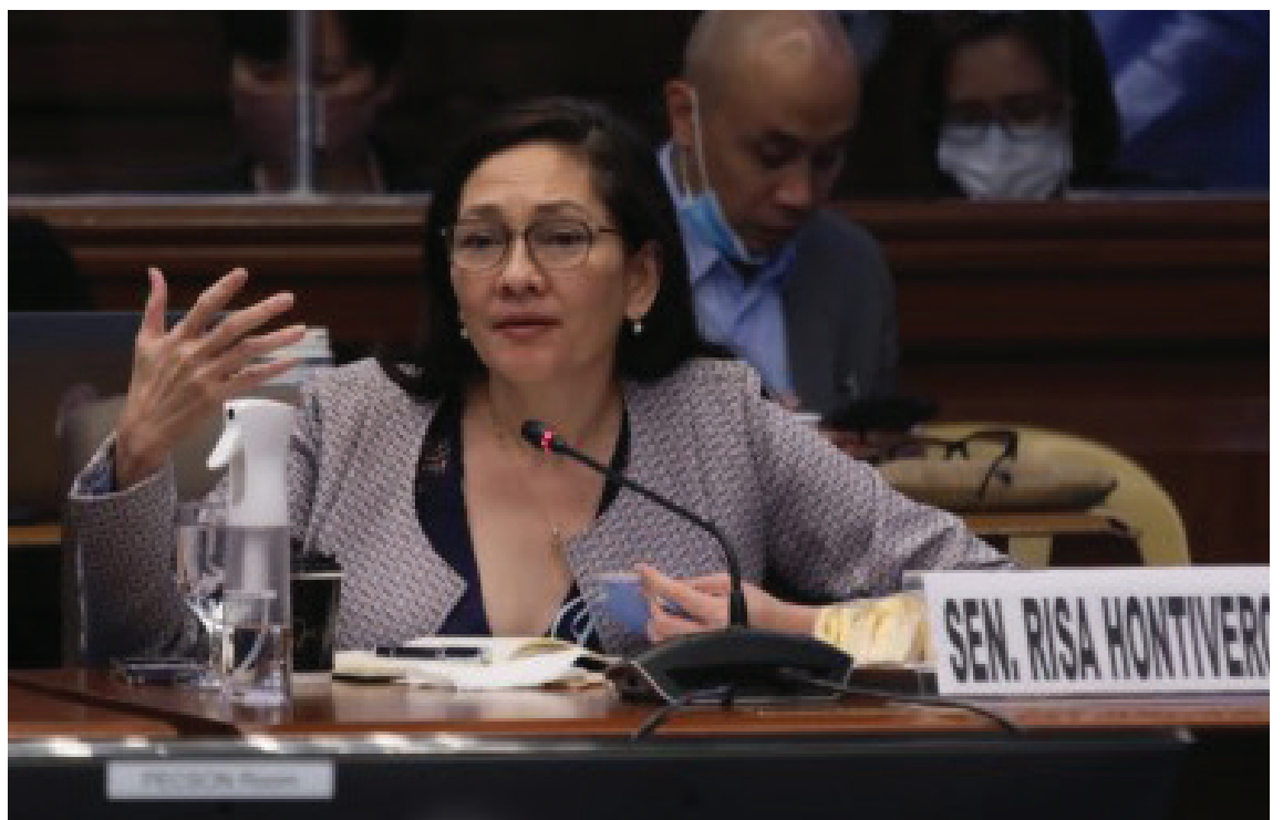
Senate Deputy Minority Leader Risa Hontiveros (File photo)