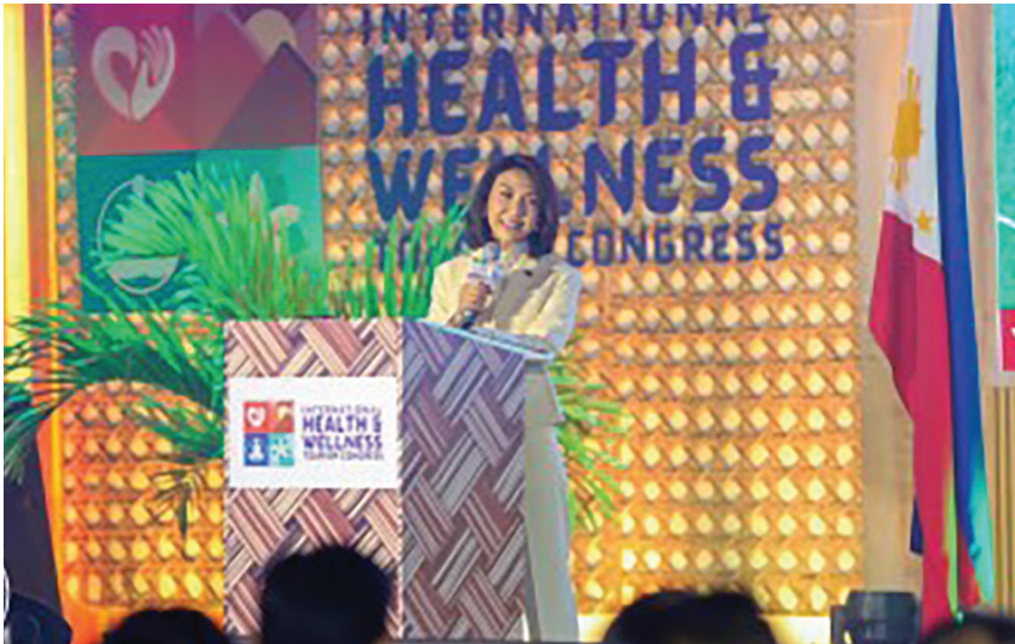
Tourism Secretary Christina Garcia Frasco (Photo courtesy of DOT) Tourism Secretary Christina Garcia Frasco (Photo courtesy of DOT)

Last Oct. 14, the DOT also launched the International Health and Wellness Tourism Congress (IHWTC) that gathered stakeholders and delegates from at least 38 countries. (PNA)