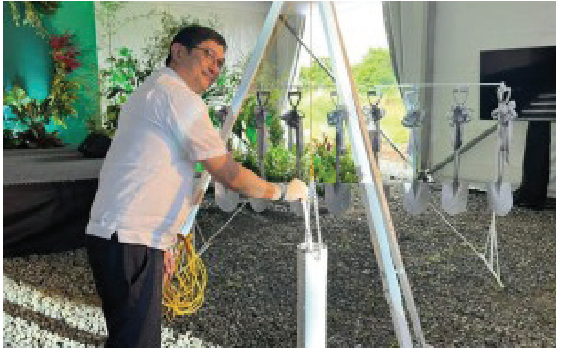
GROUND BREAKING. Department of Transportation (DOTr) Undersecretary for Road Transport Andy Ortega during the groundbreaking of the Ayala Greenfield Interchange in Calamba City on Monday (Oct. 14, 2024). Ortega said the project will help ease traffic in Calamba City and provide easier access to the South Luzon Expressway from neighboring areas once completed.

It will provide easier access to SLEX and the STAR Tollway for motorists coming from Calamba. (PNA)