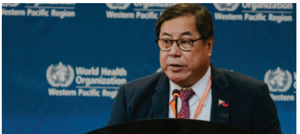
Department of Health Secretary Teodoro Herbosa