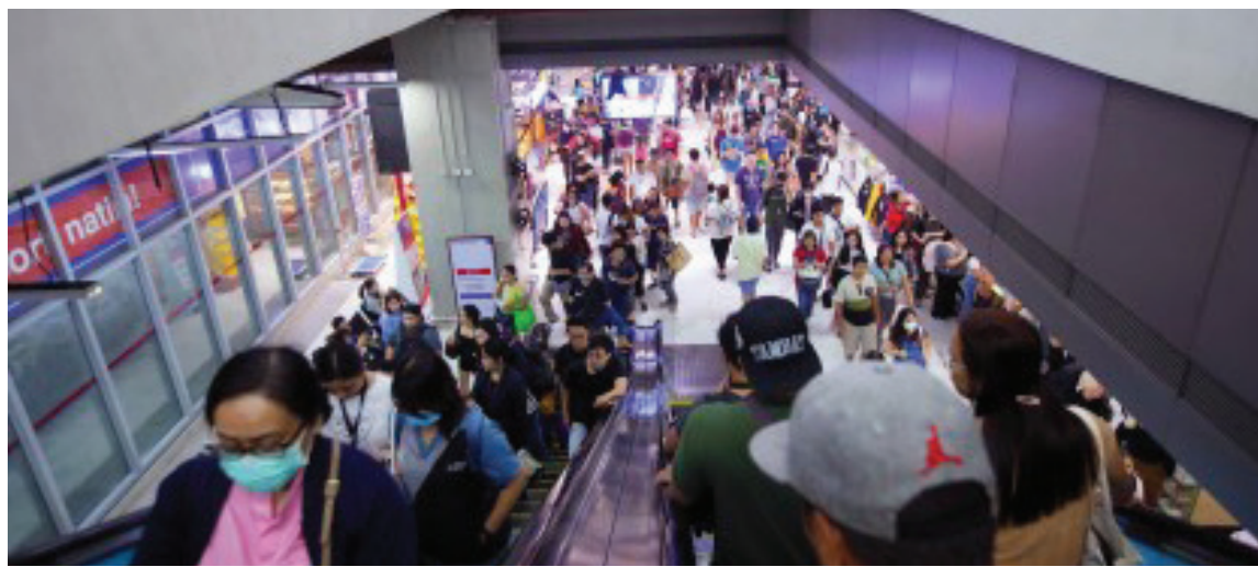
UNDAS PREPS. Commuters flock to the Parañaque Integrated Terminal Exchange on March 27, 2024 for the Holy Week rush. The Land Transportation Franchising and Regulatory Board (LTFRB) said Thursday (Oct. 24, 2024) it has granted special permits to 753 units as it ramps up its preparations for the expected volume of passengers traveling for the observance of Undas this year.