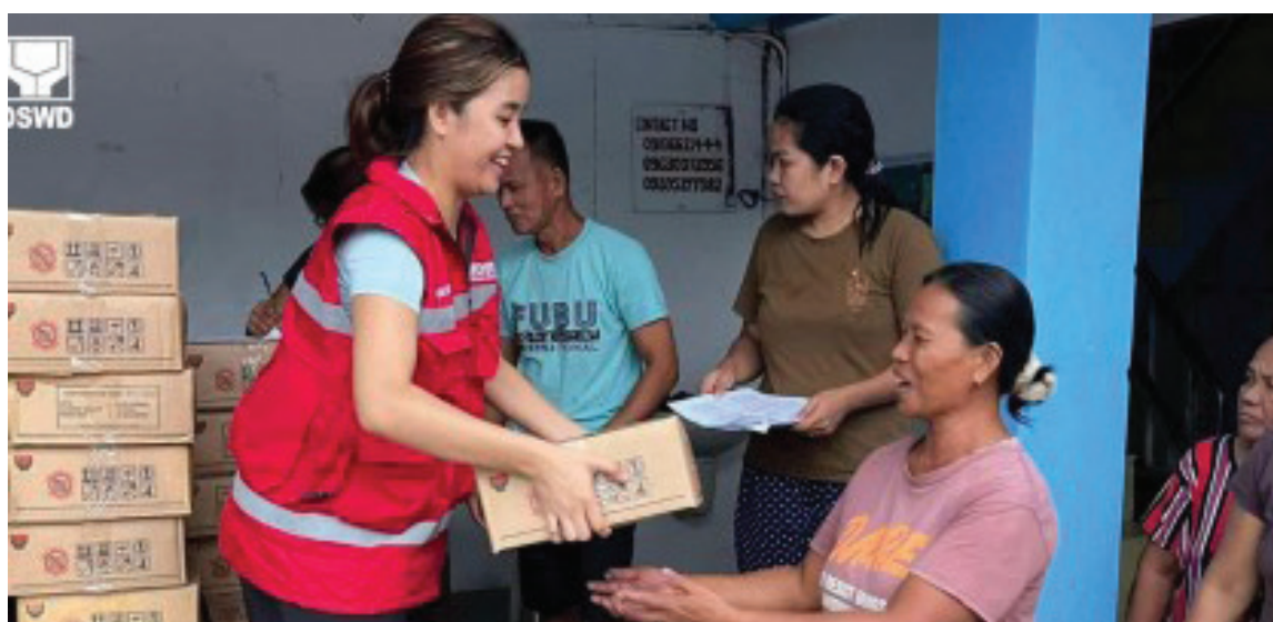
RELIEF OPERATIONS. The Department of Social Welfare and Development Field Office 5 distributes family food packs to 2,185 families from 20 barangays affected by severe tropical storm Kristine (international name: Trami) in Baras, Catanduanes on Wednesday (Oct. 23, 2024). DSWD Secretary Rex Gatchalian assured sufficient supply of FFPs, as well as funding for the provision of financial assistance.