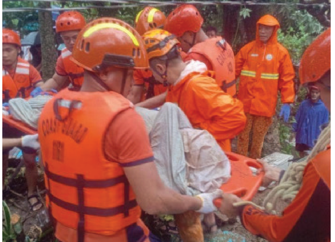
KRISTINE'S FURY. Philippine Coast Guard rescuers assist in the retrieval of the bodies of two residents after a landslide in Sitio Libas, Barangay Maguilton, Guinobatan, Albay on Wednesday (Oct. 23, 2024). The NDRRMC reported that Severe Tropical Storm Kristine (Trami) has so far left seven people dead and has affected over 431,000 families.

Around 1,007 houses were also reported damaged in seven regions. (PNA)