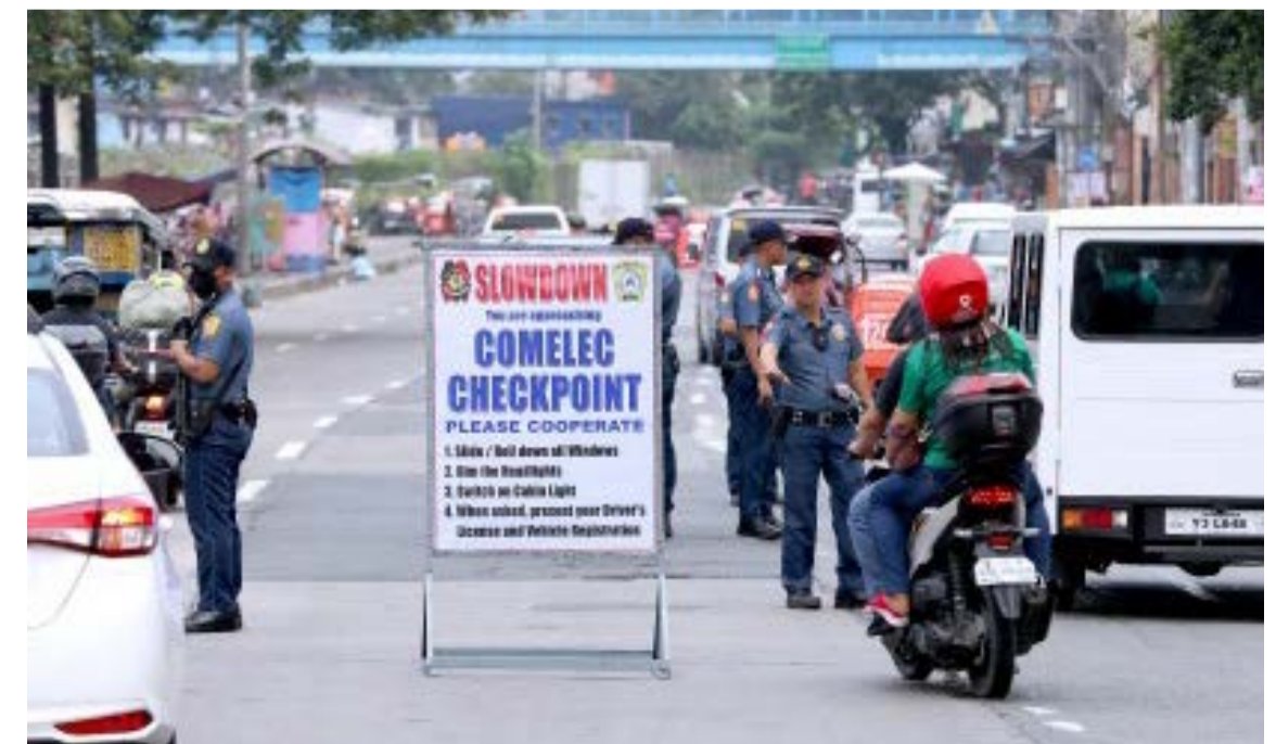
CHECKPOINT. Quezon City Police District personnel operate at a checkpoint along Luzon Avenue in Quezon City on Aug. 28, 2023 for the Barangay and Sangguniang Kabataan Elections. Increased police visibility, checkpoints and gun bans are to be carried out until Nov. 29.