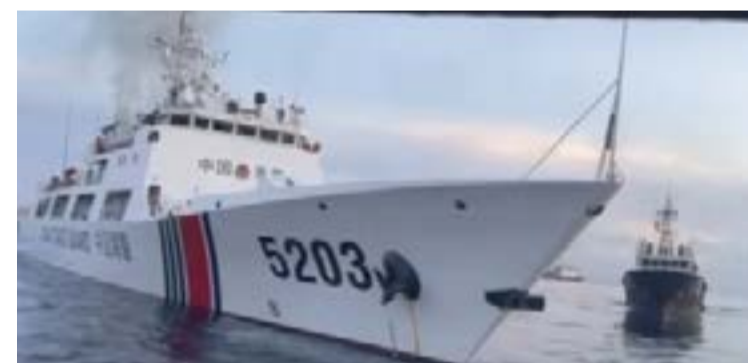
FIGHTING CHINESE AGGRESSION. A ship of the China Coast Guard is seen during the incident where its vessels hit Filipino ships conducting a routine resupply mission to the detachment aboard the BRP Sierra Madre in Ayungin Shoal in the West Philippine Sea on Oct. 22, 2023. Department of National Defense Secretary Gilberto Teodoro Jr. and US Defense Secretary Lloyd Austin III on Friday (Oct. 27, 2023) reaffirmed Manila and Washington DC's commitment to the Mutual Defense Treaty amid China's latest provocation.

"The Secretaries look forward to meeting in person in Jakarta on the margins of the upcoming ASEAN (Association of Southeast Asian Nations) Defense Ministers' Meeting (ADMM) Plus," the statement added. (PNA)