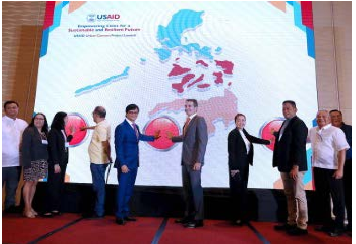
URBAN CONNECT. The US Agency for International Development formally launches on Thursday (Oct. 26, 2023) its USD11-million Urban Connect project to boost economic growth in nine cities across the Philippines by providing technical assistance and helping them maximize e-government solutions. The nine cities are Batangas, Legazpi, Puerto Princesa, Iloilo, Tacloban, Tagbilaran, Cagayan de Oro, General Santos and Zamboanga.