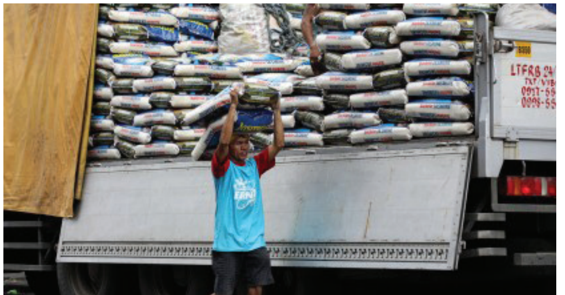
EASING RICE INFLATION. A worker unloads sacks of rice from a truck in Tondo, Manila on Jan. 20, 2025. The Department of Agriculture on Wednesday (Feb. 5, 2025) expressed optimism to further tame rice inflation in the coming months.