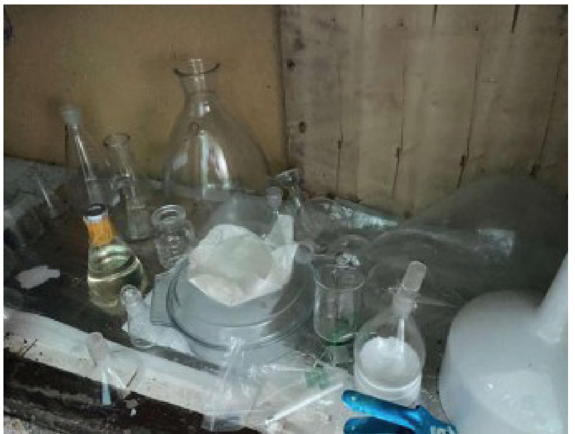
UNCOVERED. Laboratory equipment were among the items seized by law enforcement in the aftermath of a blast that resulted in the discovery of a kitchen-type shabu laboratory in Tanza, Cavite in this undated photo. A manhunt is ongoing for four suspects believed to be the operators of the clandestine laboratory.