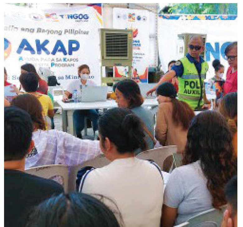
STRICT GUIDELINES. Hundreds of beneficiaries queue up for the Ayuda sa Kapos ang Kita Program in Davao City on Sept. 4, 2024. The Department of Social Welfare and Development on Tuesday (Feb. 4, 2025) reiterated that it has set an eligibility criteria in identifying intended beneficiaries and that referrals will not guarantee aid.

The AKAP is a program intended to provide targeted social assistance and safety net for low-income earners whose purchasing power eroded due to inflation. (PNA)