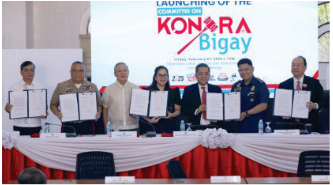
CLEAN POLLS. Commission on Elections Chairperson George Erwin Garcia (5th from left) leads the signing of a memorandum of agreement to strengthen the “Kontra Bigay” (anti-bribery) task force at the poll body’s office in Intramuros, Manila on Friday (Feb. 7, 2025). The police and military, other government agencies, and e-wallet providers GCash and Maya are partners of the campaign against vote buying and vote selling.

The 90-day campaign period for candidates running for senatorial posts and party-list representatives will begin on Feb. 11. (PNA)