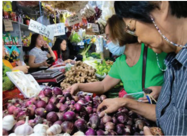
ONION PRICES. Consumers buy red onions at a public market in Fairview, Quezon City on Feb 10, 2025. The Department of Agriculture on Wednesday (Feb. 12) urged farmers and traders to bring initial harvests directly to markets instead of cold storage to stop the increasing retail prices of onion while awaiting the peak harvest and import arrivals.