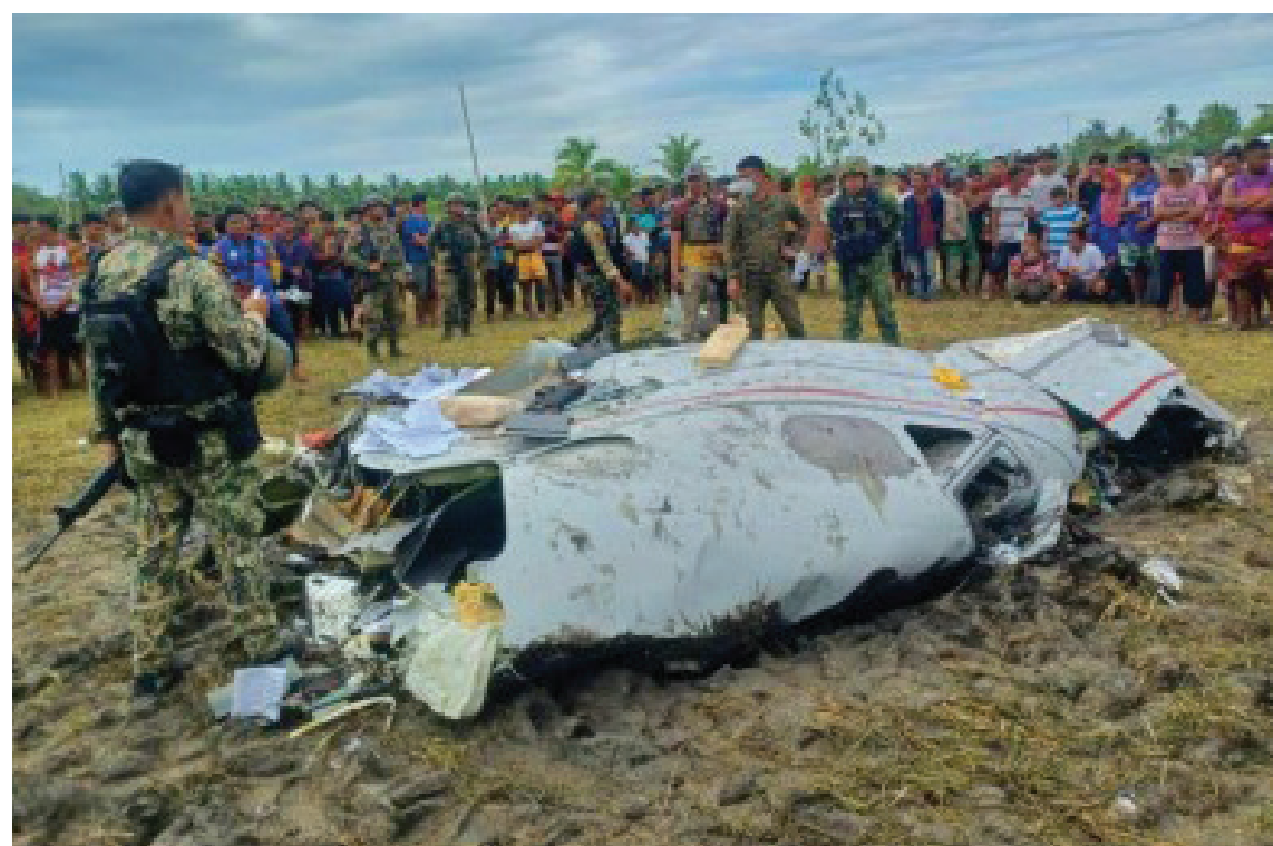
AVIATION SAFETY PUSHED. Police and military personnel inspect the wreckage of a Beechcraft King Air 300 that crashed in Ampatuan, Maguindanao del Sur on Feb. 6, 2025. Senator Sherwin Gatchalian on Sunday (Feb. 9) pushed for the passage of Senate Bill 2969 promoting aviation safety and security following the disaster that killed four.

From Academic Year 2014-15 to 2023-24, the PhilSCA system has maintained an average annual enrollment of 18,040 students, while producing an average of 3,266 graduates per year. (PR)