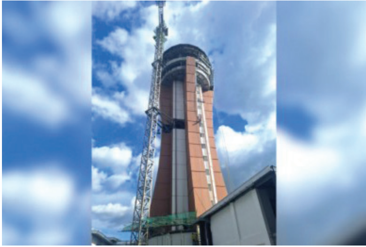
NEW LANDMARK. The 18-story air traffic control tower at the Clark International Airport will be the country's tallest infrastructure of its kind once completed in the second quarter of 2025. The ATC tower aims to improve operational efficiency at CRK.