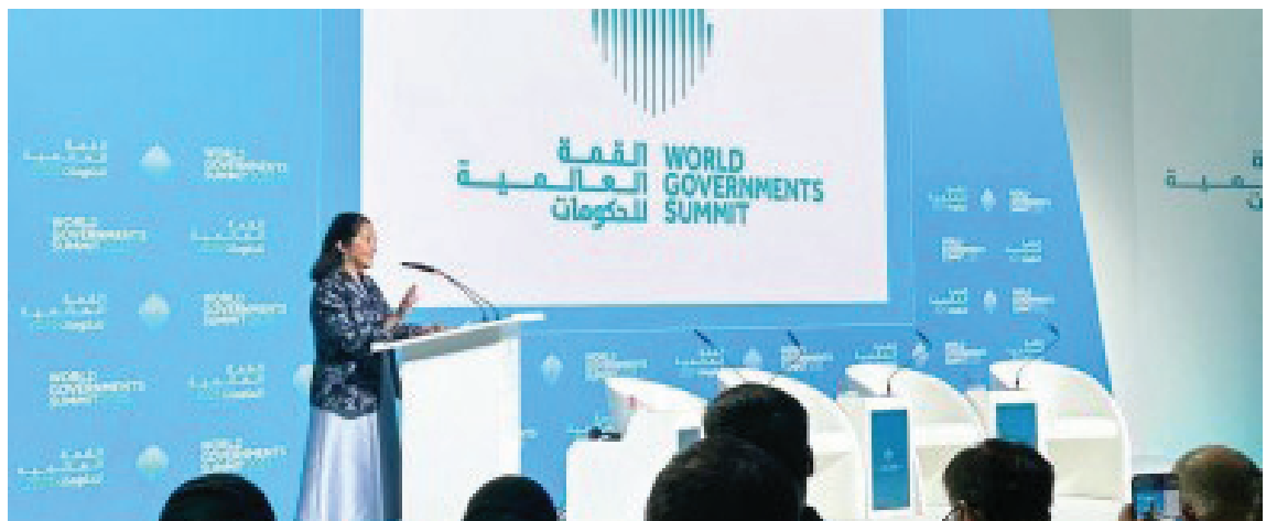
STRONGER COLLABORATION. First Lady Louise Araneta-Marcos delivers the main address for the Climate Adaptability and Energy Forum during the World Governments Summit in Dubai, United Arab Emirates (UAE) on Thursday (Feb. 13, 2025). Araneta-Marcos urged everyone to harness innovation, collaborate across borders, and take action to mitigate the impact of climate change.