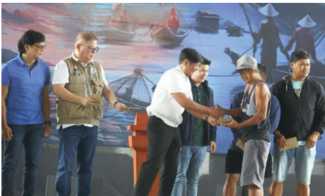
AID DISTRIBUTION. President Ferdinand R. Marcos Jr. (3rd from left) leads the distribution of the assistance to fisherfolk and families affected by the massive oil spills in Bataan in a ceremony in General Trias, Cavite on Wednesday (Aug. 28, 2024). Marcos expressed hope that the assistance would be enough to help them recover from the adverse impact of the oil spill.