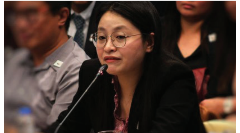
Dismissed Bambang, Tarlac mayor Alice Guo