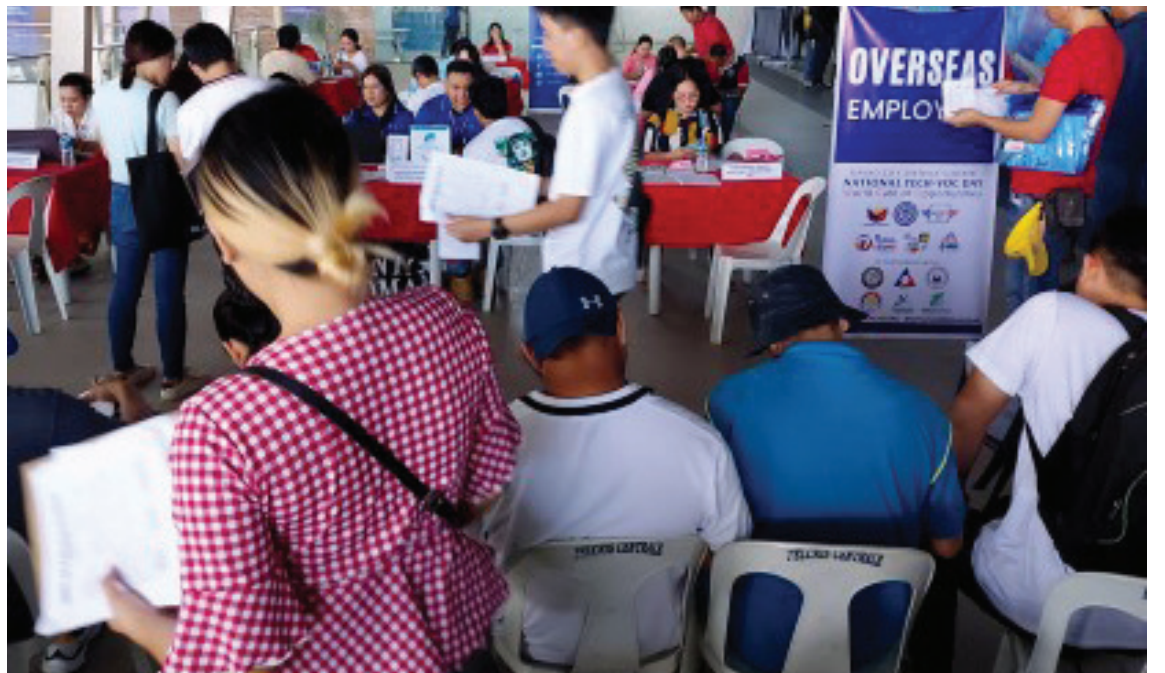
JOB FAIR. In celebration of National Tech-Voc Day, the Technical Education and Skills Development Authority in the Davao Region holds a job fair for graduates and alumni at the Felceis Centrale along Quimpo Boulevard in Davao City on Aug. 2, 2024. Philippine Statistics Authority data released on Friday (Sept. 6, 2024) showed that the country's unemployment rate decreased to 4.7 percent in July.

The suspects are currently under the custody of PDEG Special Operation Unit 4A (Calabarzon) for documentation and further investigation. They will face charges for violating Republic Act 9165, or the Comprehensive Dangerous Drugs Act of 2002. (PNA)