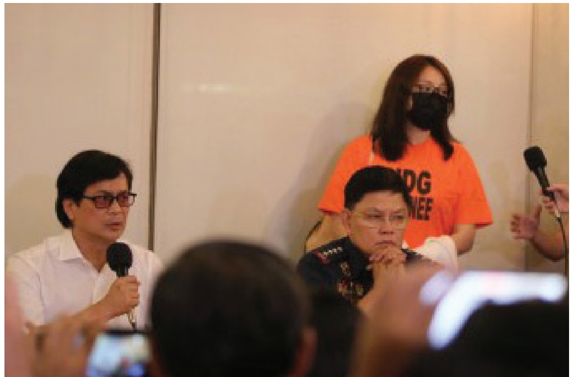
BACK TO FACE CHARGES. Department of the Interior and Local Government Secretary Benhur Abalos Jr. (left) and Philippine National Police (PNP) chief Gen. Rommel Marbil present dismissed Bamban, Tarlac Mayor Alice Guo (standing) to the media at the Royal Star Aviation Hangar in Pasay City early Friday (Sept. 6, 2024). The former mayor is facing a string of charges in the Philippines such as human trafficking, tax evasion, and money laundering.