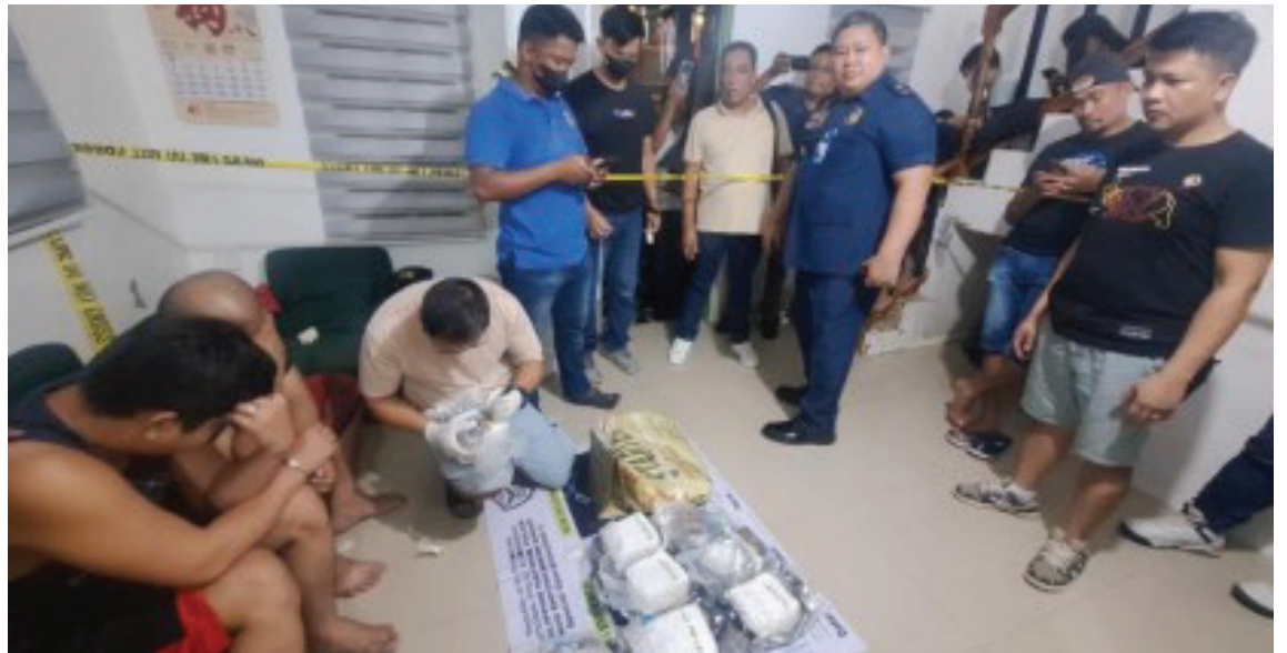
BIG HAUL. PNP Drug Enforcement Group chief Brig. Gen. Eleazar Matta (center, standing) oversees the buy-bust operation in Imus, Cavite on Monday night (Sept. 9, 2024). Two suspects yielded a total of 110 kg. of shabu with an estimated street value of PHP748 million during the operation.