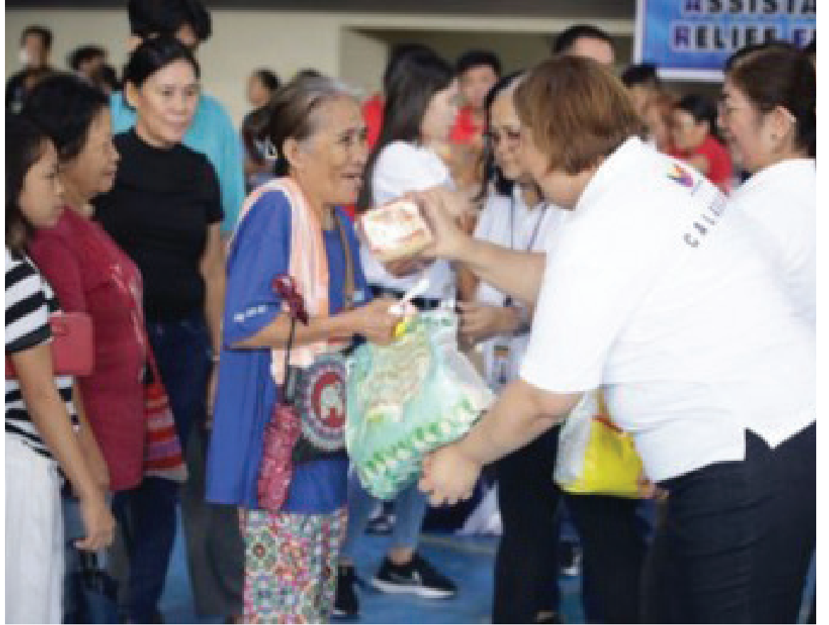
GRATEFUL. An elderly resident of Antipolo City, among those affected by Severe Tropical Storm Enteng, receives assistance from the Land Transportation Office-Calabarzon at the covered court of Barangay Inarawan on Friday (Sept. 6, 2024). The aid was given under the agency's Calabarzon Assistance & Relief Efforts program.

"This initiative highlights LTO's commitment to reaching those most affected by disasters and providing immediate relief to alleviate their hardships," Decena said. (PNA)