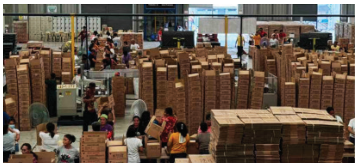
DISASTER RESPONSE. Volunteers help repack family food packs (FFPs) at the Department of Social Welfare and Development’s National Resource Operations Center in Pasay City in this undated photo. The DSWD on Thursday (Sept. 5, 2024) said it has adequate supply of FFPs and other relief items for augmentation to local government units affected by Severe Tropical Storm Enteng and future weather disturbances.