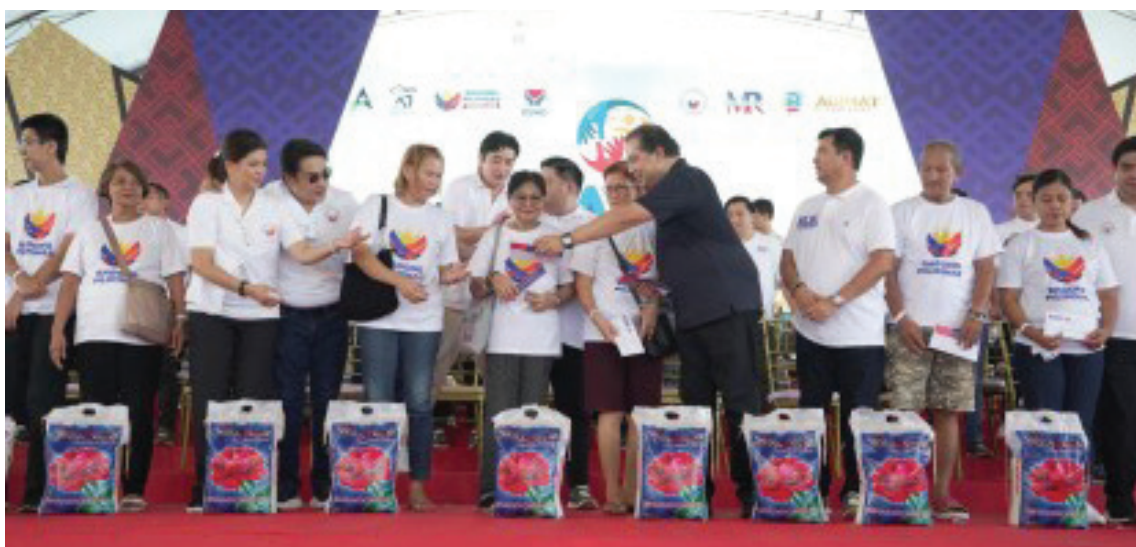
BAGONG PILIPINAS CARAVAN. Speaker Martin Romualdez leads the distribution of government assistance to indigent residents of Cavite under the Bagong Pilipinas Service Fair in Kawit, Cavite on Friday (Sept. 27, 2024). Romualdez said at least 120,000 residents benefited from cash assistance, scholarships, and livelihood programs worth PHP1 billion for Cavite province.