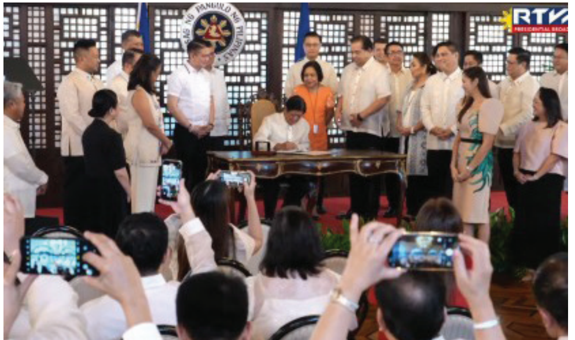
MORE TEETH. President Ferdinand R. Marcos Jr. signs Republic Act No. 12022 or the Anti-Agricultural Economic Sabotage Act before members of both houses of Congress, Cabinet members, and other agriculture stakeholders in a ceremony at Malacañang Palace on Thursday (Sept. 26, 2024). A priority measure of the administration, the new law makes agricultural smuggling, hoarding, profiteering, cartel and financing of these crimes classified as acts of economic sabotage and will carry a penalty of life imprisonment and hefty fines.