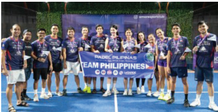
SECOND BEST. Members of the national team which bagged the silver medal at the 1st Asia Pacific Padel Cup in Bali, Indonesia on Sunday (Sept. 22, 2024). The Philippines lost to Indonesia, 2-3, in the final.

The Philippines displayed its brilliant form in the group stage, blanking India (5-0), Malaysia (5-0), Hong Kong (5-0) and Singapore (5-0).