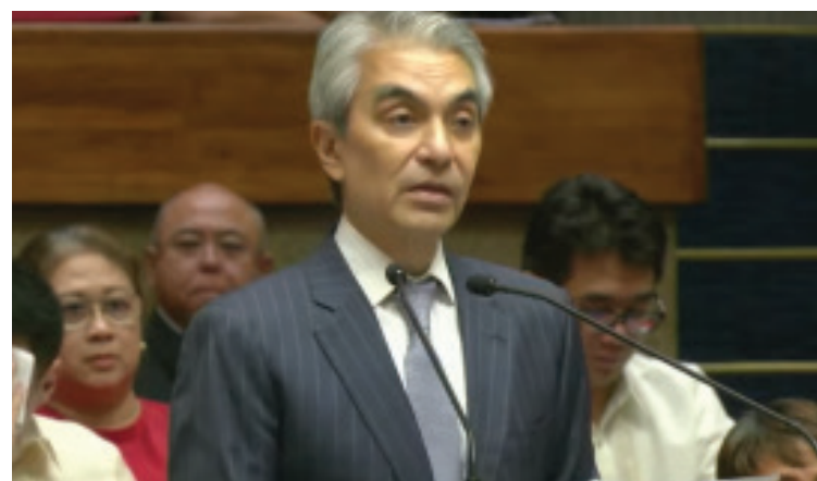
APPROVED. Navotas City Rep. and House Appropriations Committee vice chair Toby Tiangco sponsors the proposed PHP10.5-billion budget of the Office of the President for 2025 before the House plenary on Tuesday (Sept. 24, 2024). The House approved the budget after 33 minutes of interpellation. (Screengrab)