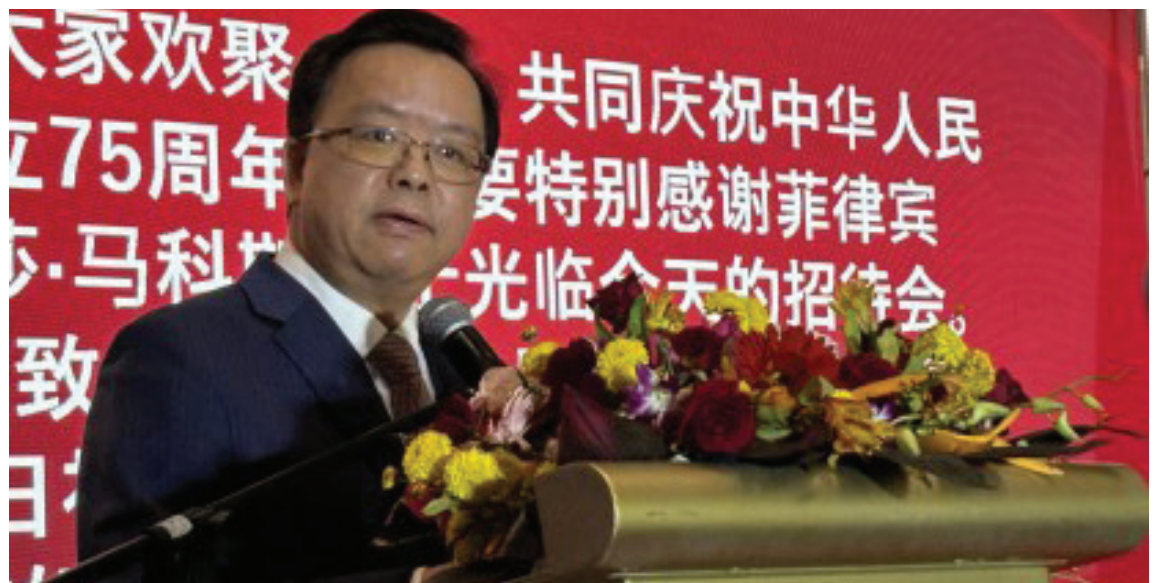
CELEBRATION. Chinese Ambassador Huang Xilian delivers his remarks in a reception celebrating the 75th founding anniversary of the PRC at Shangri-La The Fort in BGC on Thursday (Sept. 26, 2024). Huang urged for a renewal of commitment to the Philippines-China diplomatic ties, calling on the country to work with China in advancing cooperation and promoting regional peace and stability.