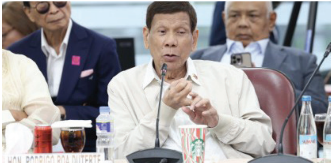
INVESTIGATION. Former president Rodrigo Duterte attends an inquiry on his administration’s war on drugs at the House of Representatives on Nov. 13, 2024. The House Quad Committee on Wednesday (Dec. 18) recommended the filing of crimes against humanity charges against Duterte, Senators Christopher Lawrence Go and Ronald Dela Rosa, and other police officials in connection with the alleged extrajudicial killings (EJKs) during the previous administration’s drug war.