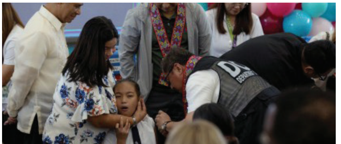
PREVENTION. Education Secretary Sonny Angara and Health Secretary Teodoro Herbosa lead the “Bakuna Eskwela Kick-Off” at Dr. A. Albert Elementary School in Manila on Oct. 7, 2024. The immunization program aims to protect school-aged children against vaccine-preventable diseases such as measles, rubella, diphtheria, and human papilloma virus.