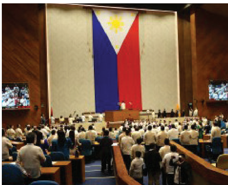
House of Representatives session hall

The quadcom also recommended the creation of an inter-agency body to investigate EJK, as well as the establishment of the Internal Affairs of the PNP as an independent and autonomous agency. (PNA)