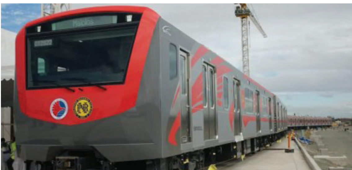
NEW TRAIN. One of the new trains of the Philippine National Railways - Clark Phase 1 during an inspection in Valenzuela City on Jan. 26, 2022. Transportation Secretary Jaime Bautista said Friday (Nov. 24, 2023) that the North-South Commuter Railway and the South Long Haul projects would usher in a “renaissance” in the country’s railway sector, providing jobs, boosting the economy, and providing connection across the country.