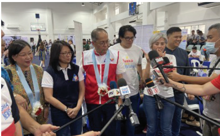
FOSTERING EMPLOYMENT. Labor Secretary Bienvenido Laguesma (center, wearing vest) and Manila Mayor Honey Lacuna (2nd from right) speak to reporters at the walkthrough of a job fair at Manila Science High School on Friday (Dec. 1, 2023). The Department of Labor and Employment distributed PHP8.5 million worth of cash and livelihood assistance to beneficiaries in Metro Manila, in celebration of its 90th founding anniversary.