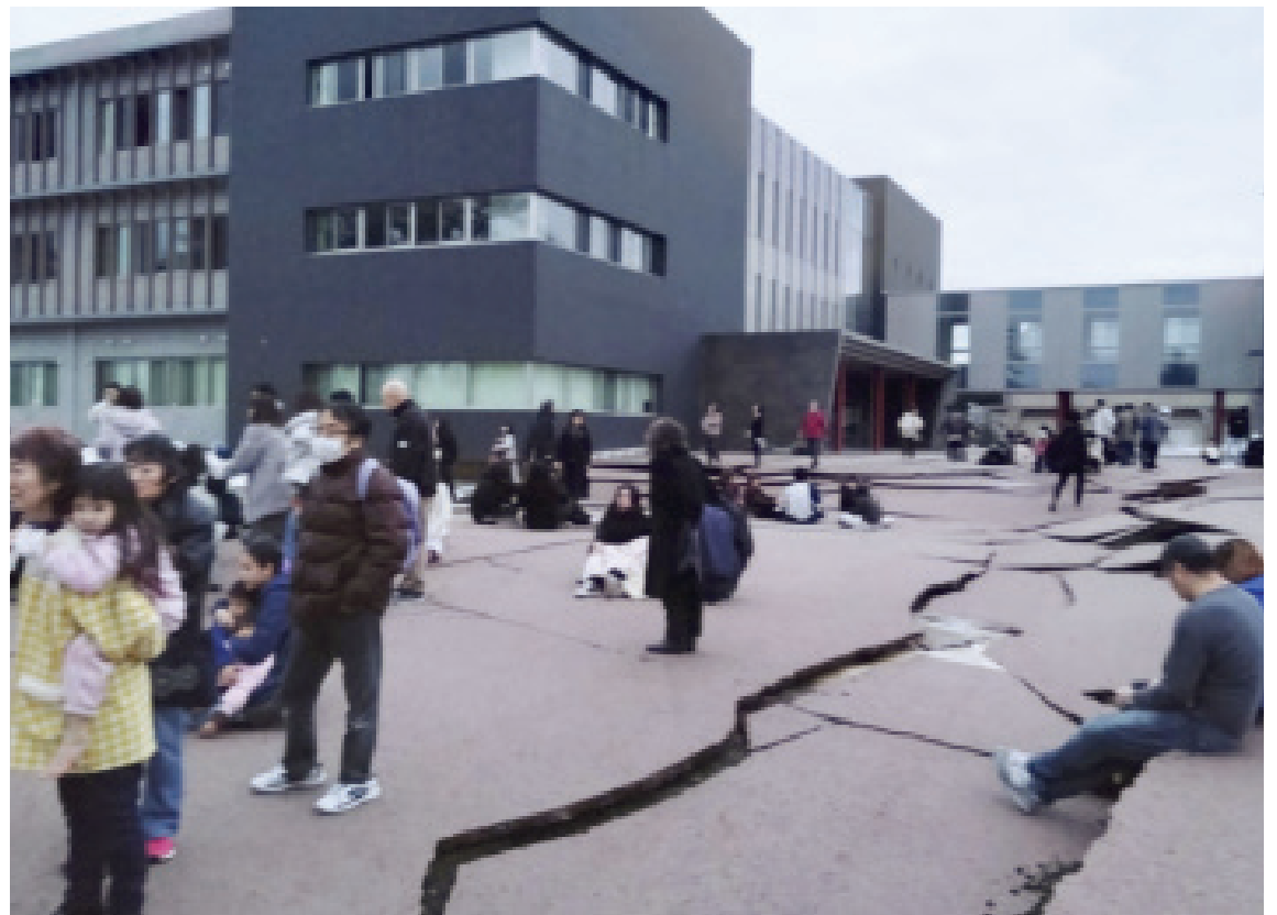
AFTERMATH. Large cracks are seen on the ground in Wajima, Ishikawa Prefecture, on Monday (Jan. 1, 2024), after a strong earthquake rocked a wide area on the Sea of Japan coast in central Japan. The Philippine Embassy in Tokyo said assistance is ready for affected Filipinos.

fostered a culture of health-conscious living, highlighting the effectiveness of community-driven healthcare efforts.