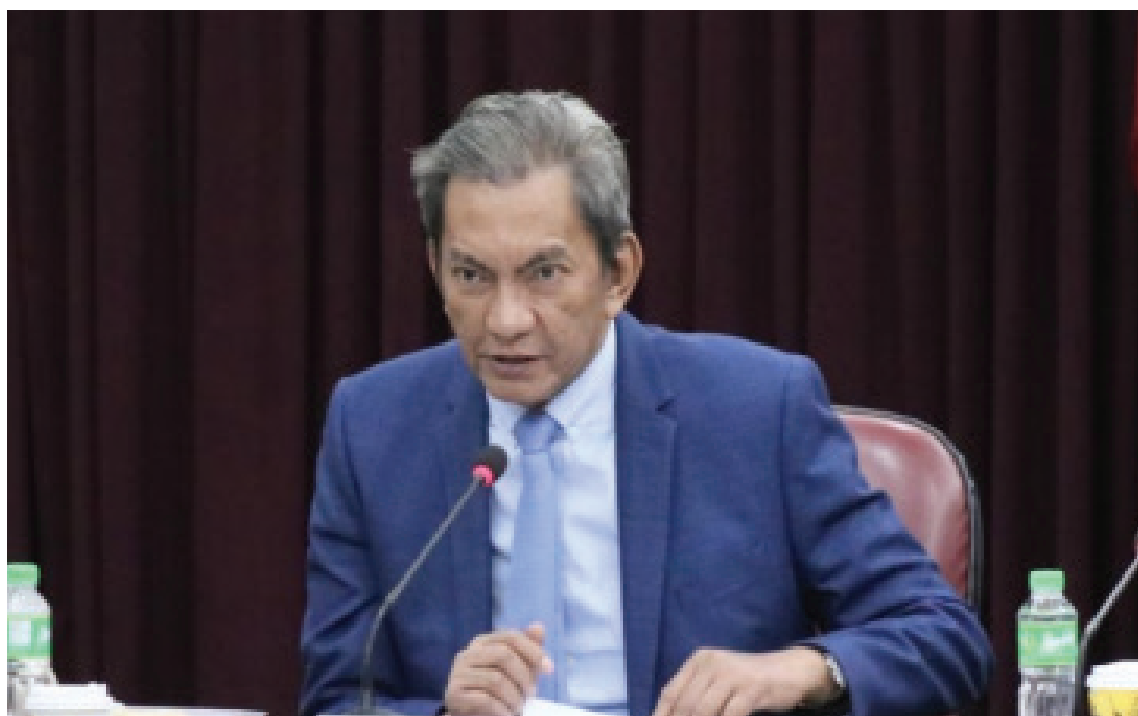
House ways and means committee chair and Albay Rep. Joey Salceda