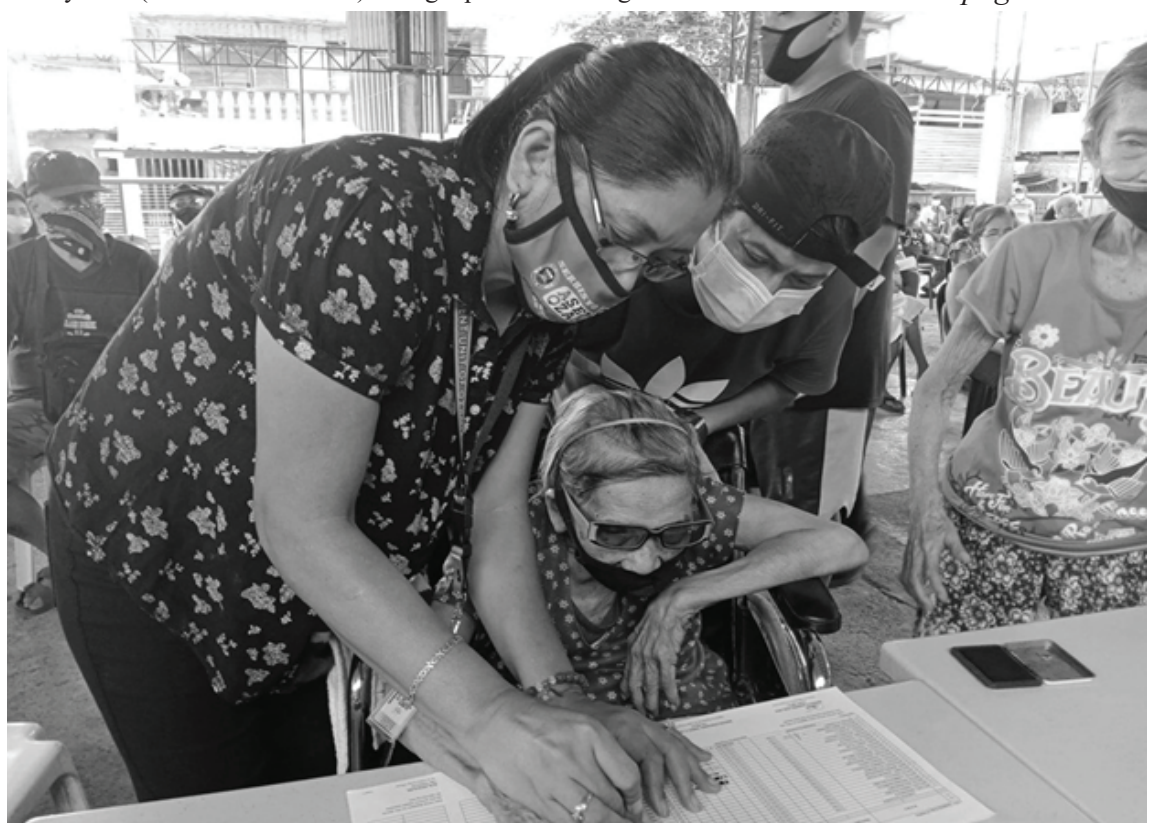
The Department of the Interior and Local Government has warned against the use of a politician's name, photo, or image in the distribution of aid worth P1,000 per individual, or a maximum of P4,000 per family, in the NCR Plus, which is under enhanced community quarantine.