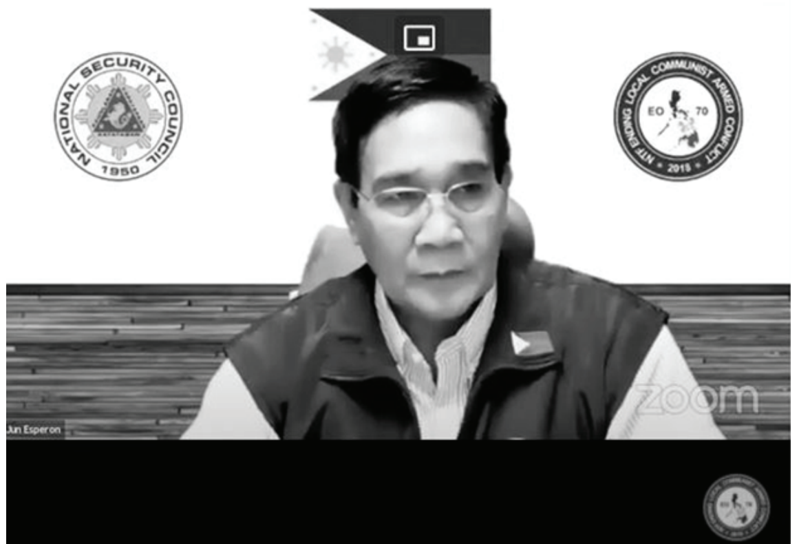
National Security Adviser Secretary Hermogenes Esperon Jr. joins peace-loving Filipinos in marking National Day of Solidarity, Condemnation and Outrage Against the CPP-NPA-NDF on Monday, March 29.