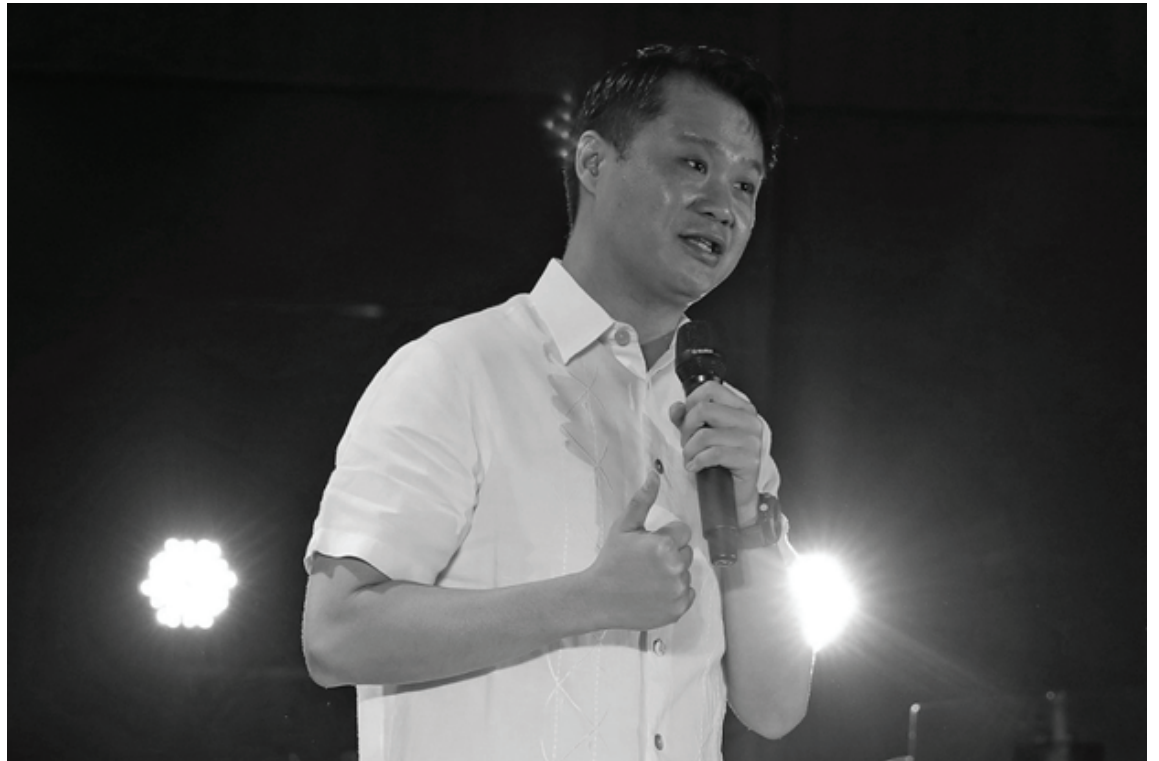
Senator Win Gatchalian