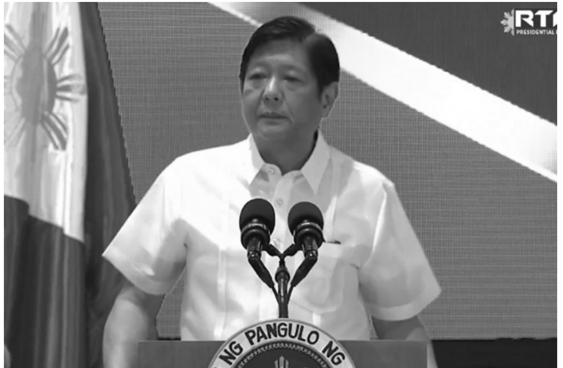
President Ferdinand "Bongbong" Marcos Jr (File photo)