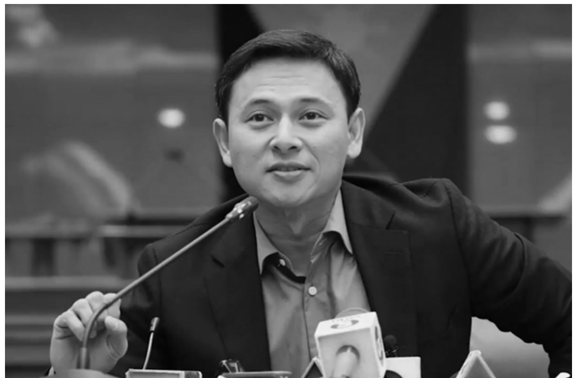
Senator Sonny Angara (File photo)