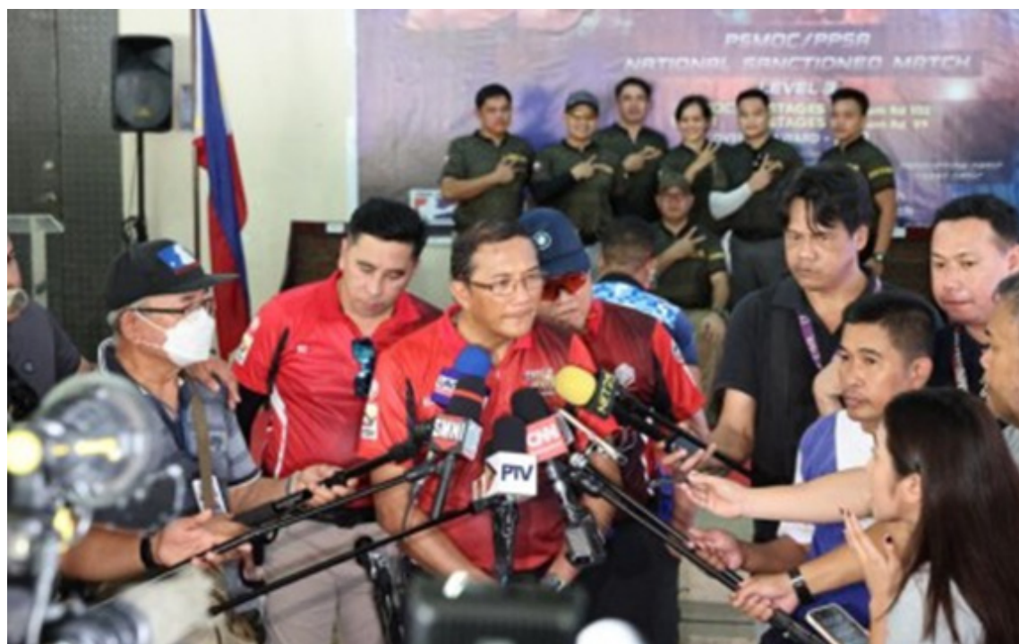
PNP chief Gen. Benjamin Acorda Jr.