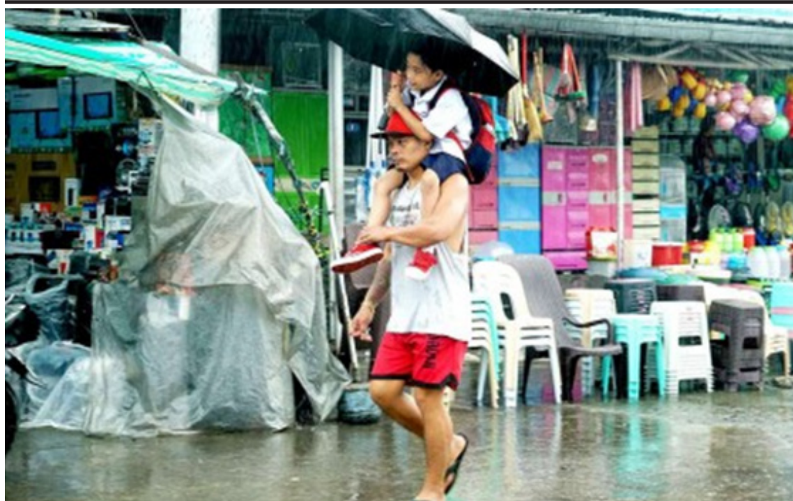
RAINY DAY. A man carries a boy over his shoulders as they share an umbrella on a rainy day in this undated photo. Most areas in the country will experience rain showers due to the southwest monsoon or habagat on, the weather bureau said. (PNA file photo)

The whole archipelago will experience light to moderate winds and slight to moderate seas, Castañeda said. (PNA)