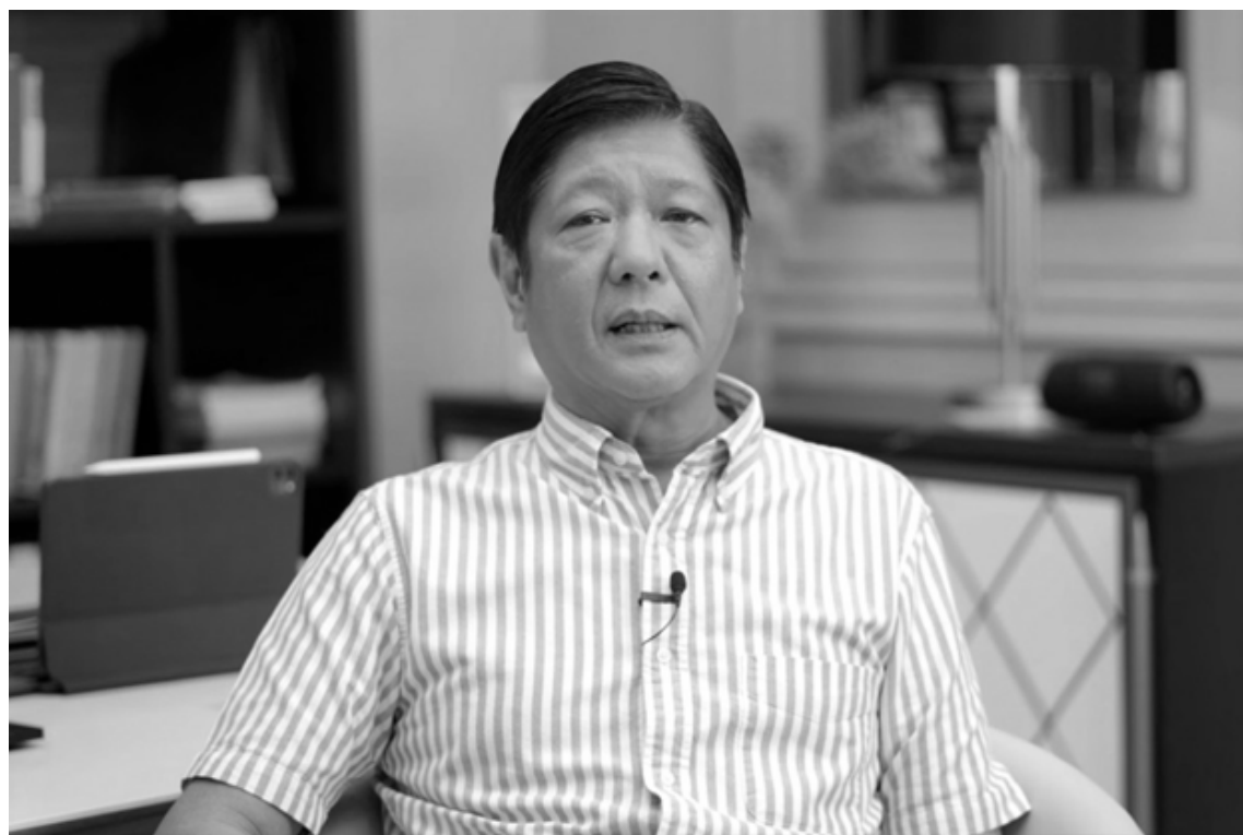
President Ferdinand “Bongbong” Marcos Jr (File photo)