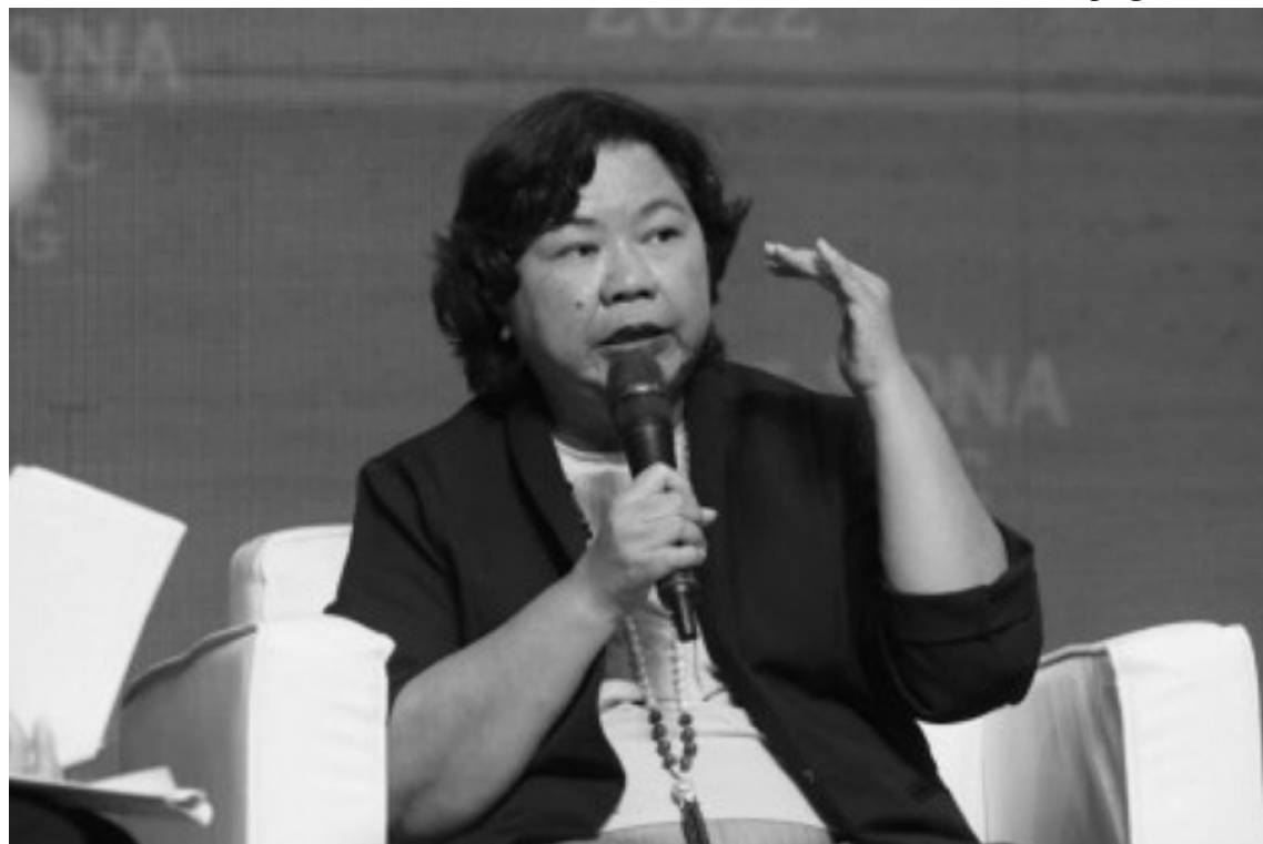
PIA NCR (File photo)