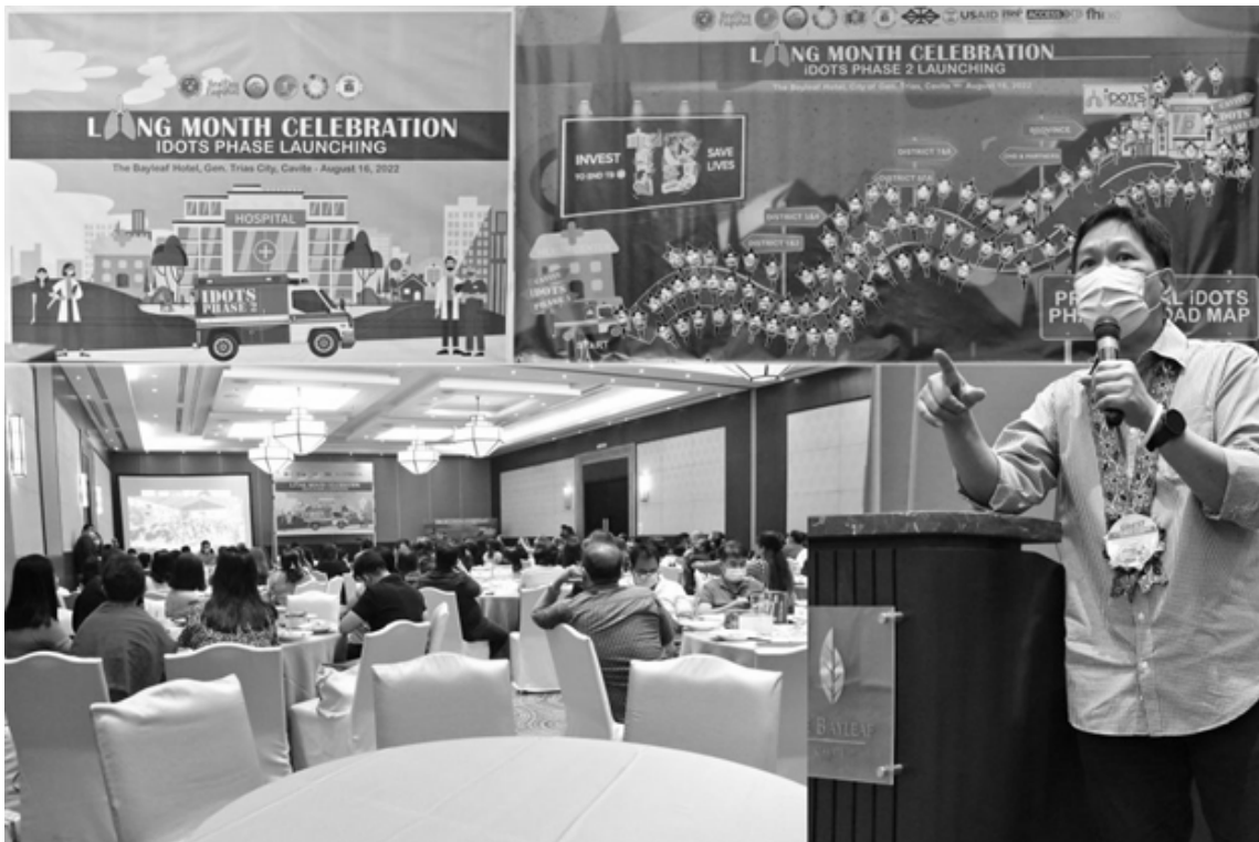
Provincial Lung Month Celebration and Ceremonial Launching (File photo)

CAVITE observed Provincial Lung Month Celebration and Ceremonial Launching of iDOTS Phase II on August 16, 2022, at The Bayleaf in the City of General Trias, through the Provincial Health Office.