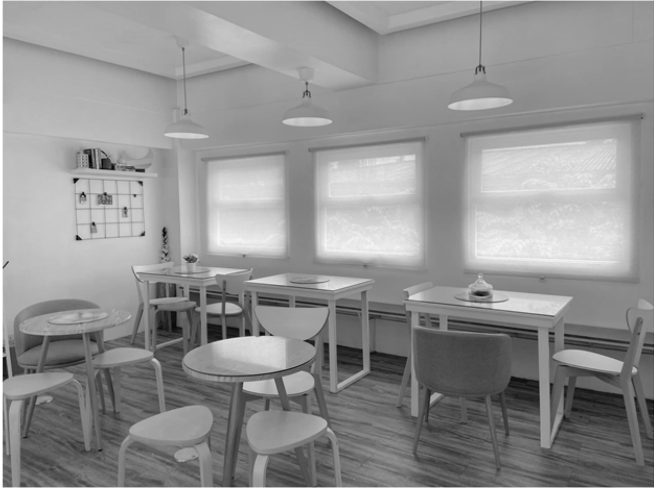
The café appears to have a replica of minimalist cafés in Korea with its neutral palette, white tiled floors, gold and gray furniture.

You don't have to take a trip to Korea anytime soon, because visiting 8.14 café which operates from 10:00 am to 7:00 pm, daily, will somehow give you a picture of their culture. (JCR/AMB/KJCR, PIA La Union)