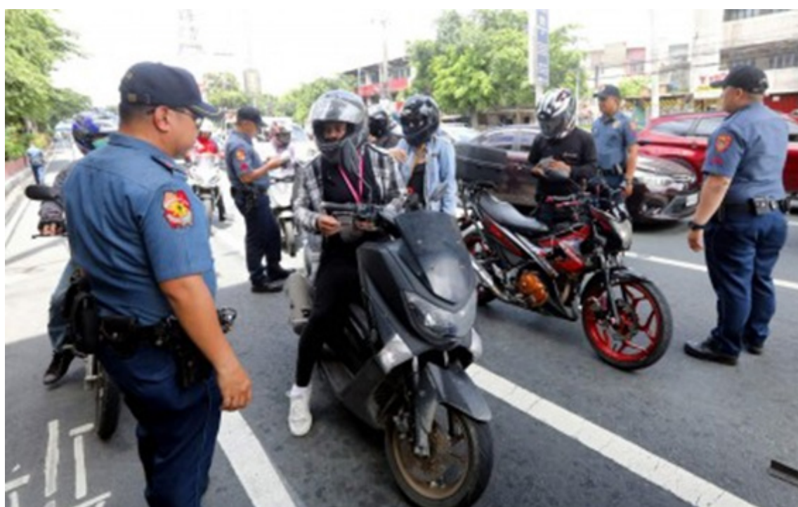
BSKE PERIOD BEGINS. Manila Police District Police Station 4 personnel conduct a checkpoint along the España Boulevard in Manila on Monday (Aug. 28, 2023), at the start of the election period for the Barangay and Sangguniang Kabataan Elections. The Philippine National Police said body cameras will be provided to police officers deployed to poll checkpoints.