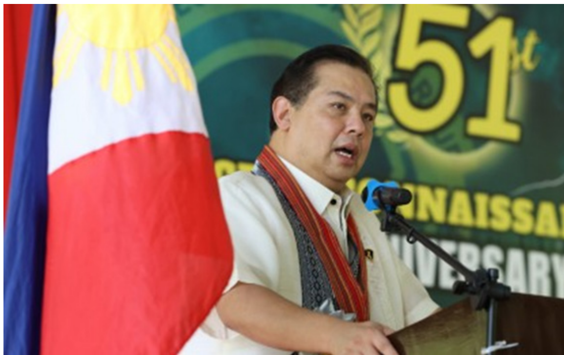
MUP PENSION SYSTEM. Speaker Martin Romualdez delivers his message during the 51st Anniversary of Force Reconnaissance Group at the Headquarters of the FRG, Marine Barracks, Camp Gregorio Lim in Ternate Cavite on Wednesday (Aug. 23, 2023). He assured that Congress is working to fix the problems besetting the pension system for the Military and Uniformed Personnel.