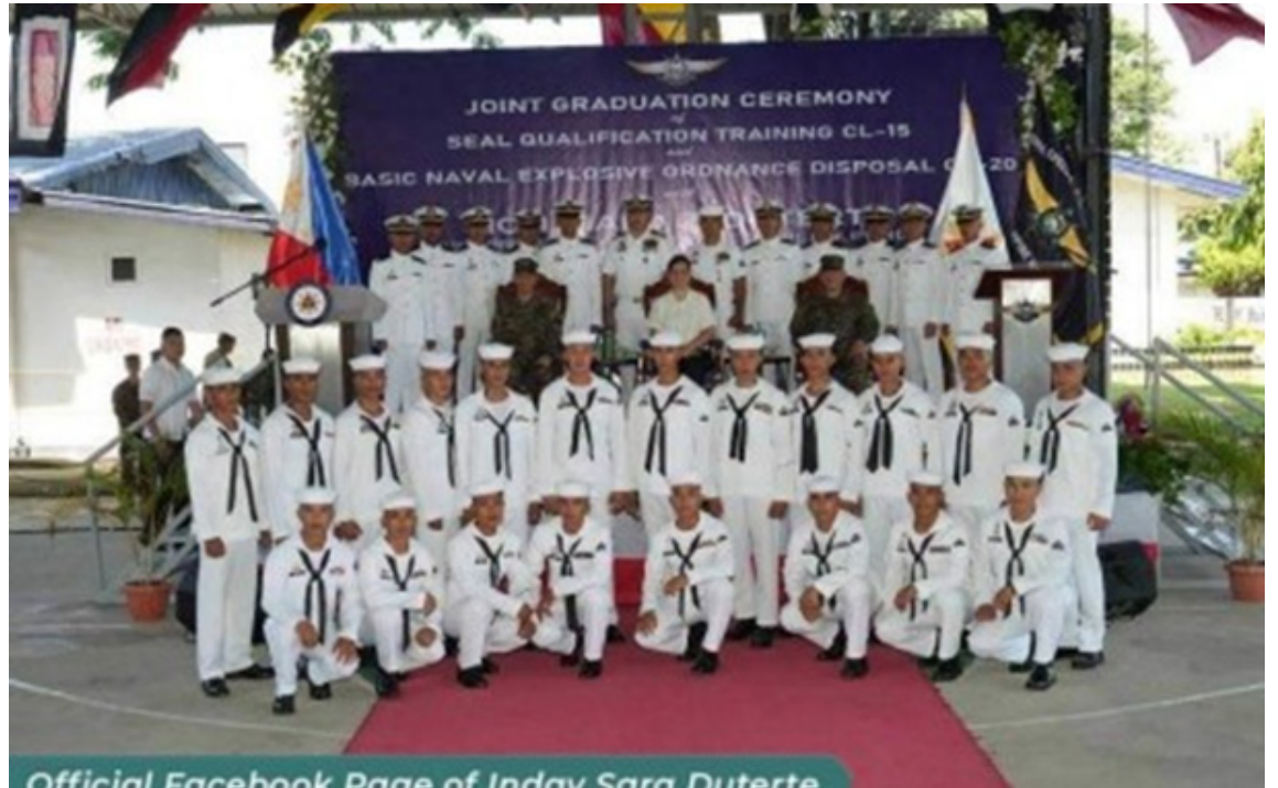
JOINT GRADUATION. Vice President Sara Duterte attends as guest of honor during the graduation ceremony of the Philippine Naval Special Operations Command (Navsocom) at the Naval Base Heracleo Alano in Sangley Point, Cavite on Wednesday (Aug. 23, 2023). The event was a joint graduation of the SEAL Qualification Training (SQT) Class 15 and Basic Naval Explosive Ordnance Disposal Course (BNEOD) Class 20.

Duterte was also invited as the guest of honor of Navsocom's 66th founding anniversary last year.