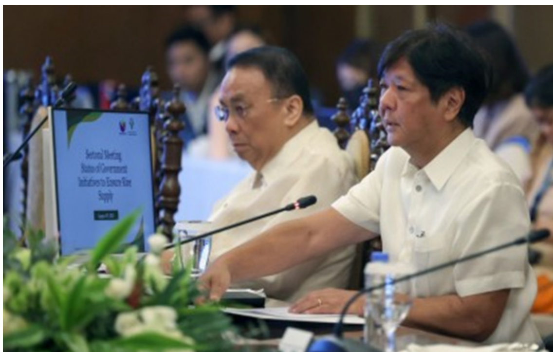
STABILIZING RICE PRICES. President Ferdinand R. Marcos Jr. on Tuesday (Aug. 29, 2023) convenes a meeting with concerned sectors to discuss updates on initiatives being undertaken to stabilize rice supply and prices. Marcos directed all concerned agencies to utilize the available legal tools to control the price of rice and make it affordable.

Marcos said the price of Continued on page 2