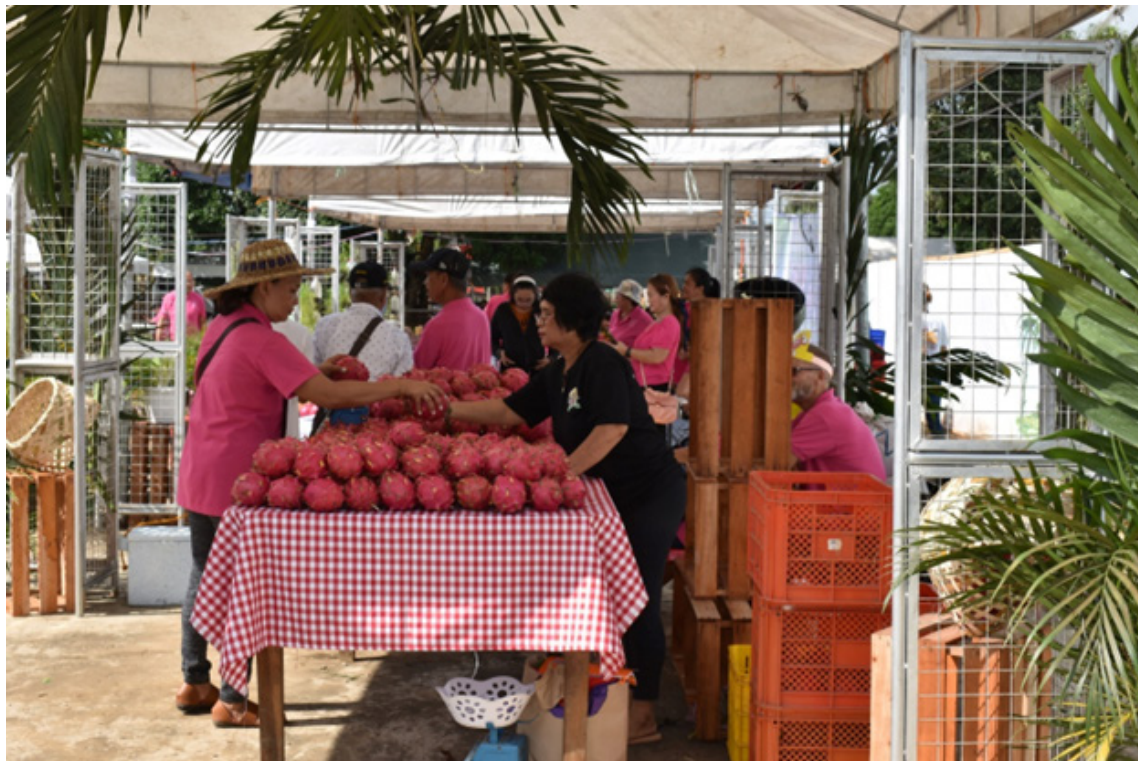
Selling dragon fruits in a trade fair is one of the highlights of the Dragon Fruit Festival in Guimaras.

The annual festival and the outpouring support of the public and private sectors are testaments of how dragon fruits thrive in an island blessed with gifts of nature. Sure thing, cultivating dragon fruits can be a handful, yet, its benefits abound contributing to the economic growth and agricultural industry of Guimaras. (AAL/LMLE/PIA-Iloilo/With reports from Guimaras Province)