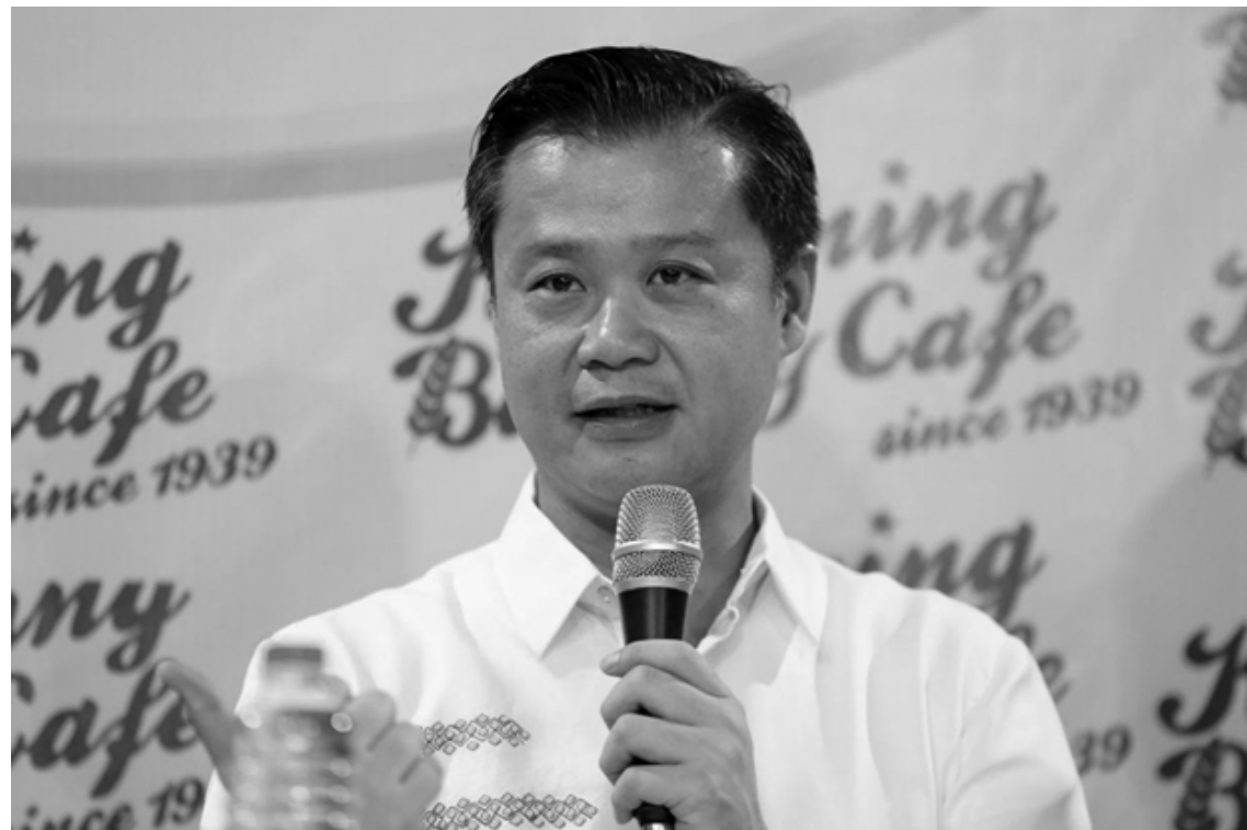
Caption: Senator Win Gatchalian is urging the administration to ensure that learners with disabilities are not left behind in the education sector’s recovery from the impact of the COVID-19 pandemic. 2 Dec. 22 file.