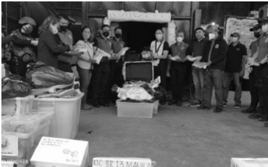
DESTROYED. Representatives from PDEA and other government agencies lead the destruction of over PHP7.2 billion worth of illegal drugs in Trece Martires City, Cavite on Tuesday (Dec. 20, 2022). The seized dangerous drugs were destroyed through thermal decomposition or thermolysis which involves breaking down chemical compounds with the use of tremendous heat.

Since its inception in 1995, PEZA has established 421 ecozones across the country that were approved through Presidential proclamations. Of the total, 300 are IT parks