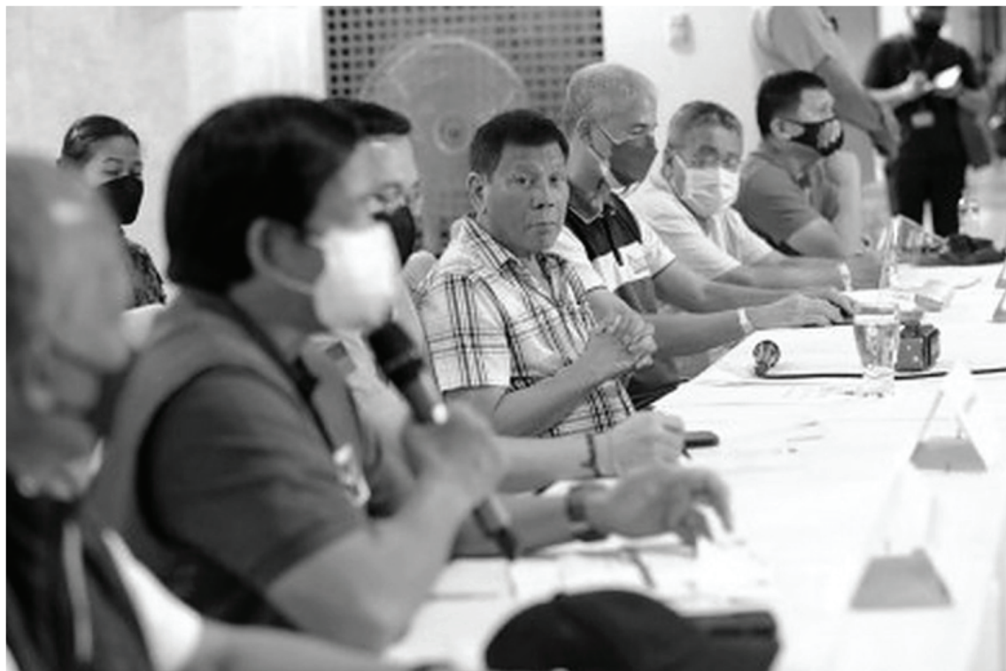
President Rodrigo Roa Duterte presides over a meeting with local officials of Negros Occidental, uniformed personnel, and officials from the national and local based government agencies to assess the extent of Typhoon Odette's damage as well as discuss the response and relief efforts of concerned government agencies at the Kabankalan City Hall in Kabankalan, Negros Occidental on December 20, 2021.