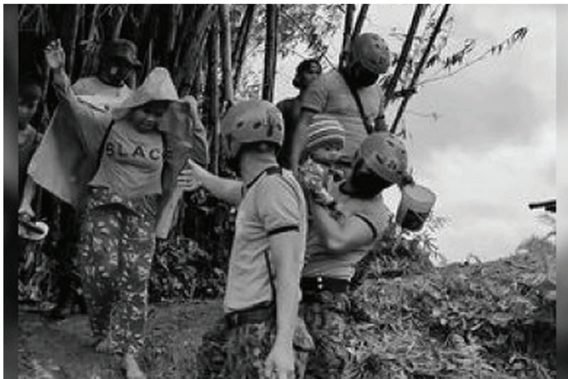
Policemen in Ormoc City facilitate evacuation in Don Potenciano Larrazabal village on Thursday (Dec. 16, 2021). Some 82,080 residents in Eastern Visayas have heeded the call for early evacuation ahead of Typhoon Odette's landfall.