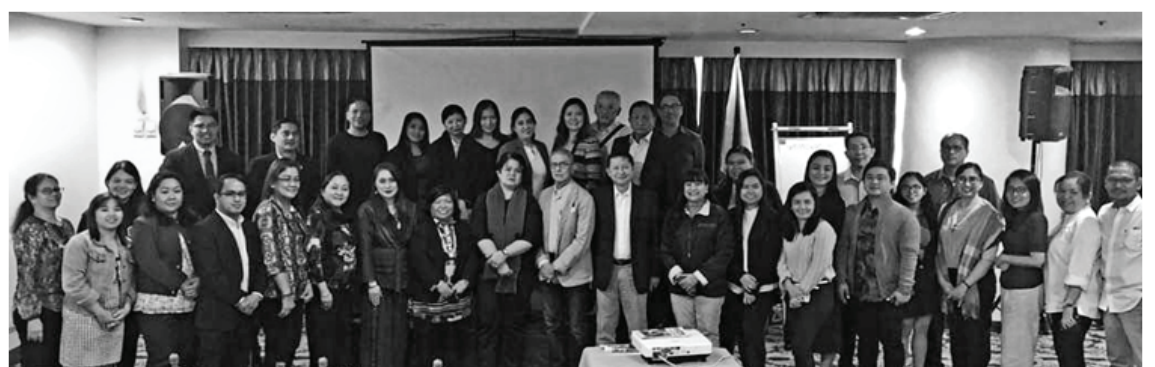
Photo shows speakers and participants of the International Certification Awareness Seminar at the Makati Palace Hotel.