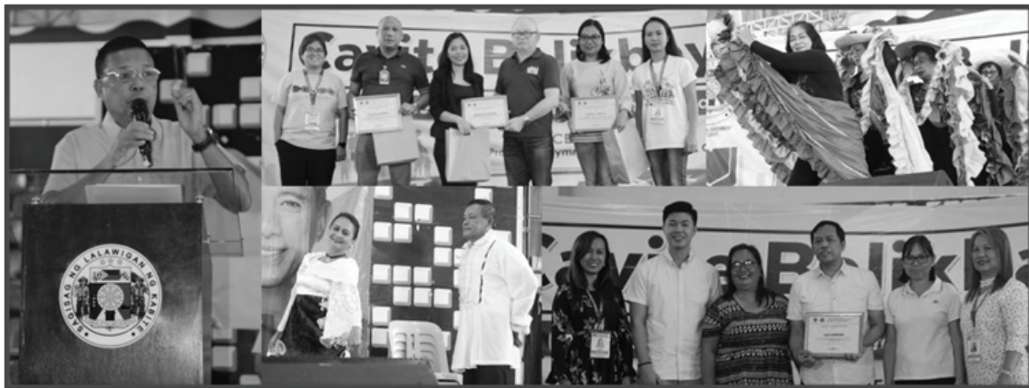
Cavite MSMEs Business Conference