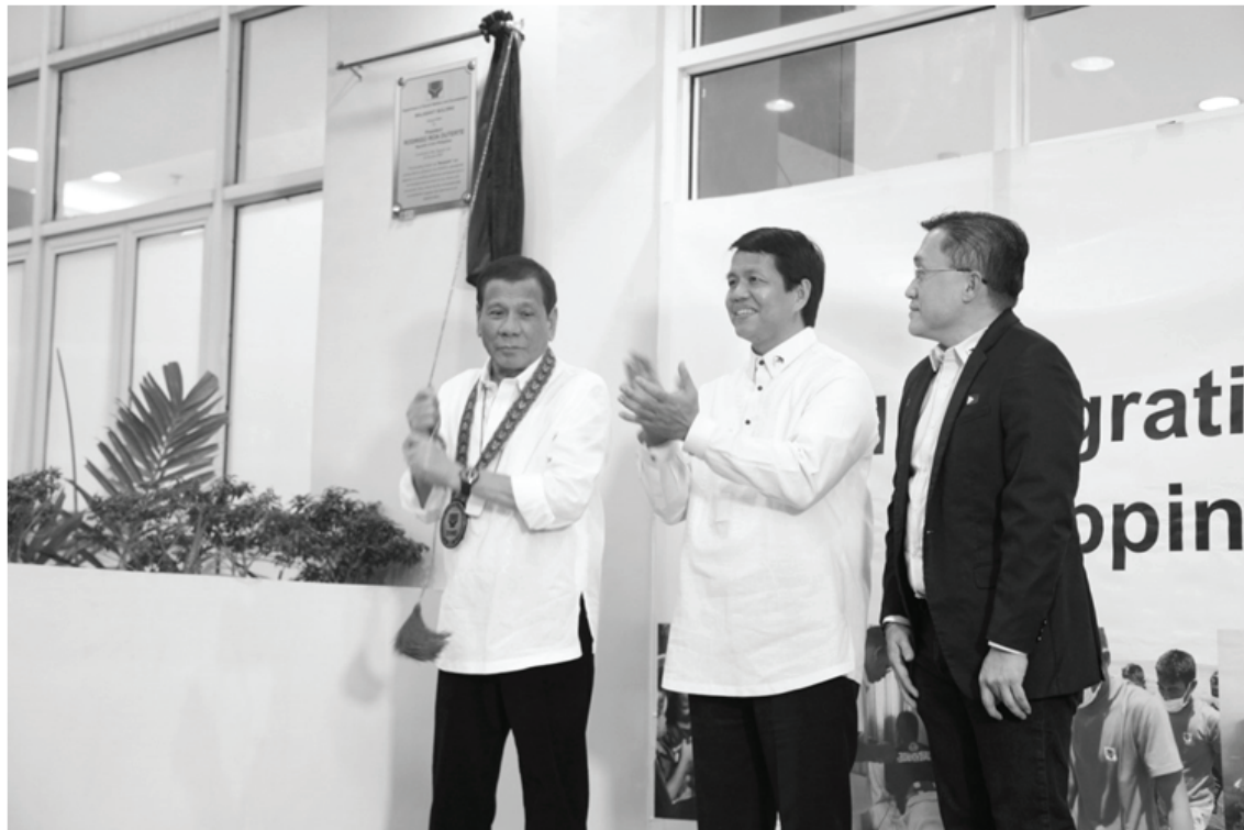
President Rodrigo Duterte unveils the marker of the newly built 'Malasakit Building' during DSWD's 69th Founding Anniversary on Wednesday, Jan. 29, 2020. Also in photo are DSWD Secretary Rolando Bautista and Senator Bong Go.