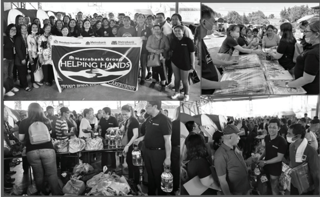
PGC Open door for donation