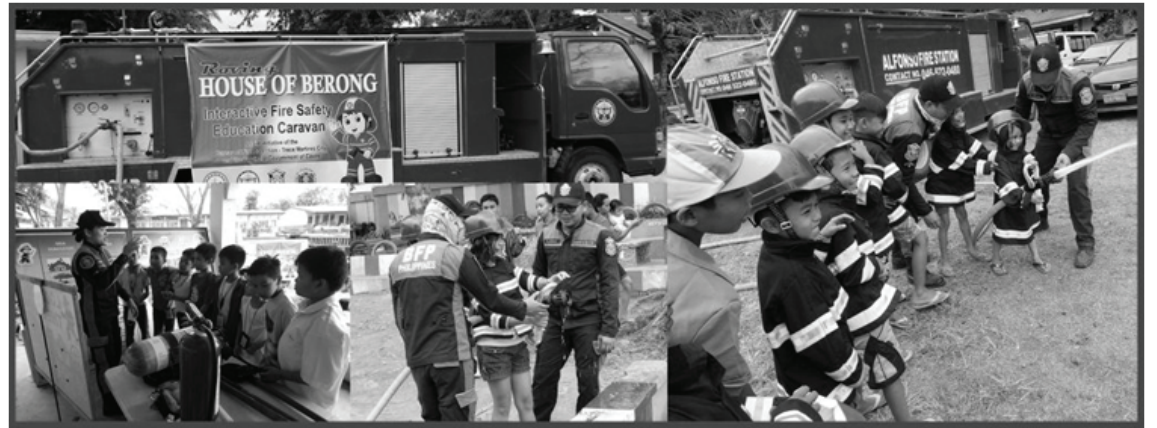
Fire Safety Education

First stop of the fire safety caravan was at Matagbak Elementary School followed by Marahan Elementary School both in the town of Alfonso. The team from BFP-TMC are also targeting to visit evacuation centers in other LGUs to conduct more education campaign for children.