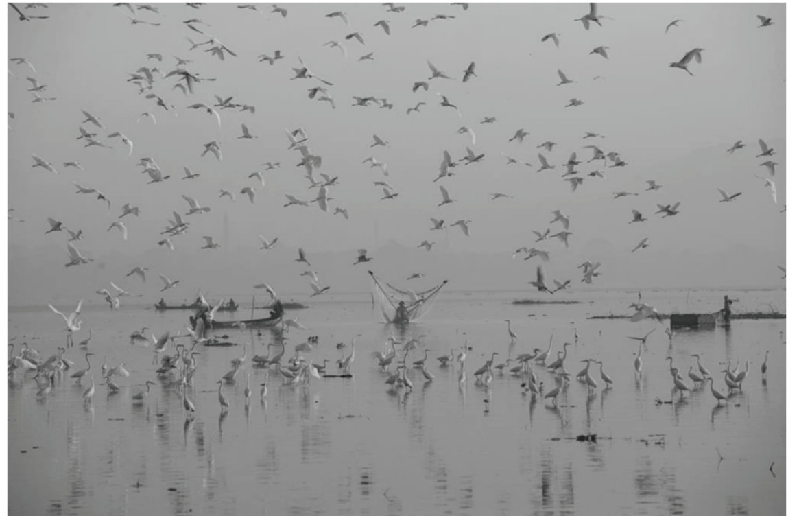
Rich in biodiversity, wetlands are home to two out of five of the world's species.

As the region works to restore, conserve, and sustainably use its wetlands, the ACB is working with the AMS to create a more robust network of wetlands that can substantially contribute to species conservation, ecosystem services, and mitigate against climate change. Through our concerted efforts, wetlands can remain effective providers and protectors.