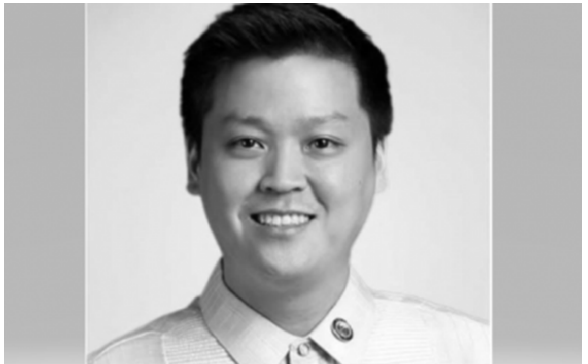
New DSWD Secretary Rex Gatchalian